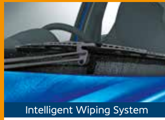
Intelligent Wiping System