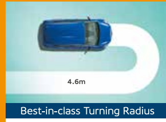
Best-in-class Turning Radius