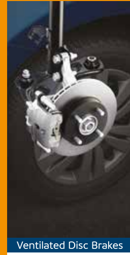
Ventilated Disc Brakes