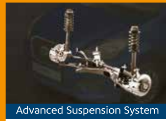
Advanced Suspension System