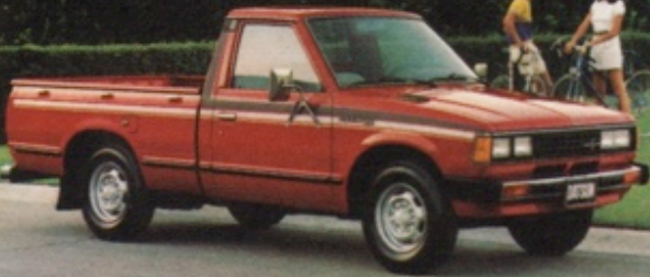
Li'l Hustler Deluxe, with optional tripod mirrors, body side moldings, chrome step bumper and sport accent stripes.