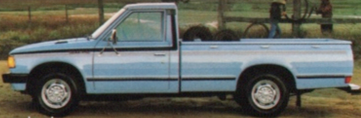
Long bed, with optional tripod mirrors, body side moldings, chrome step bumper and sport accent stripes.