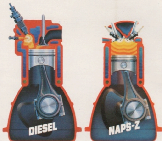
New Nissan Diesel: economy and power.