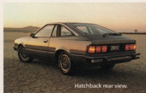
Hatchback rear view.