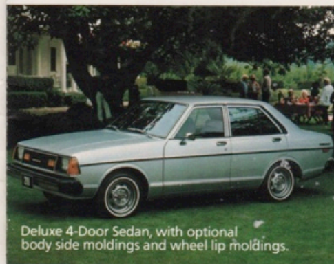
Deluxe 4-Door Sedan, with optional body side moldings and wheel lip moldings.

†Vehicles with optional equipment or California emissions equipment will be slightly heavier. ††Standard model: 1905.