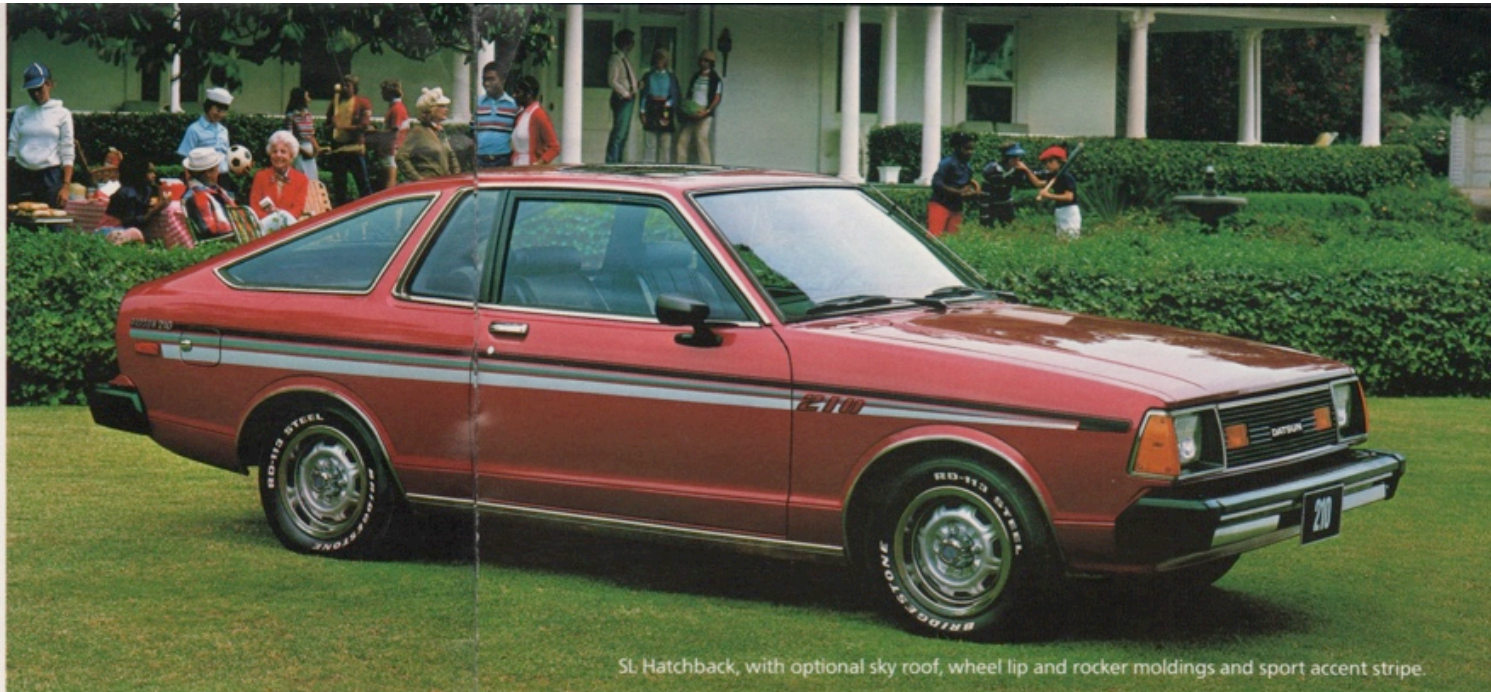
SL Hatchback, with optional sky roof, wheel lip and rocker moldings and sport accent stripe.