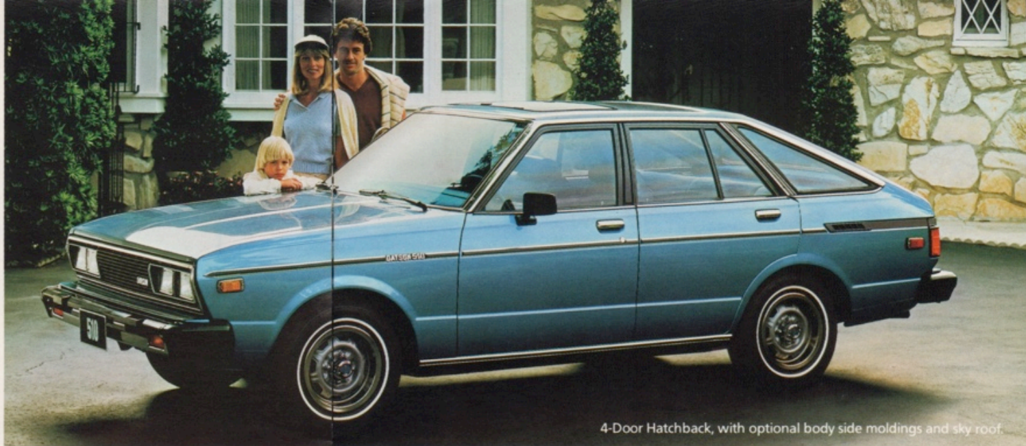
4-Door Hatchback, with optional body side moldings and sky roof.