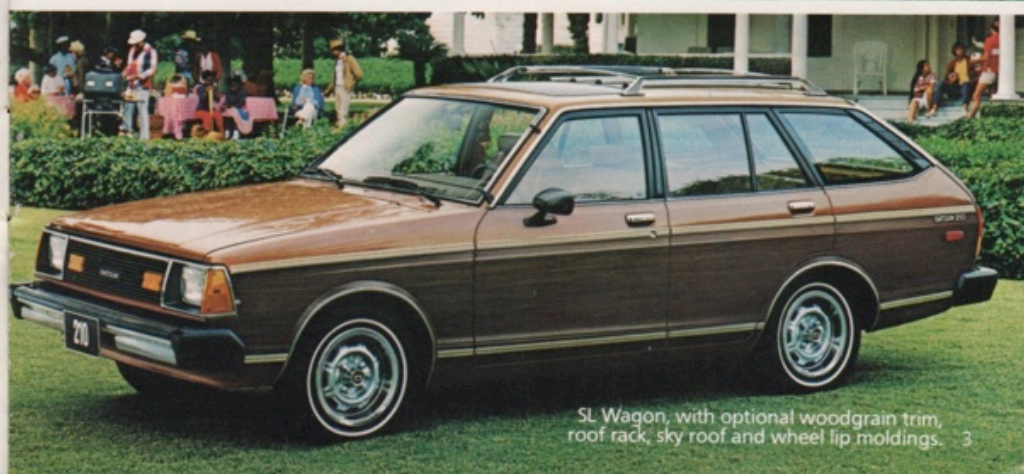
SL Wagon, with optional woodgrain trim, roof rack, sky roof and wheel lip moldings.