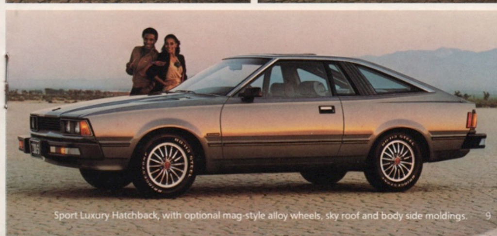
Sport Luxury Hatchback, with optional mag-style alloy wheels, sky roof and body side moldings.