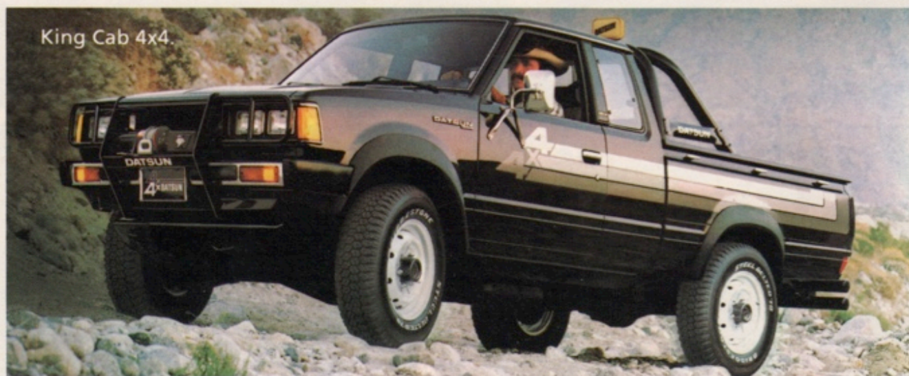
King Cab 4x4.