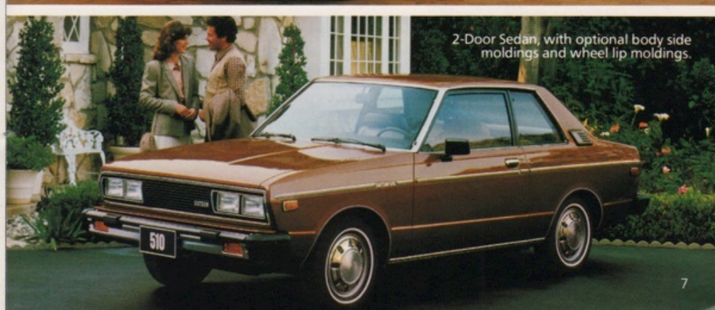
2-Door Sedan, with optional body side moldings and wheel lip moldings.