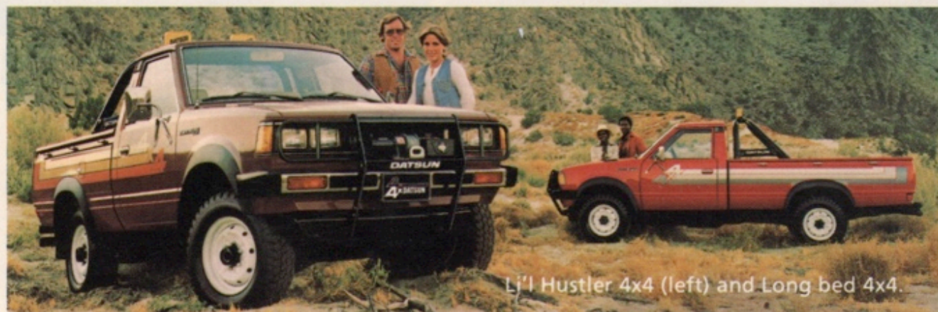
Lj'l Hustler 4x4 (left) and Long bed 4x4.

Above trucks shown with optional grille and brush guards, winch, tripod mirrors, light bar, halogen off-road lights, graphic stripes, tubular rear bumper, fender flares and body side moldings.