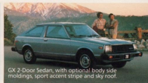
GX 2-Door Sedan, with optional body side moldings, sport accent stripe and sky roof.