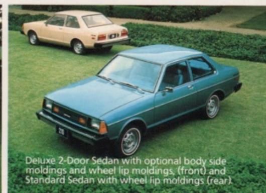
Deluxe 2-Door Sedan with optional body side moldings and wheel lip moldings. (front) and Standard Sedan with wheel lip moldings (rear).