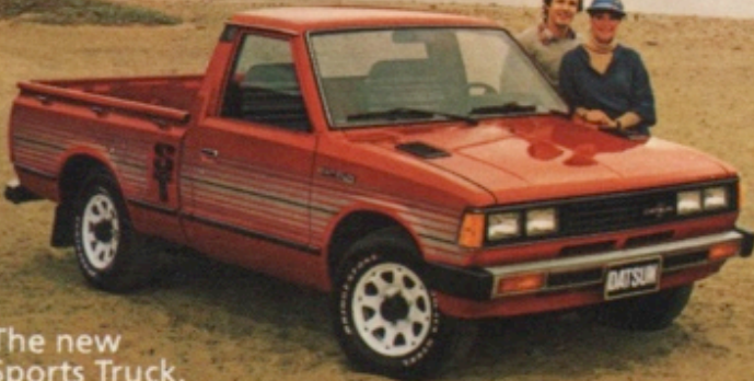
The new Sports Truck.