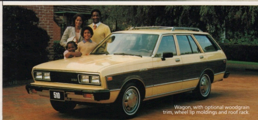
Wagon, with optional woodgrain trim, wheel lip moldings and roof rack.

**Vehicles with optional equipment or California emissions equipment will be slightly heavier.