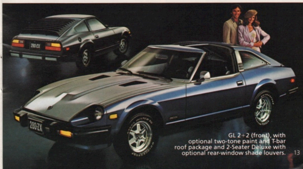
GL 2+2 (front), with optional two-tone paint and T-bar roof package and 2-Seater Deluxe with optional rear-window shade louvers.