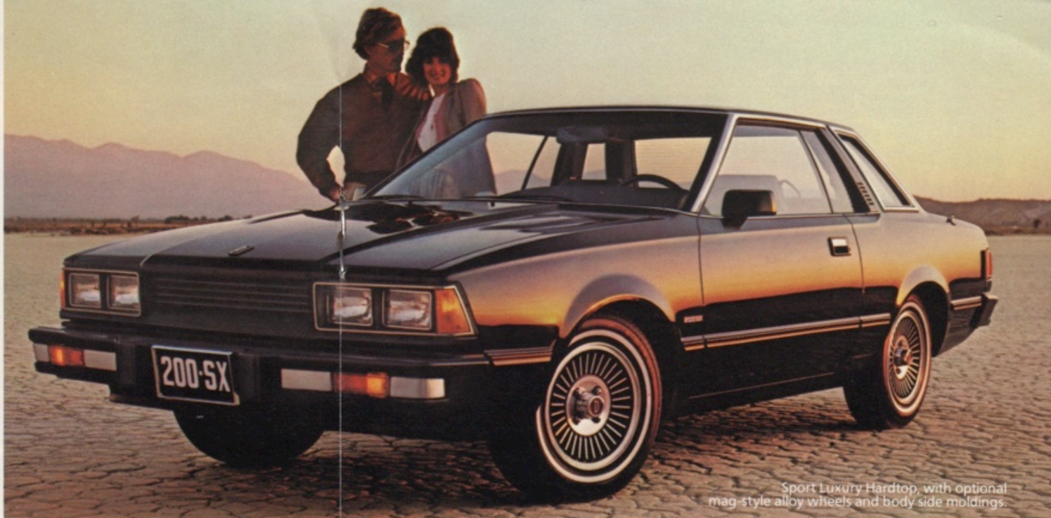
Sport Luxury Hardtop, with optional mag-style alloy wheels and body side moldings.