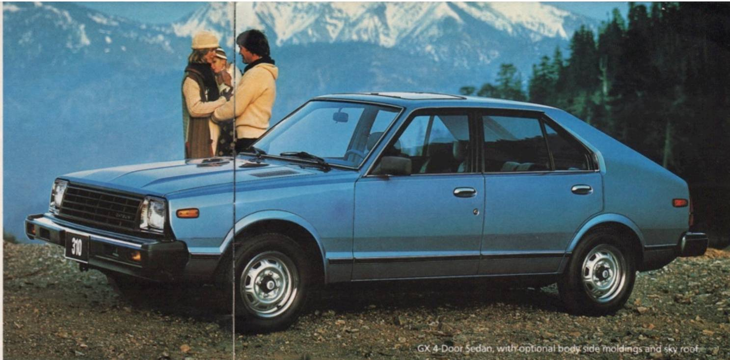
GX 4-Door Sedan, with optional body side moldings and sky roof