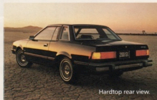
Hardtop rear view.

**Vehicles with optional equipment or California emissions equipment will be slightly heavier.