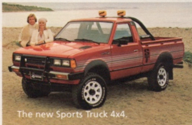
The new Sports Truck 4x4.