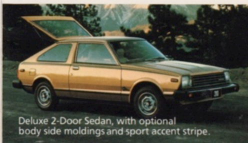
Deluxe 2-Door Sedan, with optional body side moldings and sport accent stripe.

**Vehicles with optional equipment or California emissions equipment will be slightly heavier.