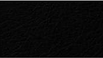
Dark grey leather option on SX