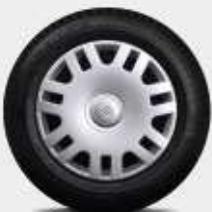
14” wheels with Milan wheel covers