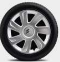
Cheetah 16” alloy wheels with low profile tyres