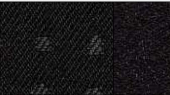
Dark grey 'Matrix' cloth on L