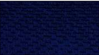
'Atomic' velour on SX