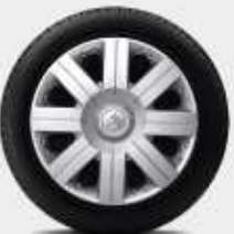
15” wheels with Pelican wheel covers