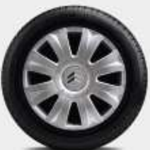
15” wheels with Inca wheel covers