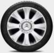
Suzuka 16” alloy wheels with low profile tyres