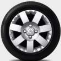
Coyote 15” alloy wheels with low profile tyres