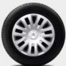
14” wheels with Condor wheel covers