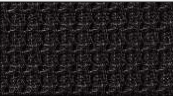
3D Simailla' mesh cloth on Design