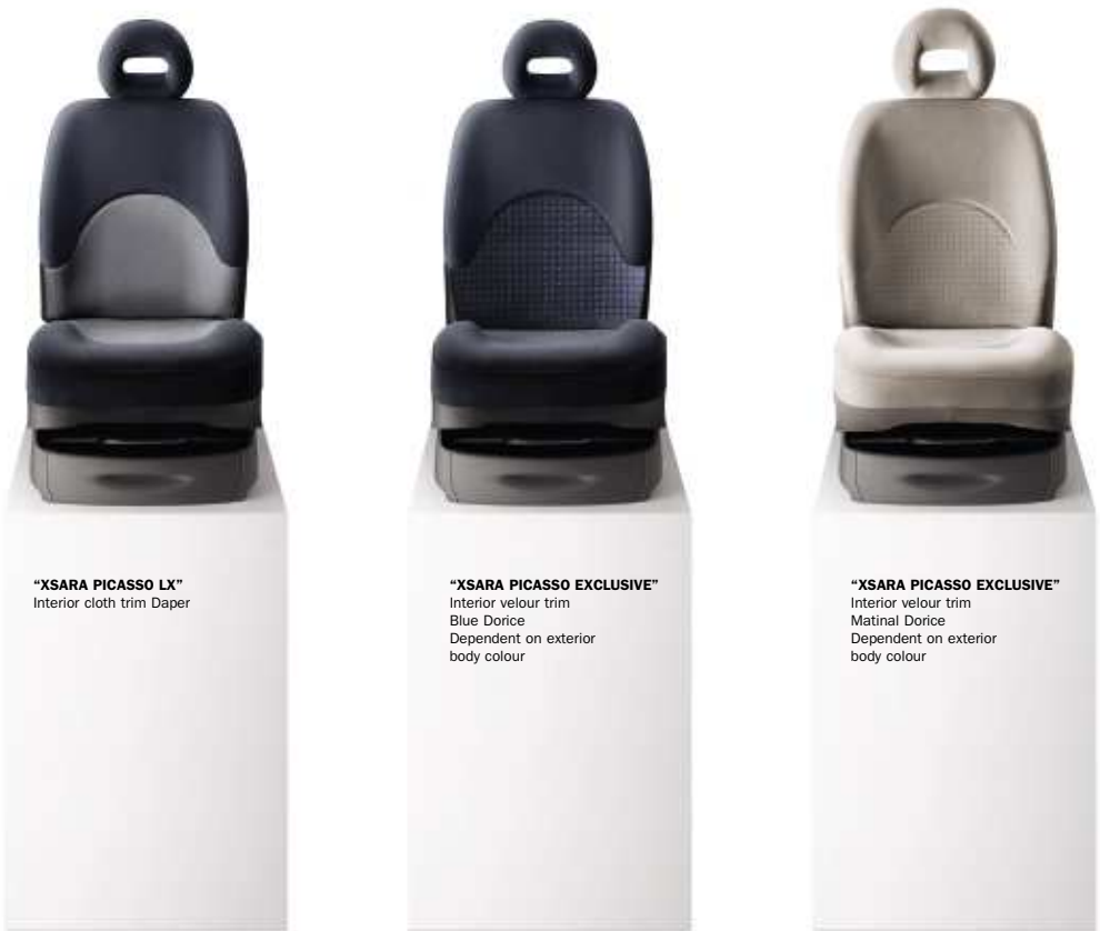
“XSARA PICASSO LX” Interior cloth trim Daper