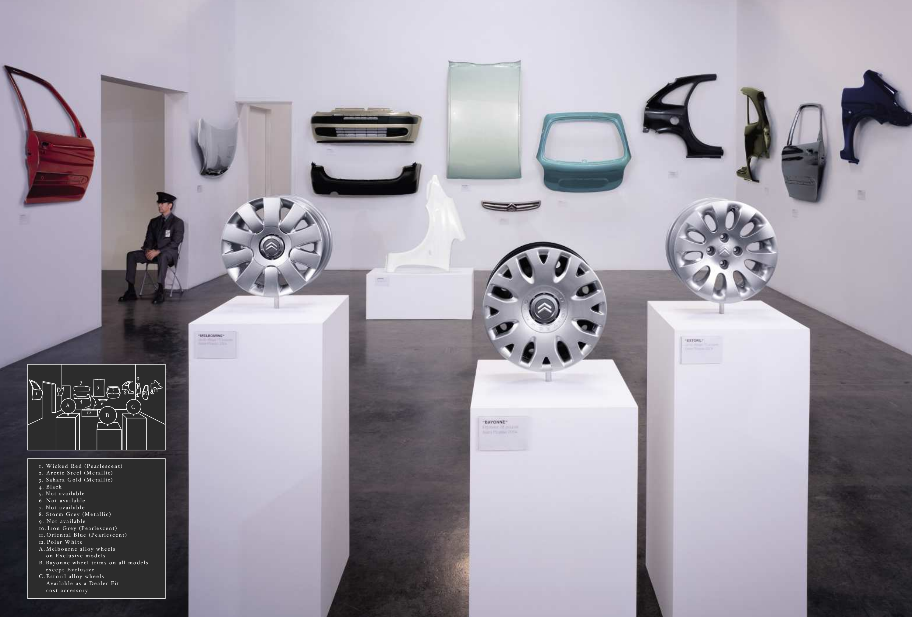
"MELBOURNE" 2000-2004 1.5i 1600cc 2004-2006 1.7i 1700cc