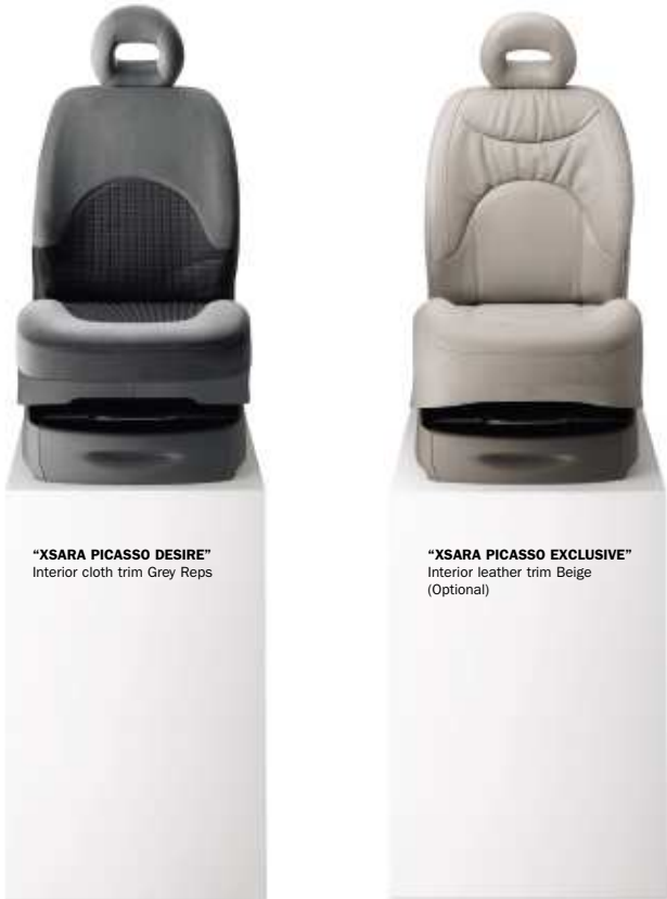
“XSARA PICASSO DESIRE” Interior cloth trim Grey Reps