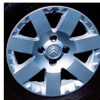
15" Alloy wheels with broad 185/65 R15 tyres combine style and safety