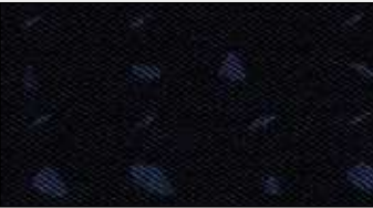
'Tomy' cloth on Design