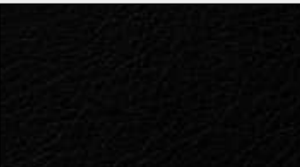
Dark grey leather option on SX