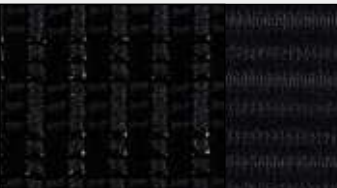
Dark grey 'Reps' cloth on Stop & Start