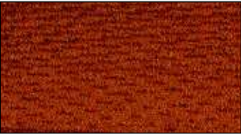
'Atomic' velour on SX