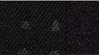
Dark grey 'Matrix' cloth on L