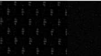
'Neutron' mesh on VTS