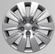
STANDARD 17-INCH WHEEL COVERS