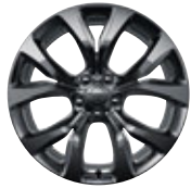
AVAILABLE (FWD/AWD) 19-INCH HYPER BLACK ALUMINUM