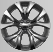
AVAILABLE (FWD/AWD) 19-INCH POLISHED ALUMINUM WITH GREY PAINTED POCKETS