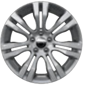
AVAILABLE 18-INCH SATIN SILVER ALUMINUM