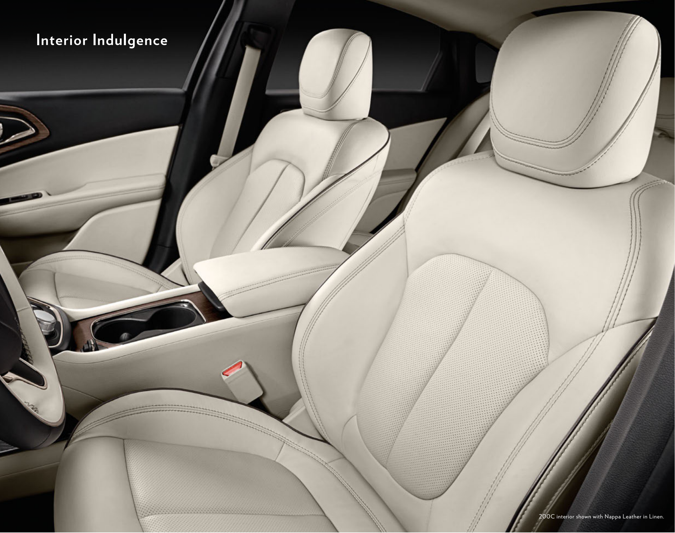
200C interior shown with Nappa Leather in Linen.