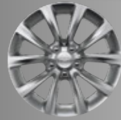
STANDARD (FWD) 17-INCH SATIN SILVER ALUMINUM