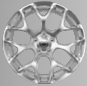
STANDARD (AWD) 18-INCH POLISHED MID-GLOSS ALUMINUM