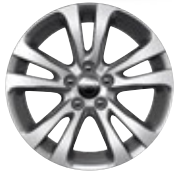
STANDARD 17-INCH TECH SILVER ALUMINUM