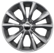
STANDARD (FWD/AWD) 18-INCH SATIN CARBON ALUMINUM