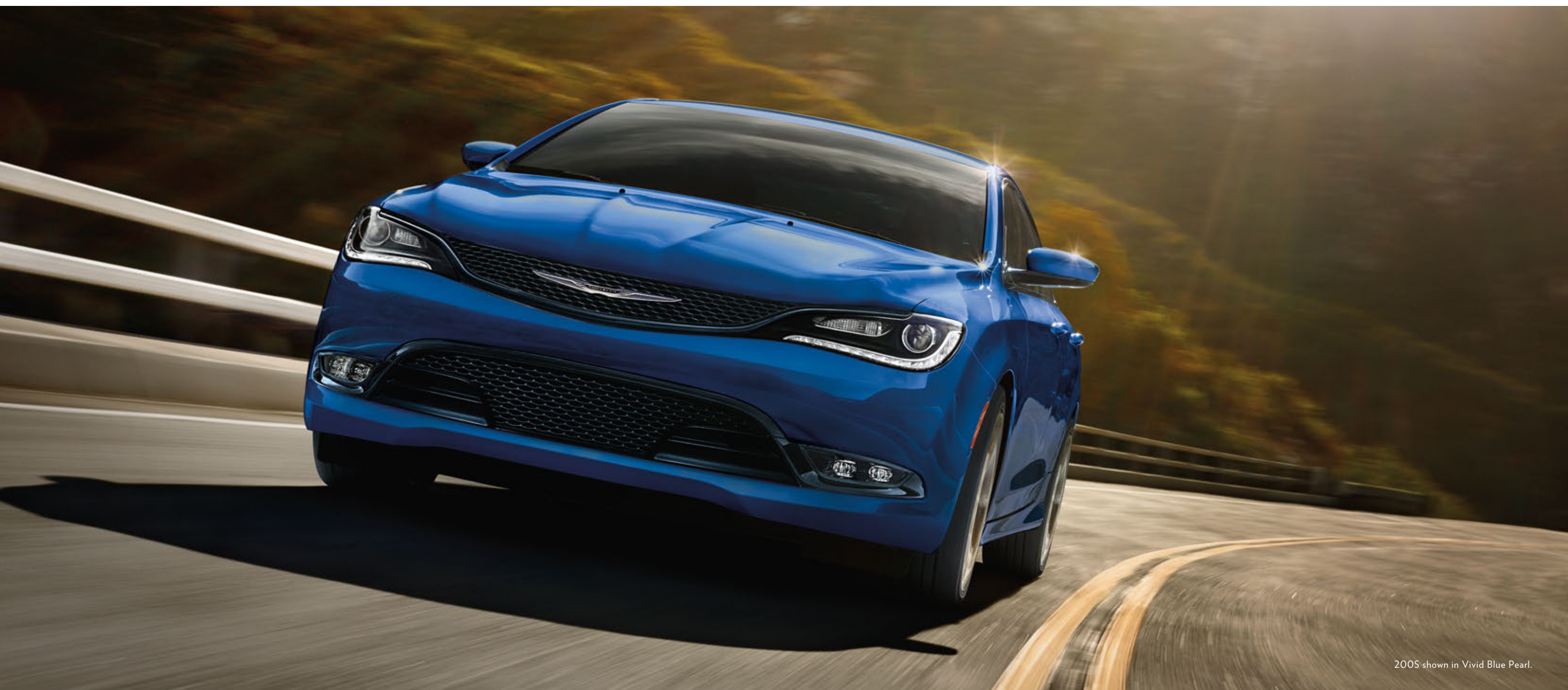
200S shown in Vivid Blue Pearl.

A Ward's "10 Best Engine" for three years † — available on the Limited, 200S and 200C models — it applies some of the most advanced engine technologies and is one of the lightest and quietest of its kind. Ninety percent of the class-leading 2 295 horsepower and exceptional 262 lb-ft of torque is delivered between 1600 and 2400 rpm, resulting in a smooth, responsive driving experience that also delivers impressive fuel efficiency of 7.5 L/100 km (38 mpg) highway.*