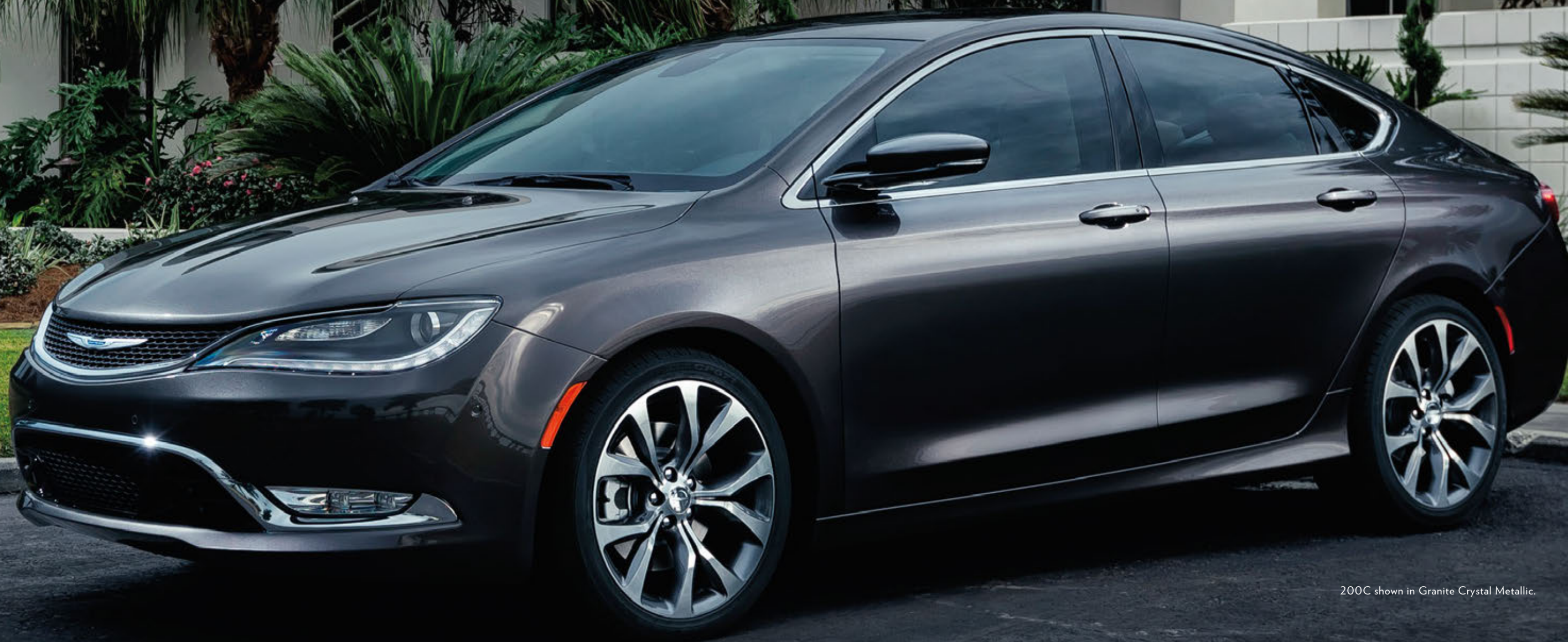
200C shown in Granite Crystal Metallic.