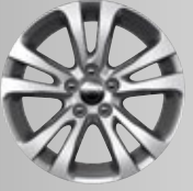
STANDARD 17-INCH TECH SILVER ALUMINUM