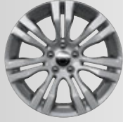
AVAILABLE 18-INCH SATIN SILVER ALUMINUM