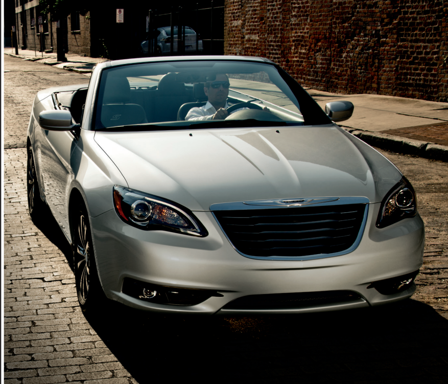
2014 CHRYSLER 200 CONVERTIBLE