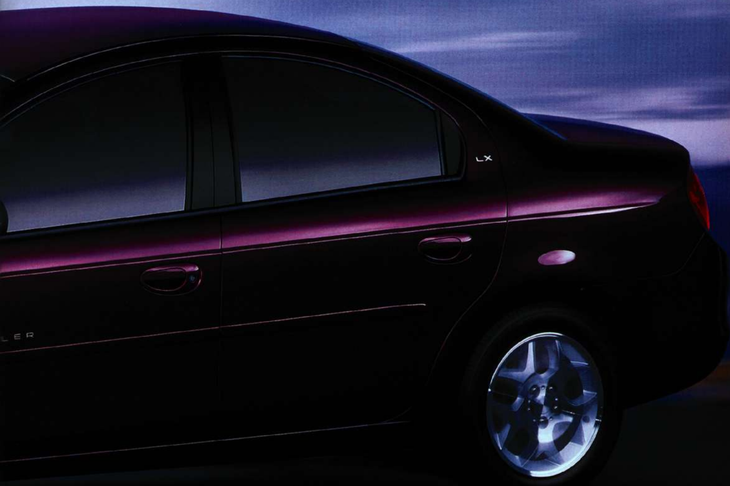
Chrysler Neon LX shown in Deep Cranberry Pearl Coat.