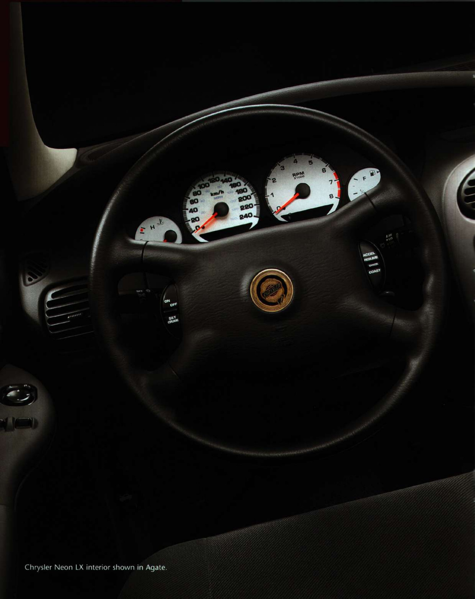
Chrysler Neon LX interior shown in Agate.