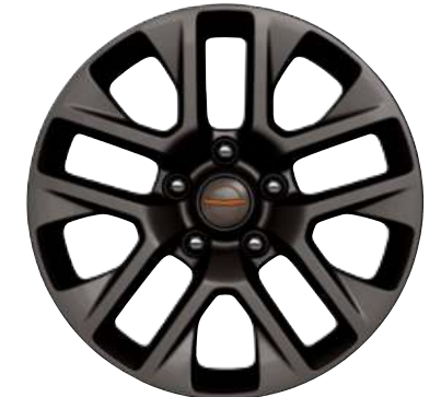
18-INCH LUSTER GRAY POLISHED ALUMINUM WITH ORANGE CHRYSLER WING CENTER CAP BADGING Included with Select Road Tripper (WBF)

Pacifica Select Plug-In Hybrid in Silver Mist Clear Coat