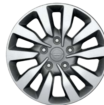
17-INCH DIAMOND-CUT CAST ALUMINUM WITH BALTIC GRAY POCKETS Standard on Select Plug-In Hybrid (WJR)