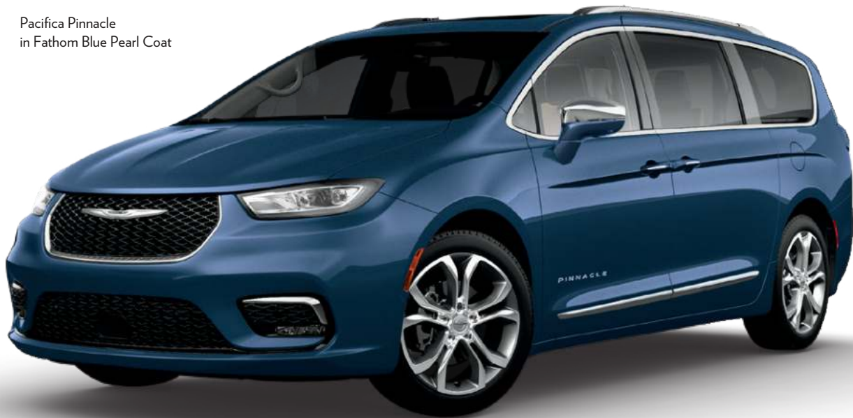
Pacifica Pinnacle in Fathom Blue Pearl Coat