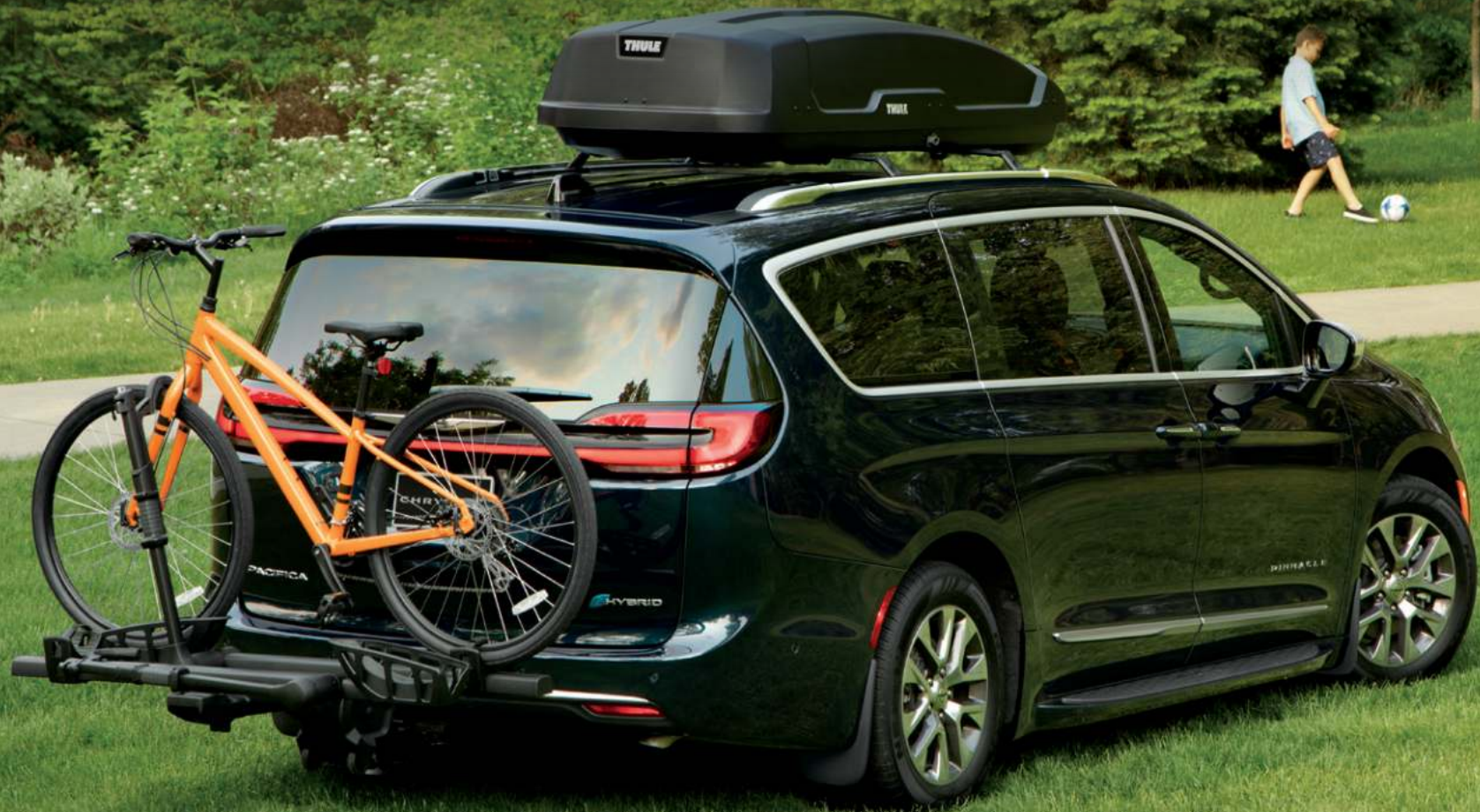
Featured Accessories: Roof Cargo Box, 17 Hitch Bike Rack, 17 Hitch Receiver, Front and Rear Molded Splash Guards, and Running Boards

The Chrysler Pacifica minivan personifies family versatility, efficiency and convenience. A wide range of Authentic Mopar® Accessories — explicitly crafted for your home away from home — lets you take your lifestyle further. From cargo and styling enhancements to premium protection parts, Mopar helps you customize your family's ride. Visit mopar.com or your local Chrysler Brand dealership to see the full line of Mopar Authentic Accessories.