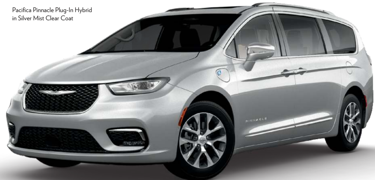
Pacifica Pinnacle Plug-In Hybrid in Silver Mist Clear Coat