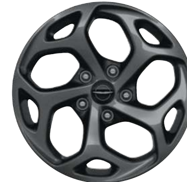
18-INCH CAST ALUMINUM WITH FORESHADOW FINISH Included with S Appearance Package on Select Plug-In Hybrid (WP6)