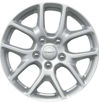
17-INCH FULLY PAINTED TECH SILVER CAST ALUMINUM Standard on Touring (WFN)