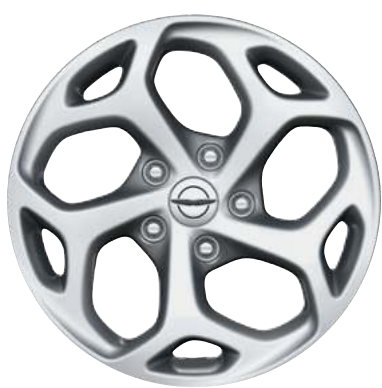
18-INCH PAINTED CAST ALUMINUM Standard on Limited FWD/AWD (WBA)