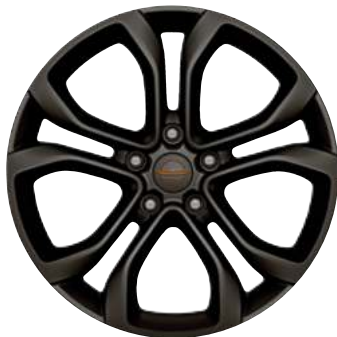
20-INCH LUSTER GRAY POLISHED ALUMINUM Included with Road Tripper Package on Touring L FWD/AWD (WH6)