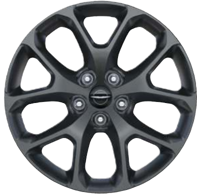
20-INCH CAST ALUMINUM WITH FORESHADOW FINISH Included with S Appearance Package on Limited FWD/AWD (WPF)

Pacifica Limited in Brilliant Black Crystal Pearl Coat