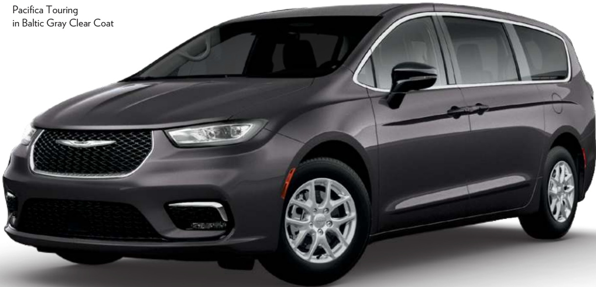
Pacifica Touring in Baltic Gray Clear Coat