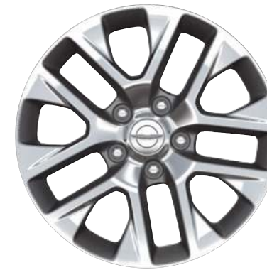
18-INCH POLISHED CAST ALUMINUM WITH BALTIC GRAY POCKETS Standard on Pinnacle Plug-In Hybrid (WDP)