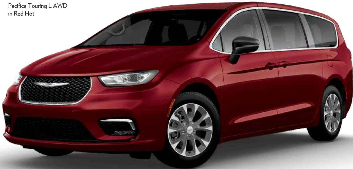
Pacifica Touring L AWD in Red Hot