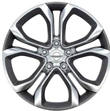
20-INCH POLISHED CAST ALUMINUM WITH BALTIC GRAY POCKETS Standard on Pinnacle FWD/AWD (WH5)