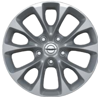
18-INCH FULL-POLISHED HIGH-GLOSS ALUMINUM Standard on Touring L AWD (WBS)