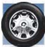
17-inch chrome-clad aluminum wheels standard on 300 Limited