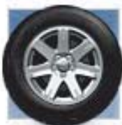
17-inch Machined aluminum wheels standard on 300 Touring