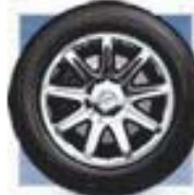
18-inch chrome-clad aluminum wheels standard on 300C