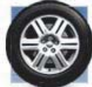
18-inch polished aluminum wheels standard on all 300 AWD models

For more information, please visit www.chrysler.com/300