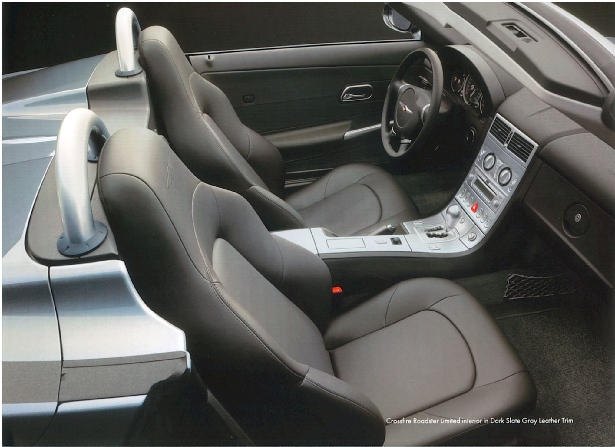
Crossfire Roadster Limited interior in Dark Slate Gray Leather Trim