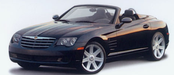
Crossfire Roadster shown in Black

A lock/unlock D-handle is centrally located at the front bow; one simple turn releases the top from the frame and lowers the windows. Touch a button and the top automatically lowers. And by continuing to depress the button, you bring the windows back up. With its race-car-inspired wheels and sports bars, Crossfire Roadster proves that black is anything but basic.