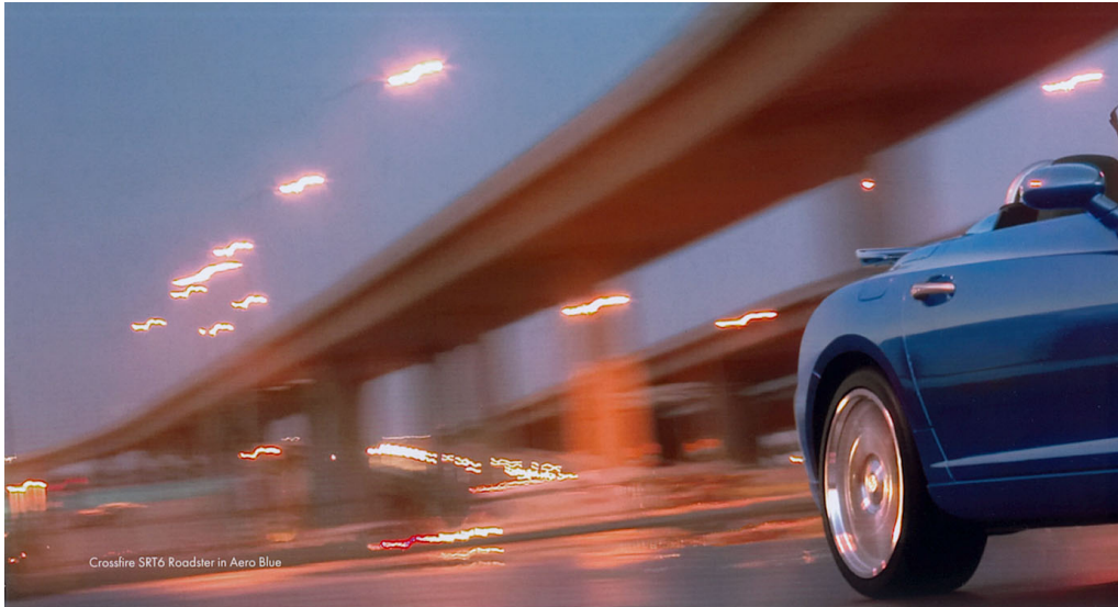
Crossfire SRT6 Roadster in Aero Blue