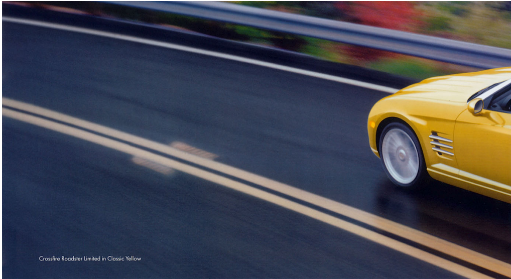
Crossfire Roadster Limited in Classic Yellow