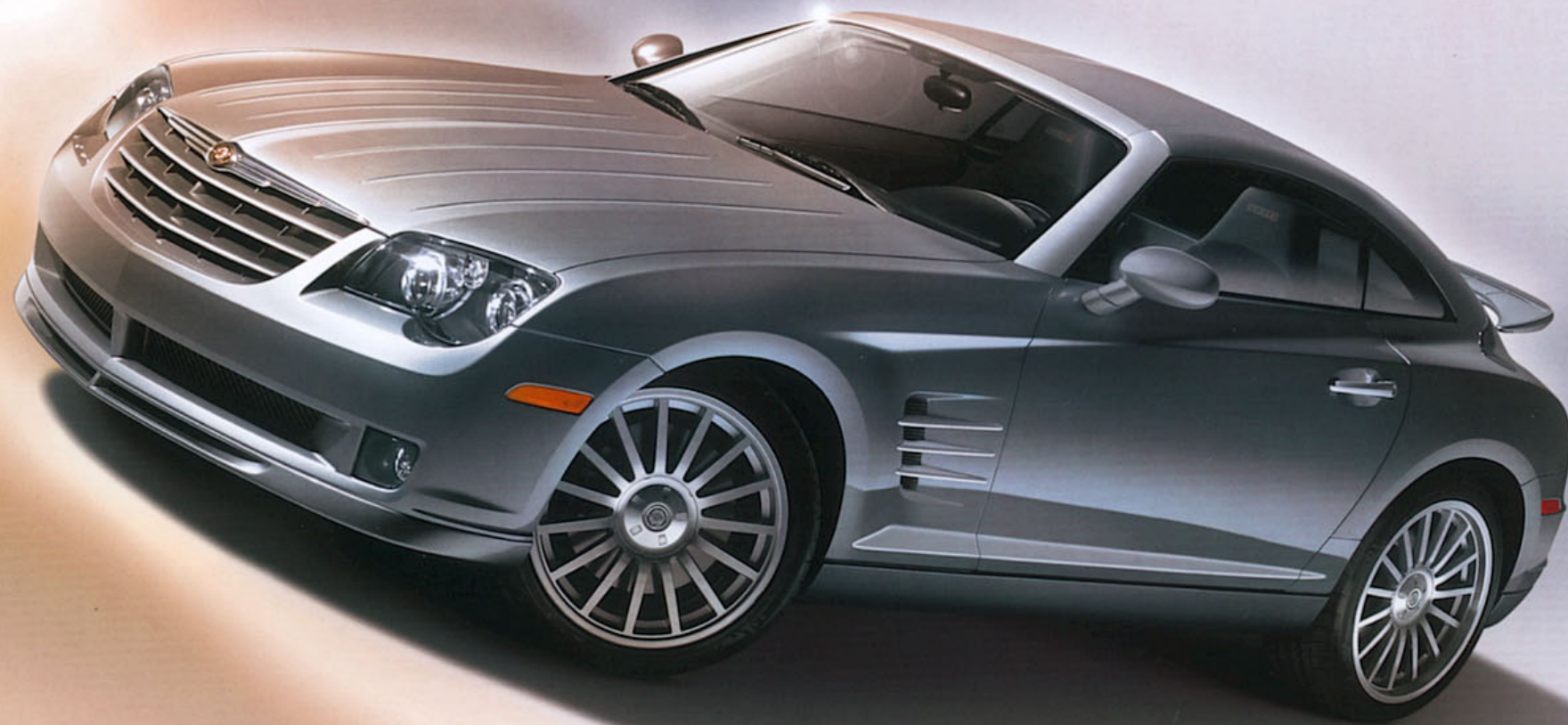
Crossfire SRT6 Coupe in Sapphire Silver Blue Metallic