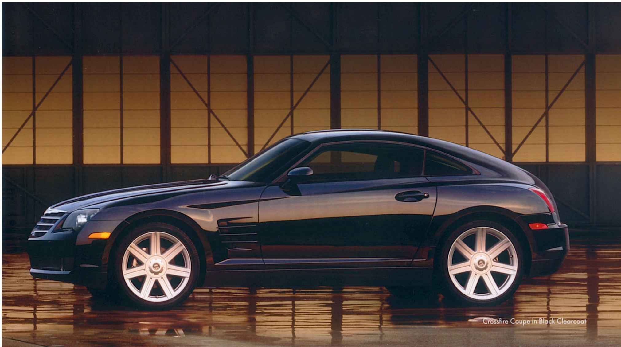
Crossfire Coupe in Black Clearcoat