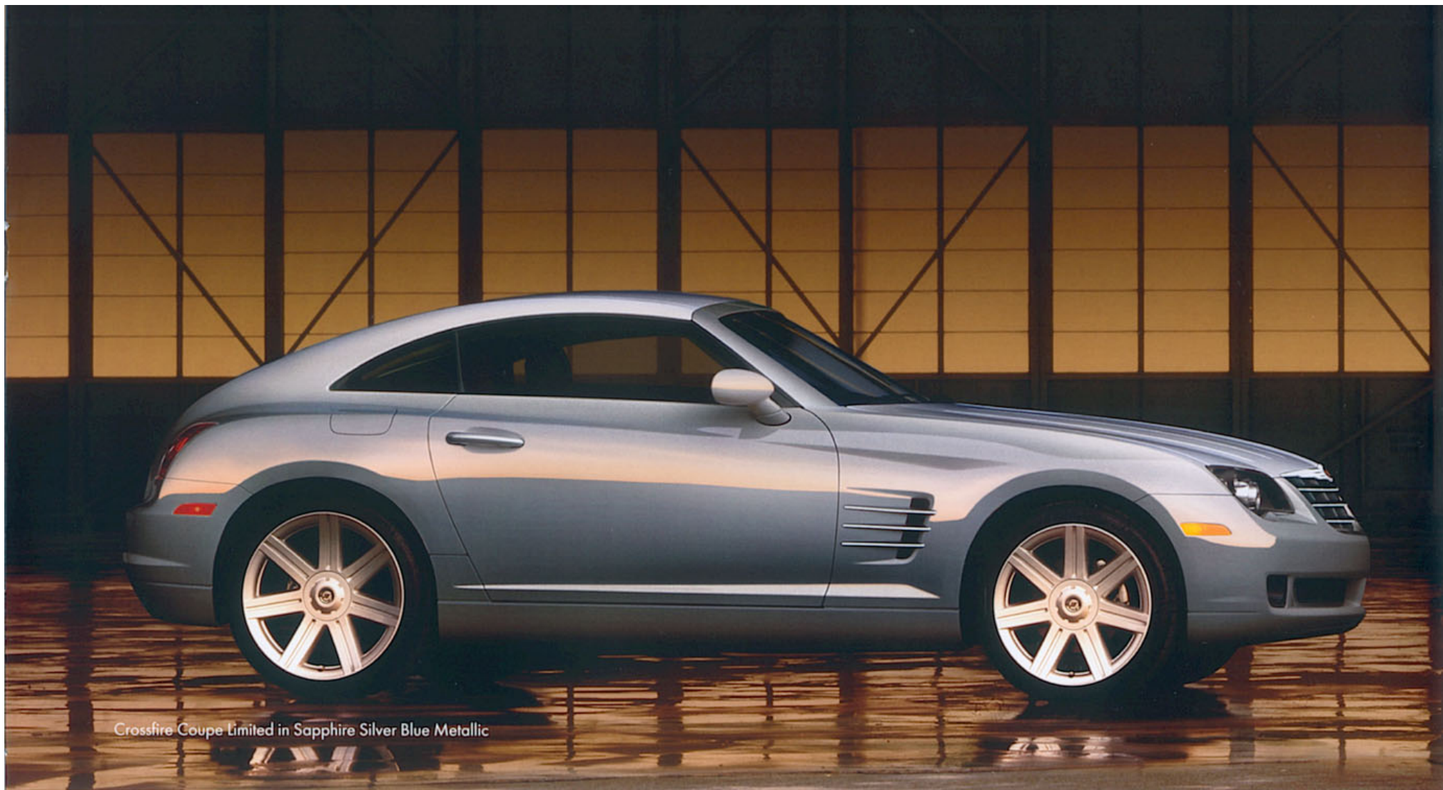
Crossfire Coupe Limited in Sapphire Silver Blue Metallic

Crossfire Limited exudes the confidence that comes with being the leader of the coupes. Complete with the best of what Crossfire stands for, leather-trimmed seats, semi-automatic temperature control and a whole host of power amenities. Finished in Satin Silver, Crossfire's signature longitudinal spine tops the shift lever of the available 5-speed automatic with AutoStick. ®