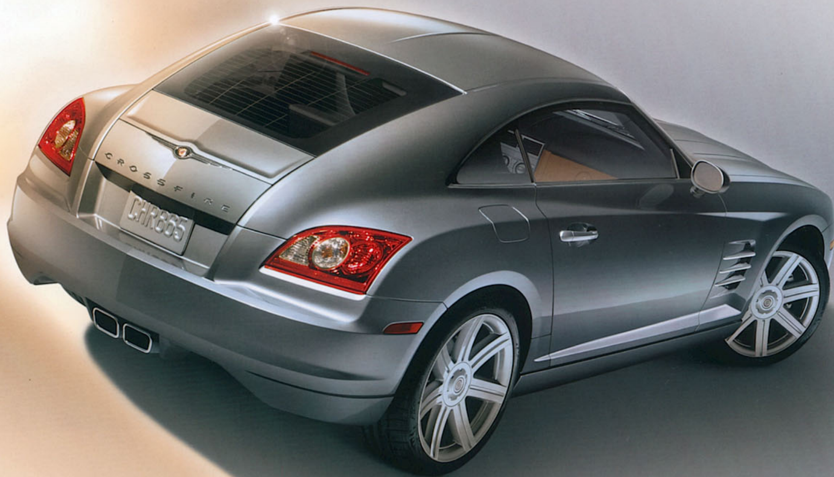
Crossfire Coupe Limited shown in Sapphire Silver Blue Metallic