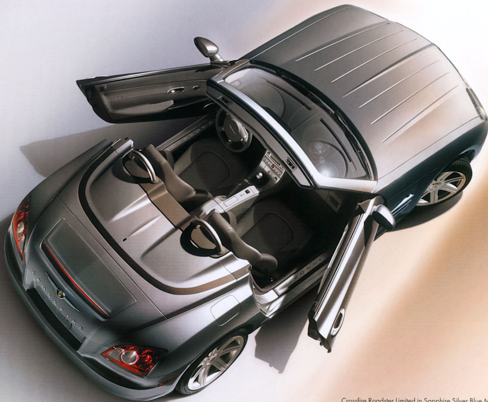
Crossfire Roadster Limited in Sapphire Silver Blue Metallic