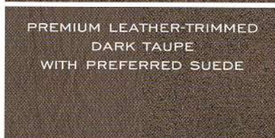
PREMIUM LEATHER-TRIMMED DARK TAUPE WITH PREFERRED SUEDE