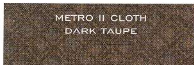
METRO II CLOTH DARK TAUPE