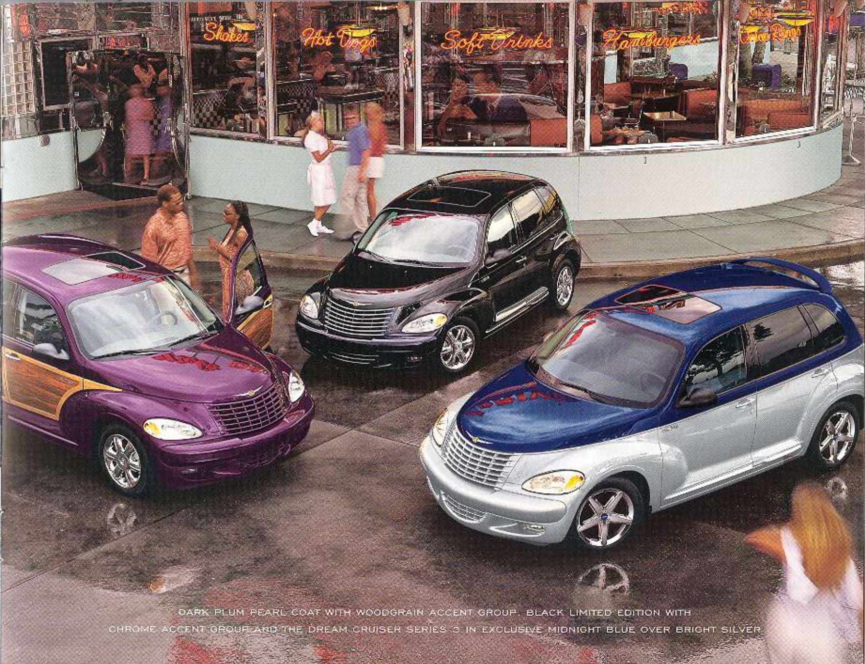
DARK PLUM PEARL COAT WITH WOODGRAIN ACCENT GROUP, BLACK LIMITED EDITION WITH CHROME ACCENT GROUP AND THE DREAM CRUISER SERIES 3 IN EXCLUSIVE MIDNIGHT BLUE OVER BRIGHT SILVER