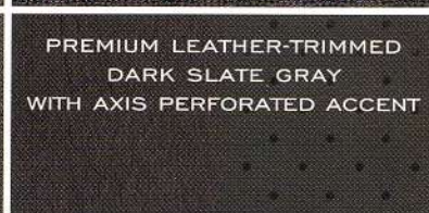
PREMIUM LEATHER-TRIMMED DARK SLATE GRAY WITH AXIS PERFORATED ACCENT

METRO II CLOTH IN DARK SLATE GRAY OR DARK TAUPE IS STANDARD ON PT CRUISER AND TOURING EDITION. PREMIUM LEATHER TRIM WITH PREFERRED SUEDE ACCENTS IN DARK TAUPE OR DARK SLATE GRAY IS STANDARD ON LIMITED EDITION. PREMIUM LEATHER SPORT TRIM WITH AXIS PERFORATED ACCENTS IN DARK SLATE GRAY IS STANDARD ON GT. FRESNO SPORT CLOTH IN DARK SLATE GRAY IS OPTIONAL ON GT. INTERIORS ARE AVAILABLE WITH ALL EXTERIOR COLORS. WHEELS (LEFT TO RIGHT): 15-INCH BOLT-ON WHEEL COVER (STANDARD ON PT CRUISER); 16-INCH PAINTED CAST ALUMINUM (STANDARD ON TOURING); 16-INCH CHROME-CLAD ALUMINUM WHEEL (STANDARD ON LIMITED, OPTIONAL ON TOURING); 16-INCH CHROME-CLAD ALUMINUM WHEEL (OPTIONAL ON TOURING WITH 180-HP 2.4 TURBO ENGINE, STANDARD ON LIMITED WHEN EQUIPPED WITH 180-HP 2.4 TURBO ENGINE); 17-INCH CHROME-PLATED ALUMINUM WHEEL (STANDARD ON GT).