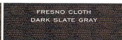
FRESNO CLOTH DARK SLATE GRAY