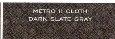
METRO II CLOTH DARK SLATE GRAY