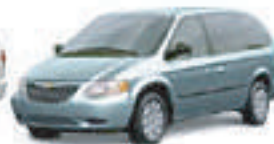
Butane Blue Pearl Coat