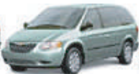
Satin Jade Pearl Coat