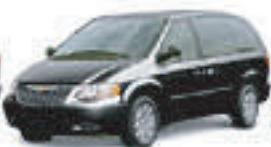
Brilliant Black Crystal Pearl Coat