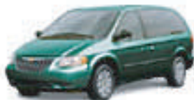
Onyx Green Pearl Coat