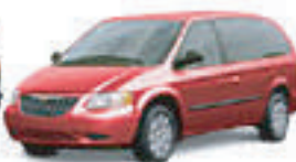
Inferno Red Tinted Pearl Coat