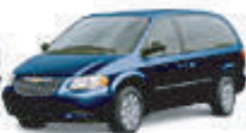
Deep Sapphire Blue Pearl Coat