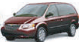
Deep Lava Red Metallic