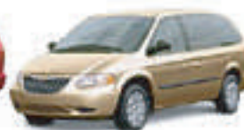
Light Almond Pearl Metallic