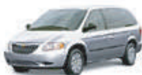
Bright Silver Metallic