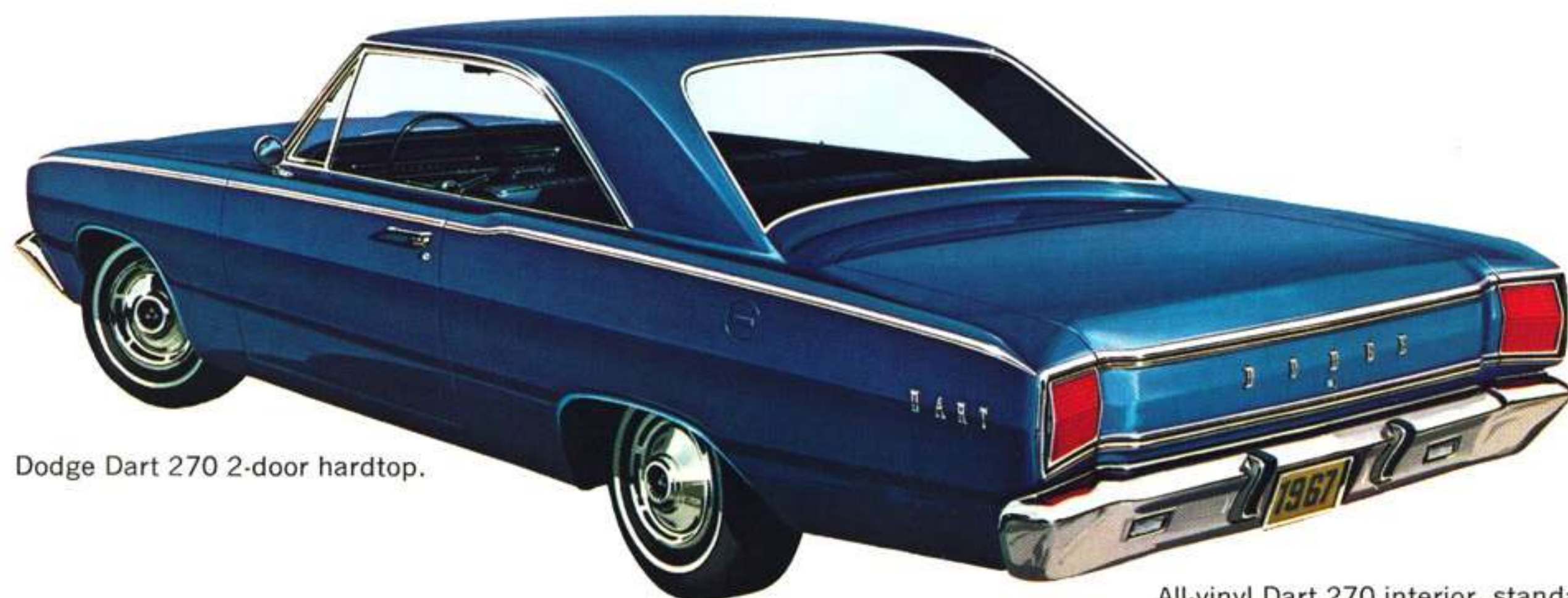
Dodge Dart 270 2-door hardtop.

All-vinyl Dart 270 interior, standard in hardtop; optional, at extra cost, in 4-door sedan.