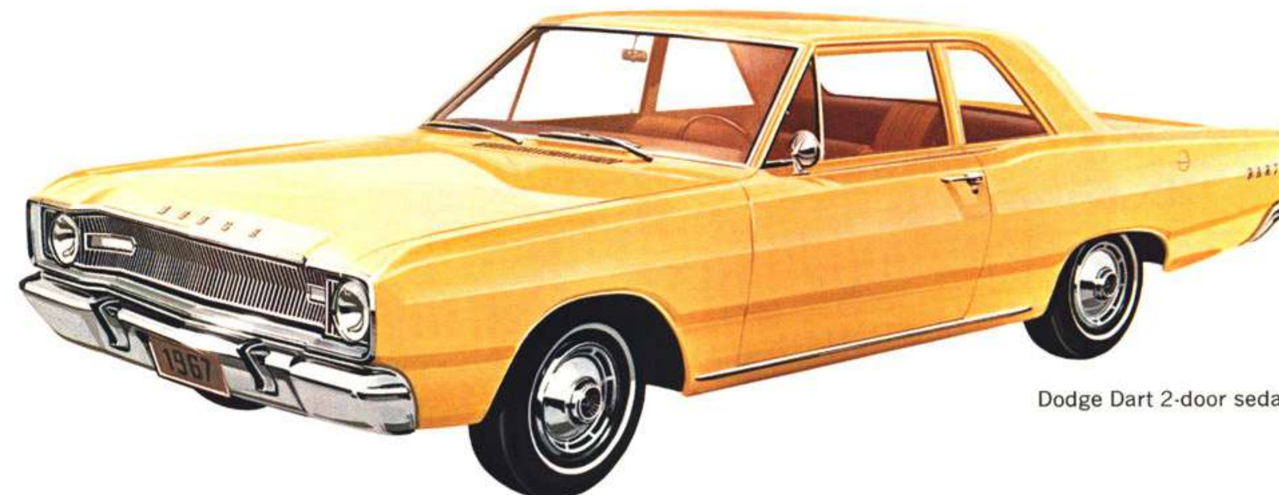
Dodge Dart 2-door sedan.

All-vinyl Dart Series interior. Standard.