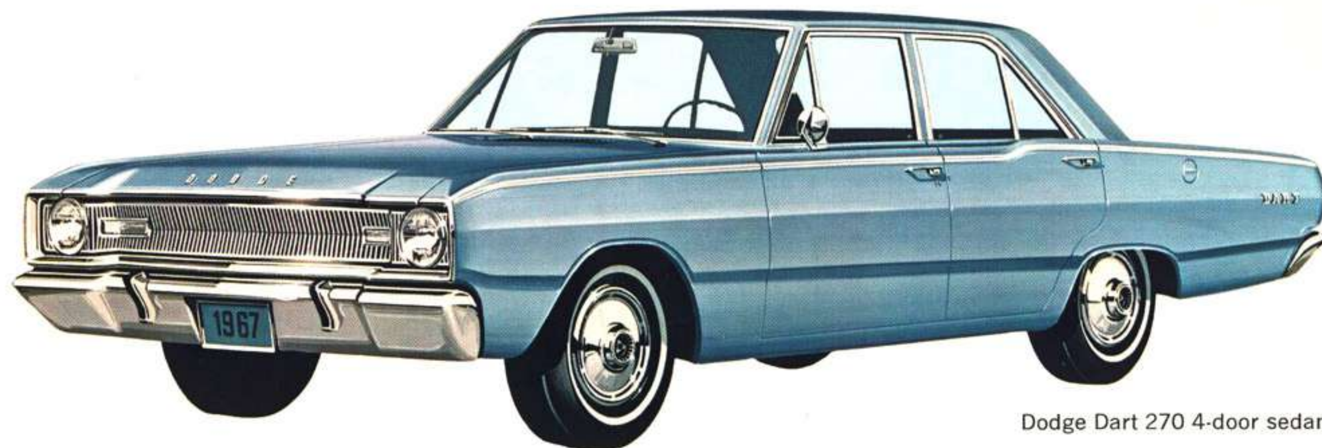
Dodge Dart 270 4-door sedan.