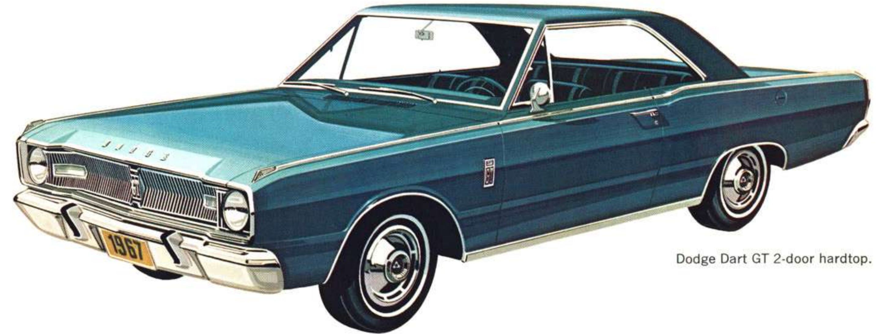
Dodge Dart GT 2-door hardtop.

major chassis lubrication (good for 36,000 miles) □ Curved and tempered side glass □ Convertible, flexible, air-tempered glass rear window □ Power convertible top with choice of black, blue or white material □ Front-fender-mounted turn signal indicator lights Standard safety equipment for Dart GT models is shown on back cover of this catalog.