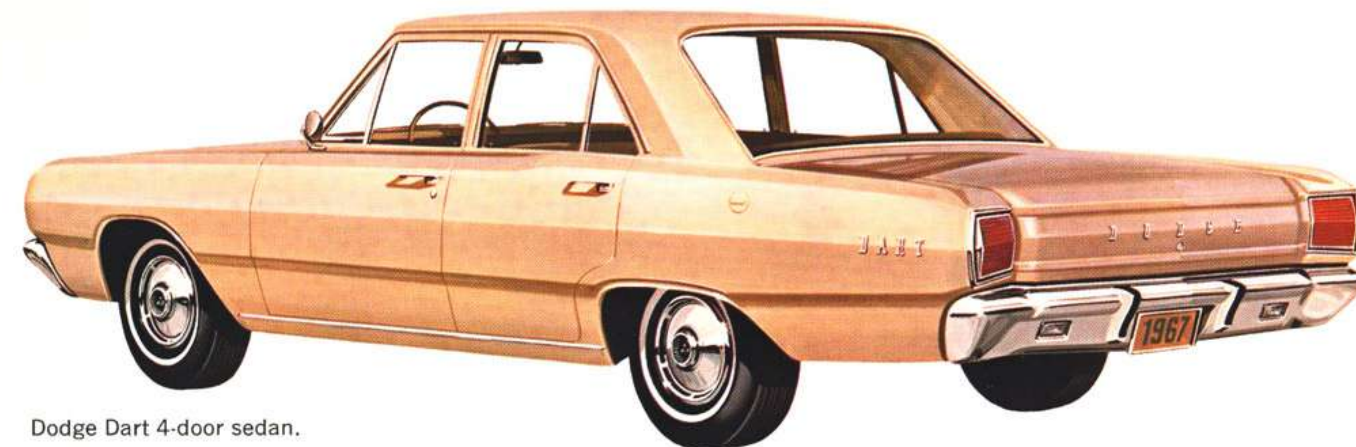
Dodge Dart 4-door sedan.