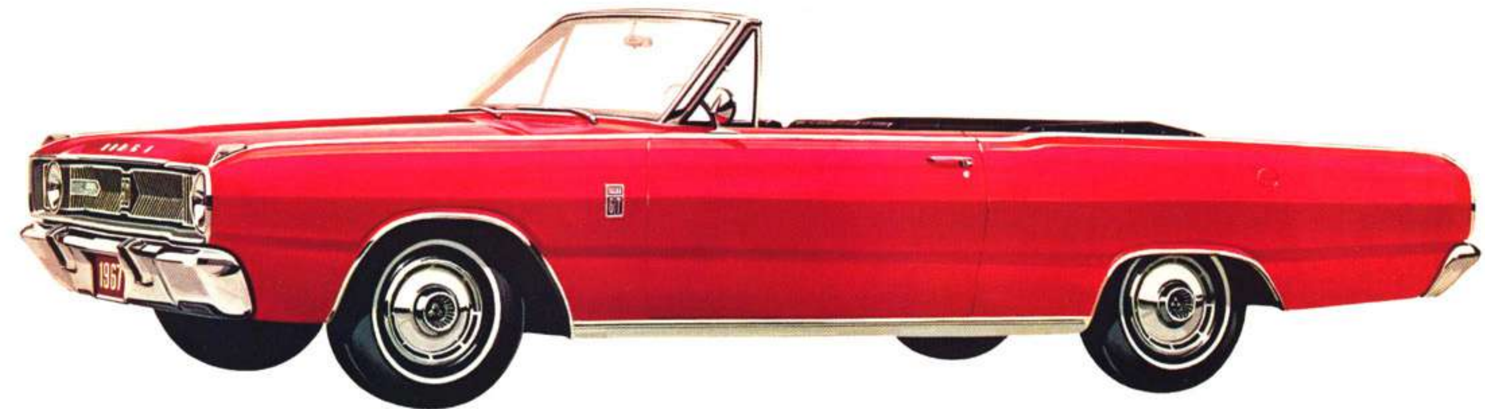
Dodge Dart GT convertible.

Dart GT convertible interior. Front bench seat (all-vinyl) is standard. Front bucket seats are optional, at extra cost, in convertible; standard in Dart GT hardtop.