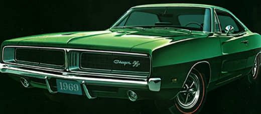
DODGE CHARGER R/T