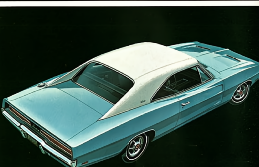
DODGE CHARGER SE