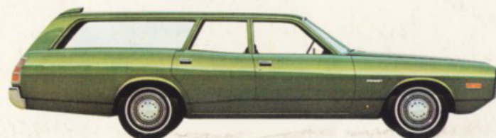
CORONET 4-DOOR WAGON