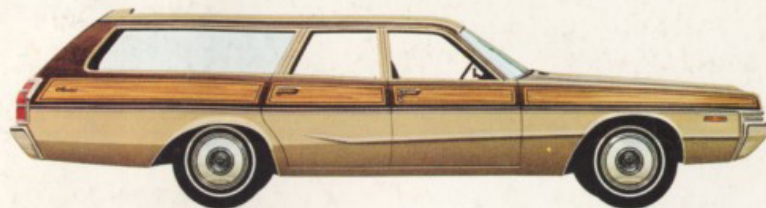
MONACO 4-DOOR WAGON