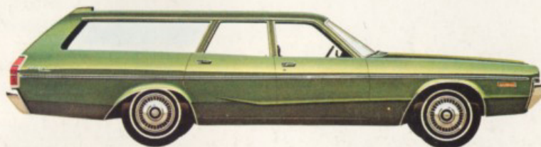
POLARA CUSTOM 4-DOOR WAGON