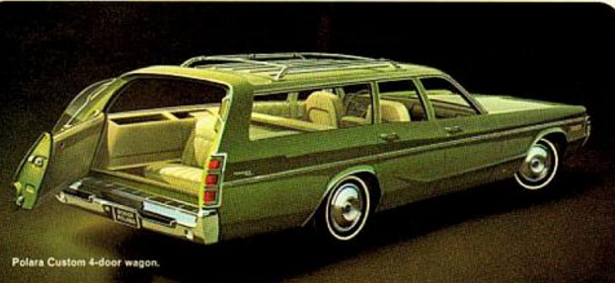
Polara Custom 4-door wagon.

POLARA/MONACO Polara and Monaco are similar in size—but different in styling and appointment levels. They are built for the family that wants an extra large amount of space and comfort. This year, both include the exclusive Torsion-Quiet Ride, an advanced suspension system that uses strategically placed rubber mounts to isolate road noise and vibration from the passenger compartment. Coupled with the advanced torsion-bar suspension system, the end result is a wagon that rides more like a limousine than a wagon, and gives outstanding silence to match.