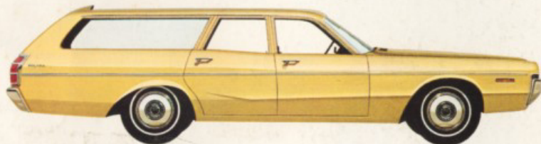
POLARA 4-DOOR WAGON