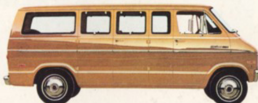
SPORTSMAN CUSTOM WAGON