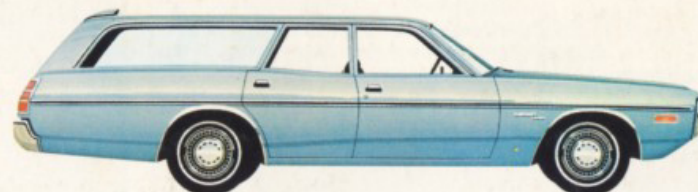
CORONET CUSTOM 4-DOOR WAGON