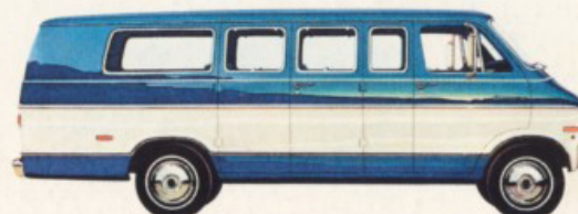
SPORTSMAN MAXIVAN WAGON