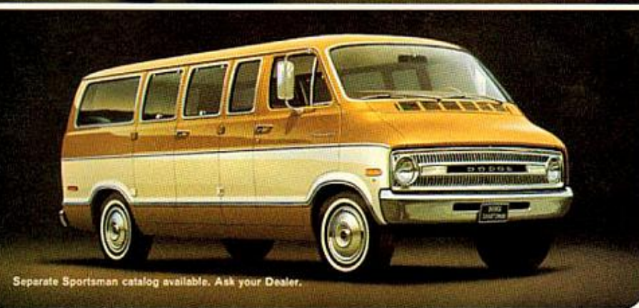
Separate Sportsman catalog available. Ask your Dealer.

SPORTSMAN Dodge builds the Sportsman for those of you who are interested in a new concept in station wagons. In brief, you'll find Sportsman has an independent front suspension for a greatly improved ride, a choice of seating arrangements no wagon of its type can match, more room, and a greater choice of most-wanted options, including power steering, automatic transmission, power front disc brakes, and air conditioning. For campers, many different and exciting conversions are available. Consult your Dealer for complete Sportsman information.