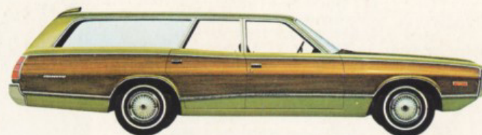
CORONET CRESTWOOD 4-DOOR WAGON