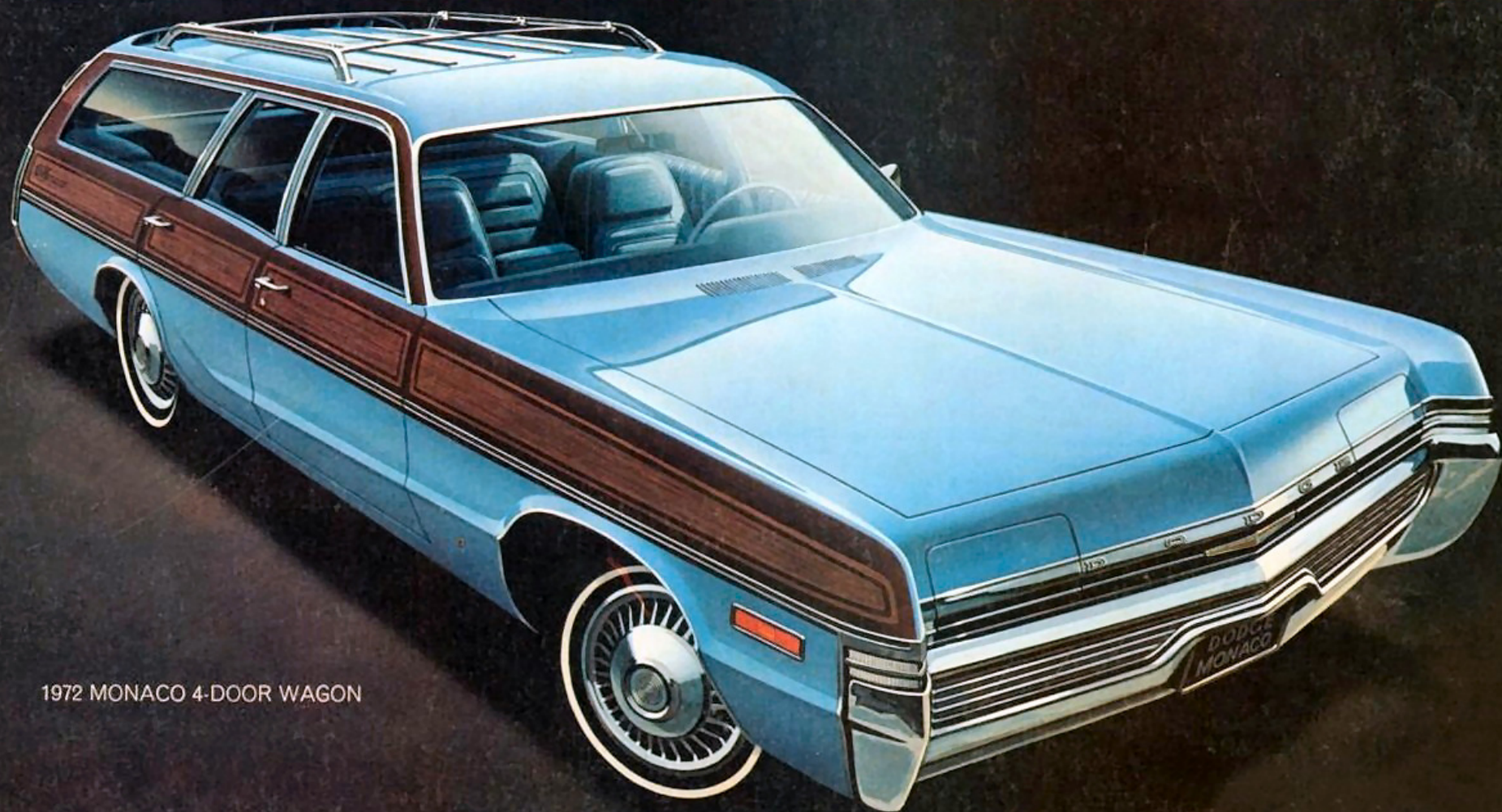
1972 MONACO 4-DOOR WAGON