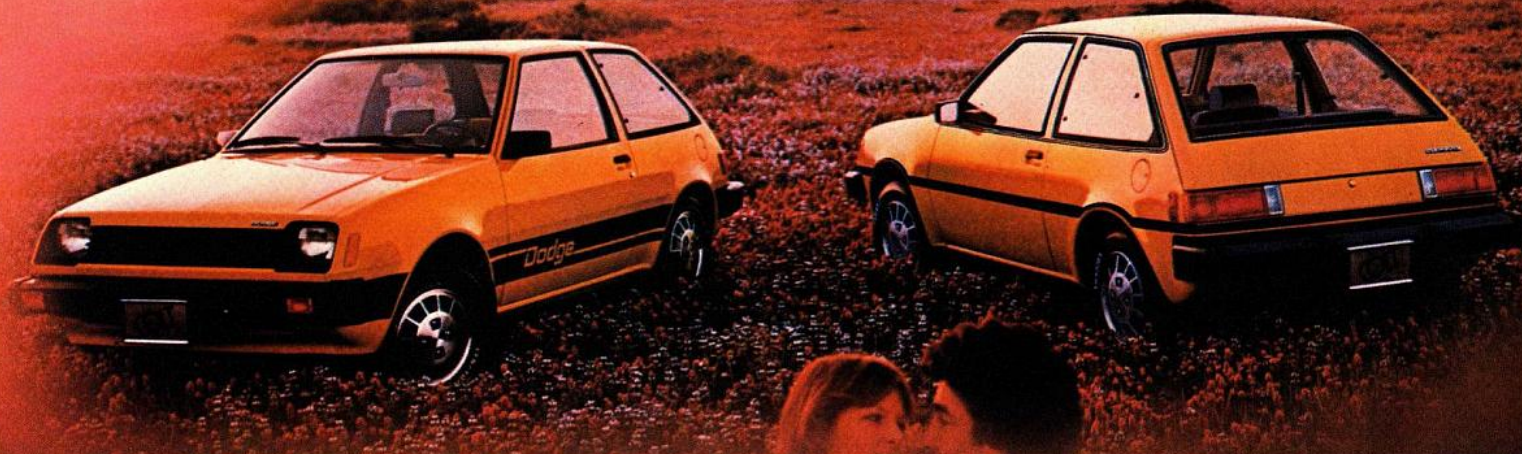
Dodge Colt (left) and Plymouth Colt (right) with Optional Sport Package

COLT THREE-DOOR HATCHBACK is an all-new entry in 1979. Its 1.4-litre engine and small size make it quick and nimble with good stability. Front-wheel drive and a transverse-mounted engine supply excellent traction and stability in all weather conditions. The hatchback body boasts interior room and visibility. All the quality features of the other Colt models are found on the three-door hatchback.