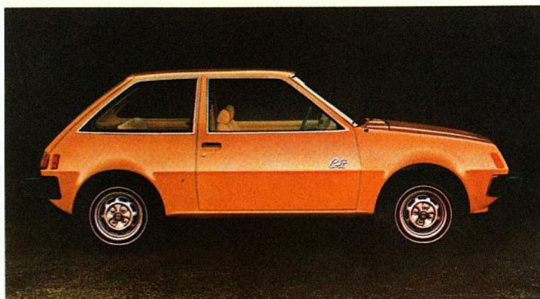
Colt Three-Door Hatchback

Also available is a Sport Package which includes more equipment to make your three-door hatchback a standout.