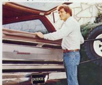
Outside spare tire carrier