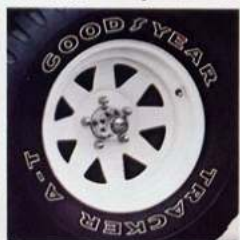
White-painted spoke wheel