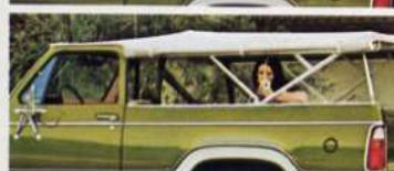
Vinyl soft-top (dealer-installed)