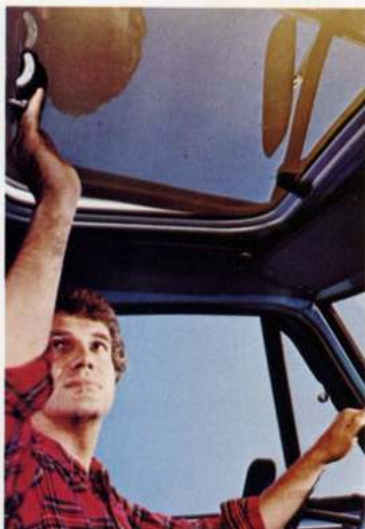
Sky Lite sun roof