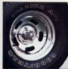
Five-slot chrome disc wheel