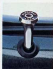
Electric door locks