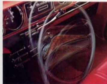
Tilt steering column