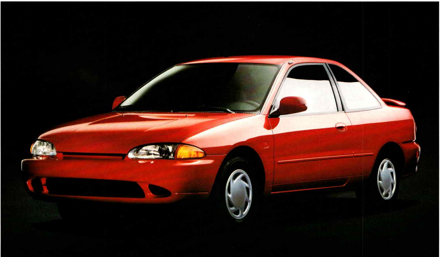
Colt GL 2-door