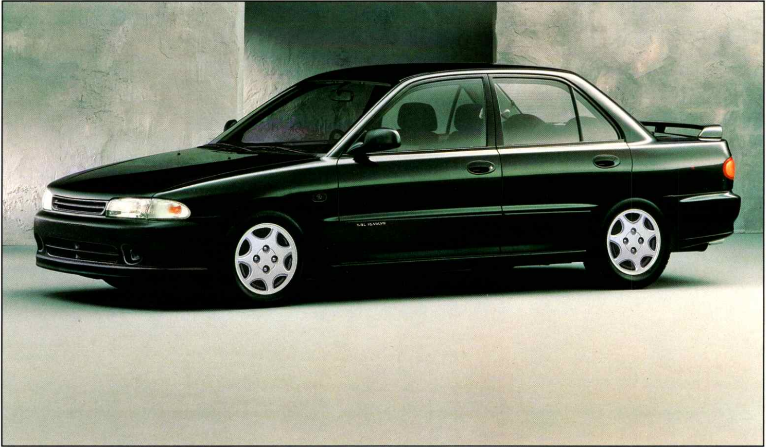
Colt GL 4-door