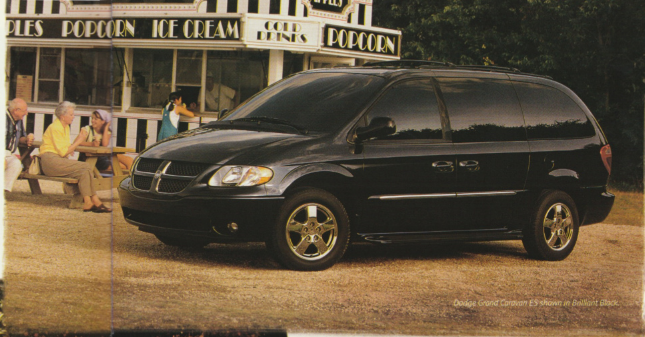
Dodge Grand Caravan ES shown in Brilliant Black.

Great-looking style. Rugged dependability. Kid-loving comfort. Advanced safety features. Unbelievable versatility. They're all hallmarks of every Dodge Caravan. And with a great selection of models to choose from, you can get the right combination for your lifestyle.