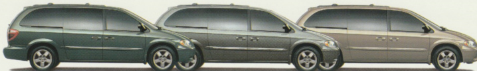
Onyx Green Pearl Metallic