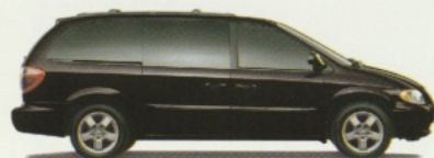
Brilliant Black (available on ES only)