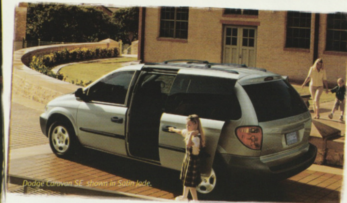
Dodge Caravan SE shown in Satin Jade.

Exceptional value has always been part of the winning Dodge Caravan formula. For 2003, Caravan SE with the 28D Package continues to be one of our most popular models, bringing together a long list of standard equipment, including: speed control and tilt steering, power mirrors, windows and door locks, 3.3-litre V6 engine, four-speed automatic transmission, air conditioning, sunscreen glass, seven-passenger seating with Easy Out® Roller Seats, rear seatback grocery bag hooks, Sentry Key® Engine Immobilizer and more.