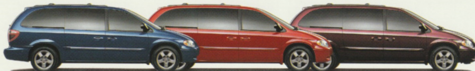
Patriot Blue Pearl Coat