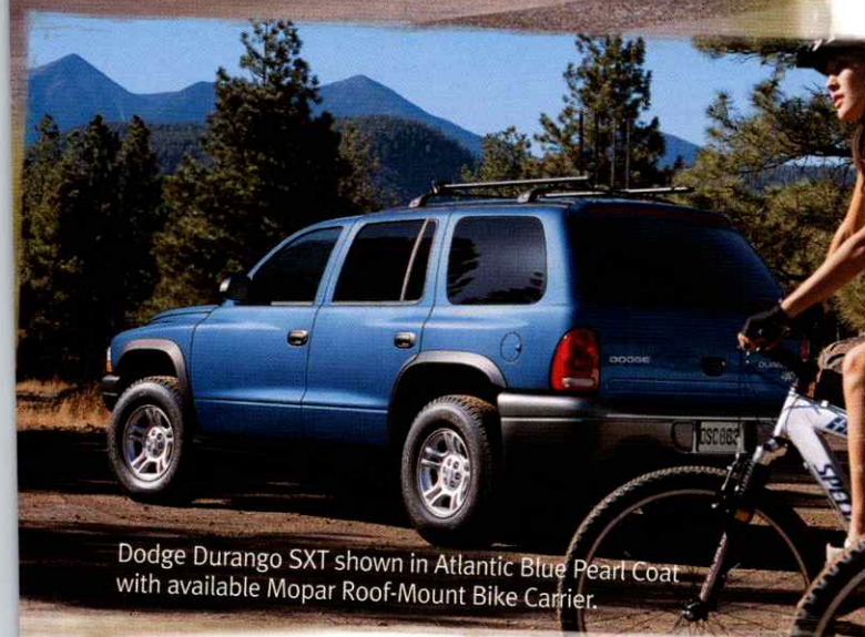
Dodge Durango SXT shown in Atlantic Blue Pearl Coat with available Mopar Roof-Mount Bike Carrier.