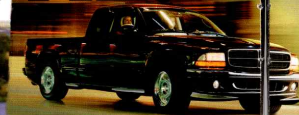
Dodge Dakota Club Cab® R/T shown in black with new Ground Effects Package. ††