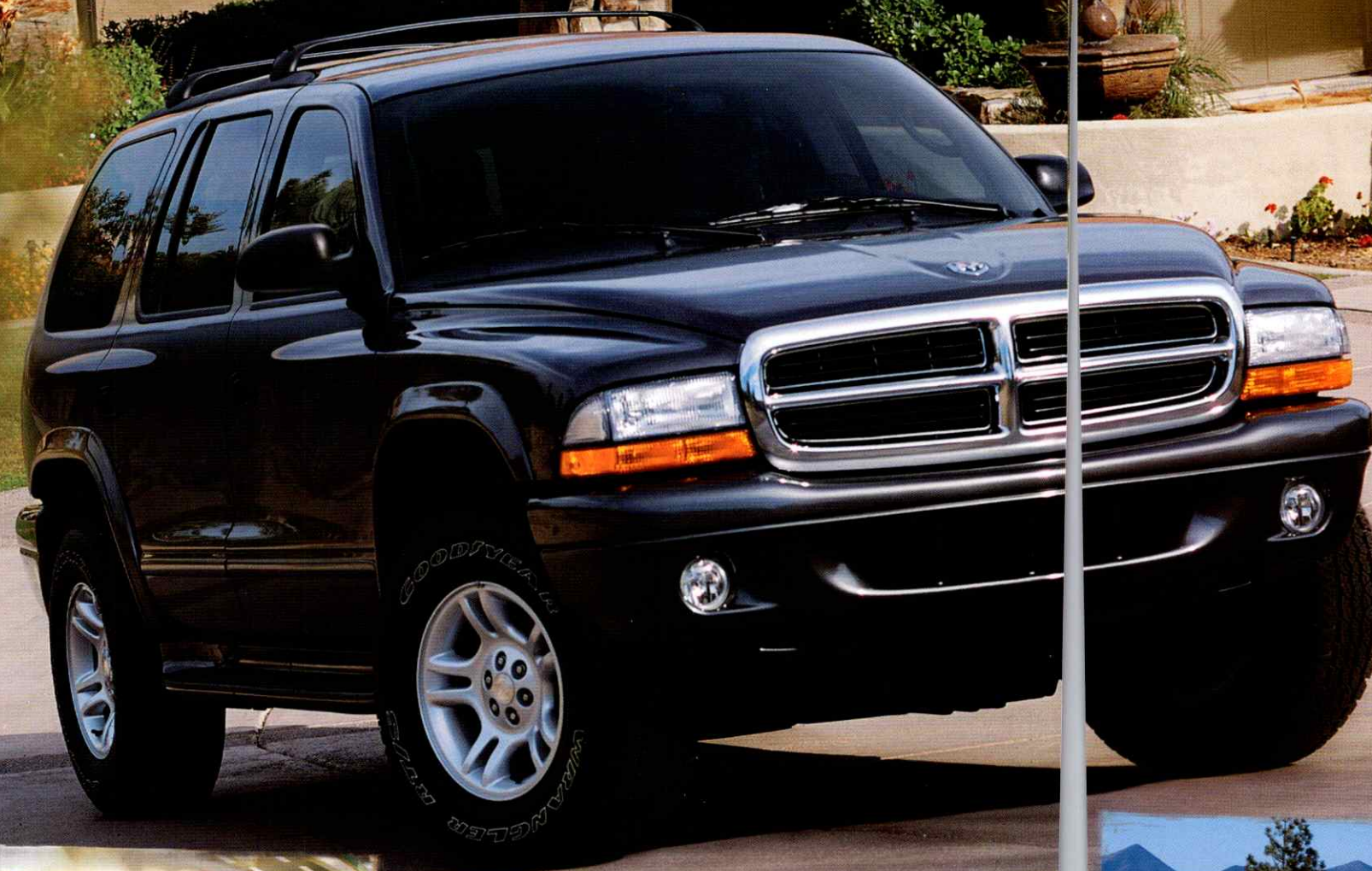
Dodge Durango R/T shown in Black.