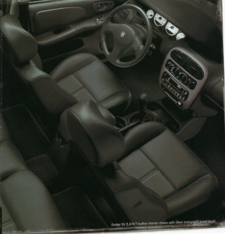
Dodge SX 2.0 R/T leather interior shown with Silver instrument panel bezel.

Wherever you're going, you and your friends will appreciate the Dodge SX 2.0 seats. Of course, if you opt for the luxury of leather seats, they'll not only appreciate you... they'll worship you! While they do that, you can feast your eyes on sweet instrumentation that brilliantly displays all the vital stats you need. Simply put, it's form and function combined with good looks that take care of you, your friends and all your gear with ease.