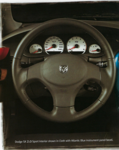
Dodge SX 2.0 Sport Interior shown in Cloth with Atlantic Blue instrument panel bezel.

One of the coolest vehicles on the road obviously deserves one of the best sound systems. That's why we loaded up SX 2.0 with a CD player and six speakers, plus we offer you an optional 6-disc in-dash CD changer. So, whether you listen to reggae or rock, the soundtrack for life's adventures will be as powerful and moving as the car you're driving.