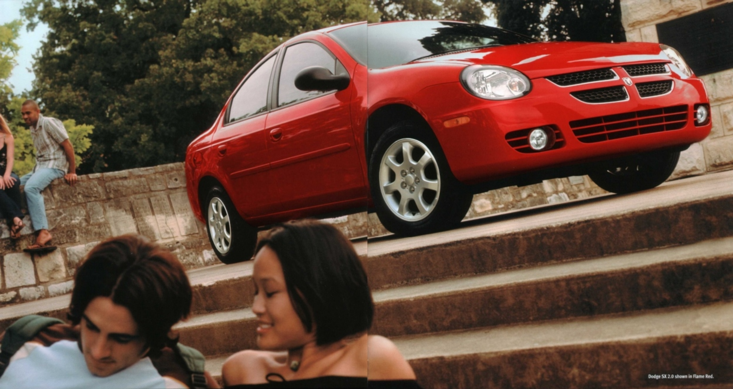
Dodge SX 2.0 shown in Flame Red.