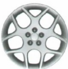
17-inch Cast Aluminum Wheel standard on SRT4