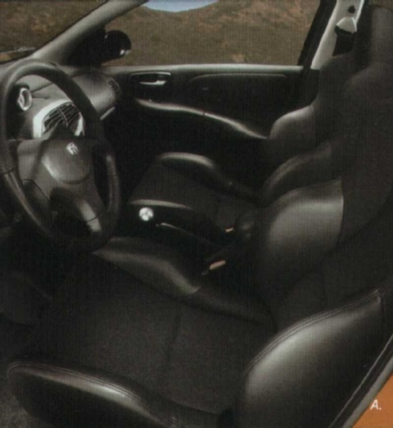
A. SRT4's race-influenced cockpit with Viper-inspired seats and Satin Silver console detailing.