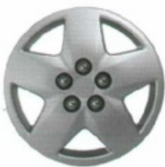
14-inch Bolt-on Wheel Cover standard on Base

P – Packaged with optional group noted S – Standard O – Optional *Always use seat belts. Children 12 and under should always be in a back seat correctly using an infant or child restraint system, or the seat belt properly positioned, dependent on the child's age and weight. Sentry Key is a trademark of DaimlerChrysler Corporation. Mopar is a registered trademark of DaimlerChrysler Corporation. Quaife is a registered trademark of Quaife Engineering Limited Corporation.