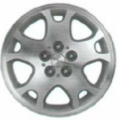
15-inch Cast Aluminum Wheel standard on Sport