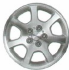
15-inch Cast Aluminum Wheel optional on Base, included in SRT Design Group