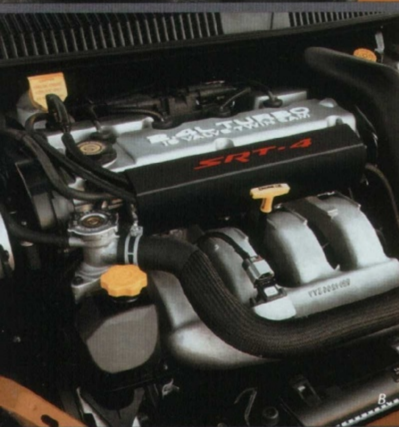
B. Visit your Dodge Dealer for a personal encounter with the 2.4-litre 16-valve 4-cylinder High-Output turbocharged DOHC engine that takes SRT4 from 0-60 mph (0-96 km/h) in 5.3 seconds.**