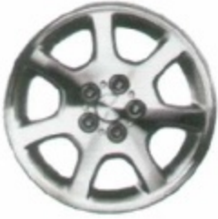
15-inch Cast Aluminum Chrome Wheel optional on Sport