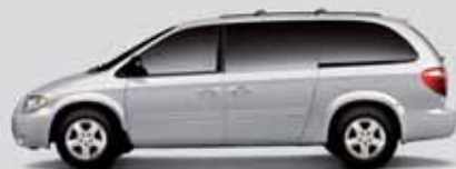
BRIGHT SILVER METALLIC