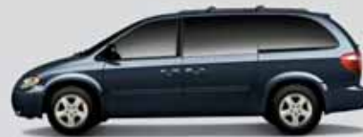
MODERN BLUE PEARL