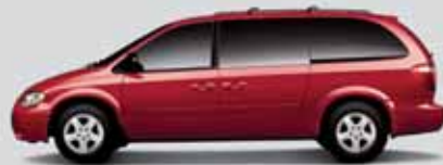
INFERNO RED CRYSTAL PEARL