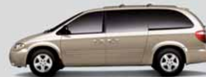
LINEN GOLD METALLIC PEARL