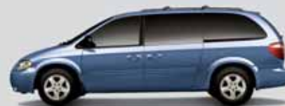
MARINE BLUE PEARL