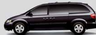
BRILLIANT BLACK CRYSTAL PEARL