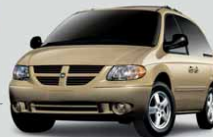
GRAND CARAVAN SXT