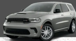
DESTROYER GREY (PDN)