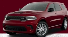
OCTANE RED PEARL (PRV)