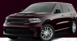
RED OXIDE (PHC)