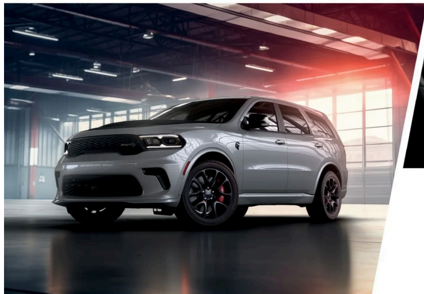
DURANGO SRT HELLCAT® SILVER BULLET SPECIAL EDITION // shown in Triple Nickel.

DODGE MUSCLE runs deeper than street and track prowess. Dodge Muscle is the brawn that pulls the boats, hauls the quads and fits the skis. It's protection and safety in the form of advanced engineering and technology that work together to keep up to seven passengers secure. Dodge Durango welcomes you to the Brotherhood of Muscle. Get in, buckle up and enjoy the ride.