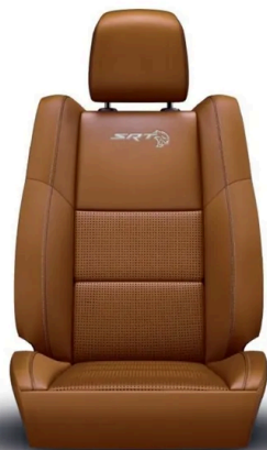
Laguna Leather Face with White SRT Hellcat Embroidered Logo [Standard in Sepia]