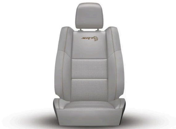
Laguna Leather Face with Sepia SRT Hellcat Embroidered Logo (Standard in Hammerhead Grey)