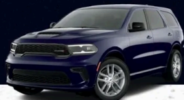
NIGHT MOVES (PC0)