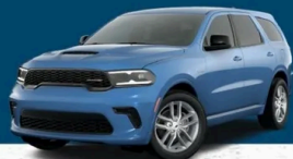
FROSTBITE PEARL (PCA)