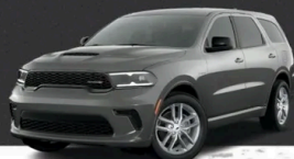
VAPOUR GREY (PAS)