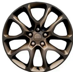
20-inch Brass Monkey // WSG [Standard]