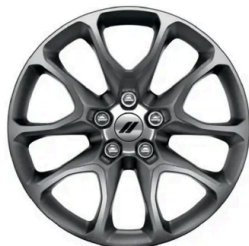
20-inch Satin Carbon // WP9 (Standard)