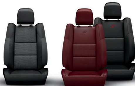
Carolina Mesh/Shift (Standard on GT in Black)