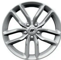
20-inch Fine Silver Aluminum // WHJ (Standard)