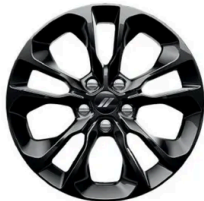
20-inch Black Noise // WH4 (Included with Blacktop Package)