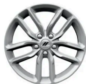
20-inch Fine Silver Aluminum // WHJ (Standard)