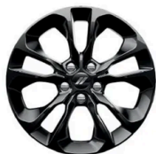
20-inch Black Noise // WH4 (Included with Blacktop Package)