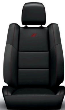
Nappa Leather Face with Nappa Axis II Perforated Inserts and Ruby Red Accent Stitching (Black)