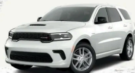
WHITE KNUCKLE (PW7)