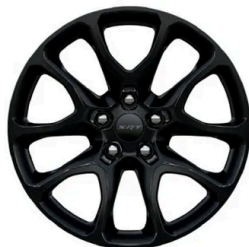
20-inch Lights Out // WHE (Standard)