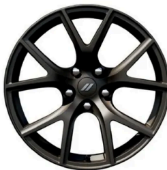
20-inch Brass Monkey Y-Spoke Forged Lightweight // WSH (Standard)