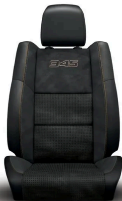
SRT® Performance with Tupelo Accent Stitching and "345" Embroidered Logo (Standard in Black)