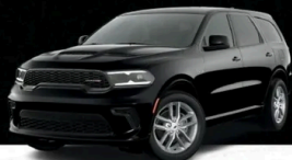
DB BLACK (PXJ)