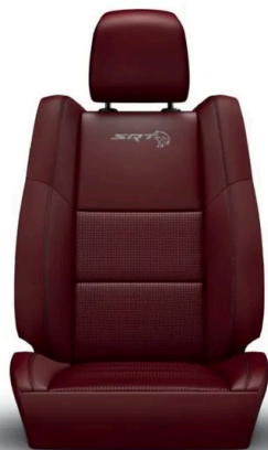
Nappa Leather Face with White SRT Hellcat Embroidered Logo (Standard in Ebony Red)