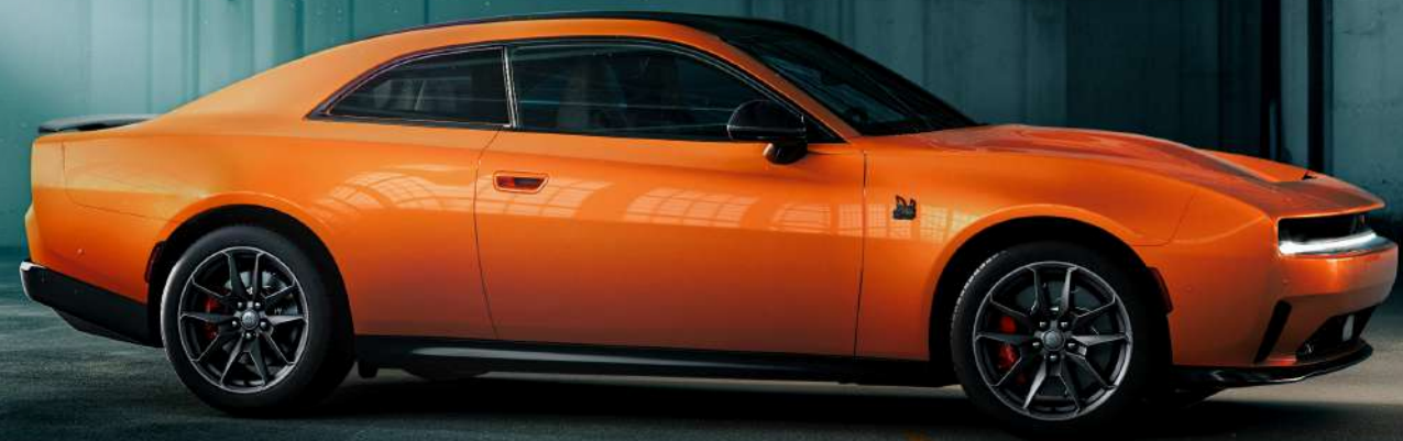
Dodge Charger Daytona Scat Pack shown in Peel Out with available Track Pack and Blacktop Package.

TRACK PACK (SCAT PACK) — Includes Red Brembo ® 6-piston fixed front calipers with 16-inch two-piece rotors and fixed rear calipers; 20 by 11-inch/11.5-inch wheels; 305/35R20 A/S BSW tires/325/35R20 A/S BSW tires; suede and leatherette high-back seats with power 12-way driver, power 12-way passenger, fixed head restraint 11 ; 4-way lumbar, heated, ventilated, driver memory; high-performance seat cushion; Gloss Black spoiler; dual-valve adaptive damping shocks and drive experience recorder with track mapping