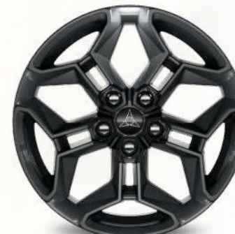
20 by 9-inch Black Noise // (WRN) Available with Blacktop Package