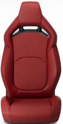
Capri Leatherette with Suede perforated inserts and Red accent stitching. Available in Black or Demonic Red/Header Red. Available with Track Pack