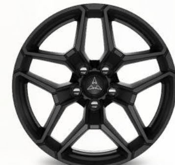
20 by 10-inch Black Noise // (WRS) Included with Plus Group and Blacktop Package