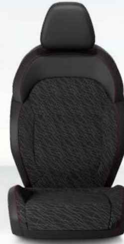
Leatherette bolsters with Rift Fabric inserts with Header Red and Red accent stitching. Black. Standard