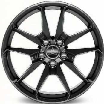
20 by 11-inch/11.5-inch Luster // (WC5) Included with Track Pack and Carbon & Suede Package