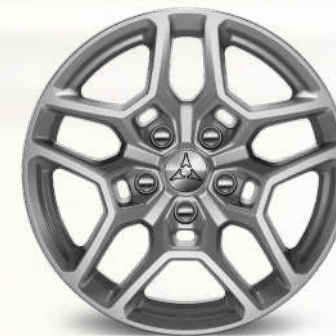
18 by 18-inch Tech Silver // (WBD) Standard