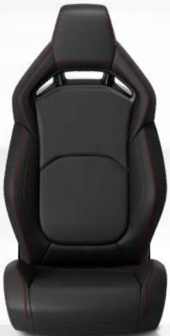
Capri Leatherette with Axis II perforated inserts and Red accent stitching. Available in Black or Demonic Red/Header Red. Available with Plus Group