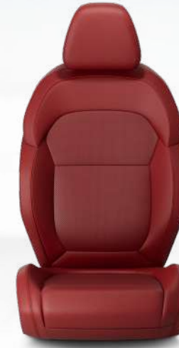
Capri Leatherette with Axis II perforated inserts and Red accent stitching. Demonic Red/Header Red. Available with Plus Group