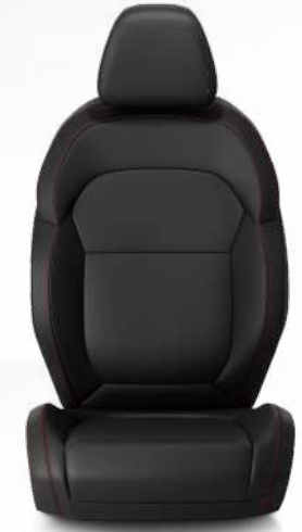
Capri Leatherette with Axis II perforated inserts and Red accent stitching. Black. Available with Plus Group