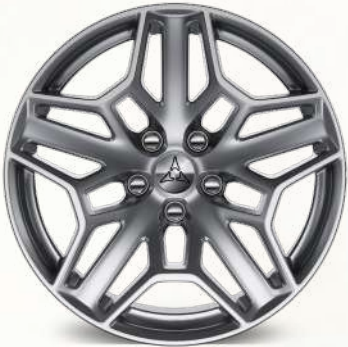
20 by 11-inch Satin Carbon // (WS5) Standard