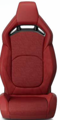
Nappa Leather outer bolsters and Suede inner bolsters and Live Wire Embossment with Axis II Suede inserts with Header Red and Red accent stitching. Available in Black or Demonic Red. Available with Carbon & Suede Package