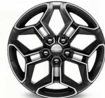
20 by 9-inch Diamond-Cut Baltic // (WRT) Available with Plus Group