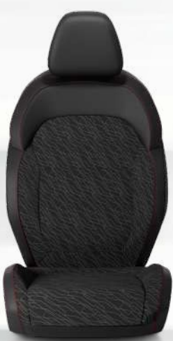
Capri Leatherette bolsters with Rift Fabric inserts with Header Red and Red accent stitching. Black. Standard