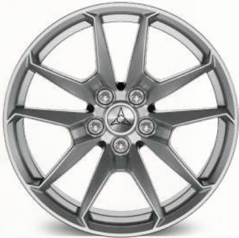
20 by 11-inch/11.5-inch Satin Carbon // (WC1) Included with Track Pack