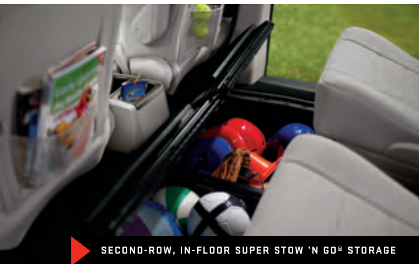
SECOND-ROW, IN-FLOOR SUPER STOW 'N GO® STORAGE