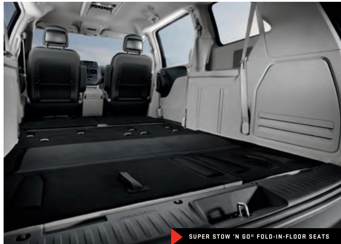
SUPER STOW 'N GO® FOLD-IN-FLOOR SEATS