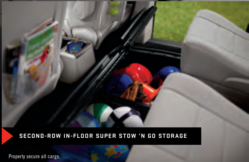
SECOND-ROW IN-FLOOR SUPER STOW 'N GO STORAGE

Soft-touch surfaces, steering-wheel-mounted cruise and audio controls, and a sleek, functional dash welcome every driver. Opt for conveniences like heated front-row seats, a full-circumference heated steering wheel and Tri-Zone Automatic Temperature Control for optimum comfort. The available power dual-sliding doors, power liftgate and Super Stow 'n Go® seating let you load your precious cargo easily.