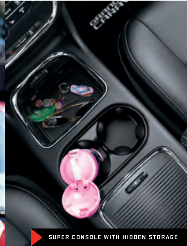
SUPER CONSOLE WITH HIDDEN STORAGE