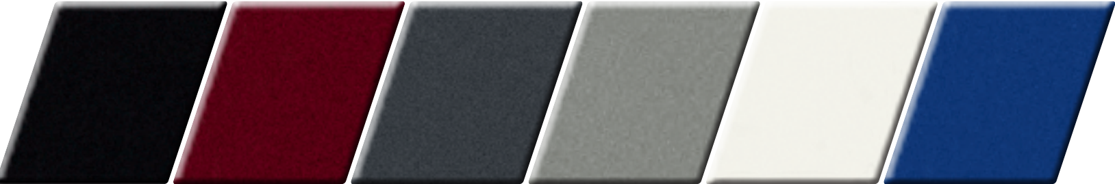
Brilliant Black Crystal Pearl Octane Red Granite Crystal Metallic Billet Metallic Bright White IndiGo Blue

Cloth in Black — Standard on CVP, SXT and Crew Cloth in Light Greystone — Standard on Crew; Leather-faced with perforated inserts in Light Greystone — Standard on Crew Plus Leather-faced with perforated inserts in Black with Light Grey accent stitching — Standard on Crew Plus; Torino Leatherette with Suede inserts in Black with Silver accent stitching — Standard on SXT Premium Plus Leather-faced with perforated inserts in Black with Red accent stitching — Standard on GT