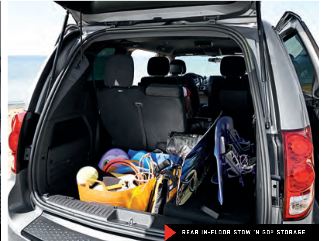
REAR IN-FLOOR STOW 'N GO® STORAGE