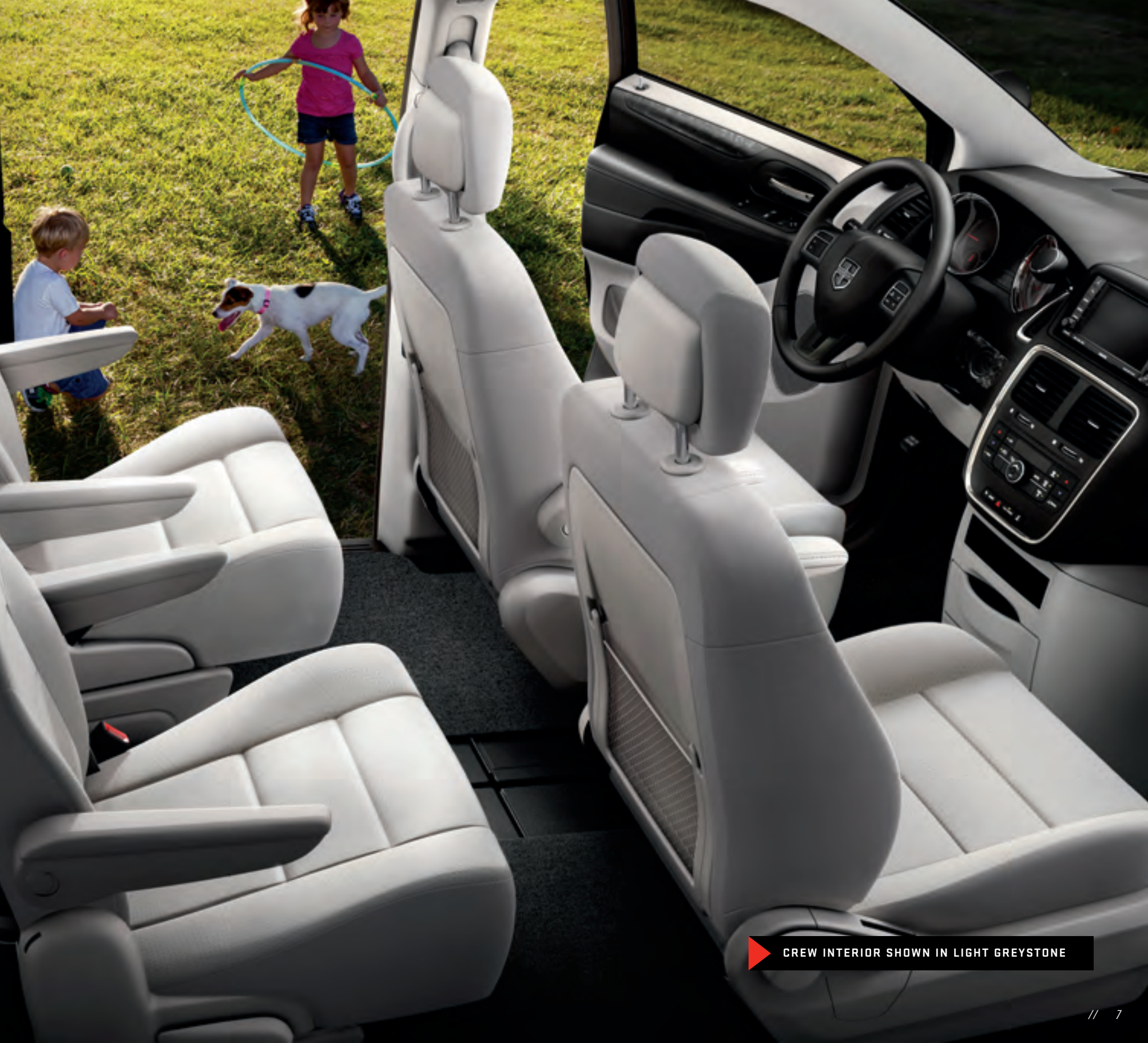
CREW INTERIOR SHOWN IN LIGHT GREYSTONE