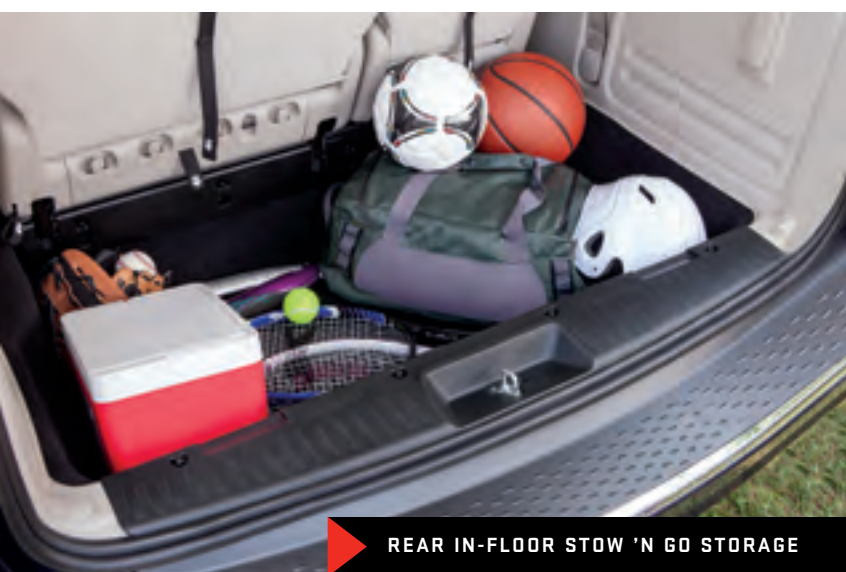
REAR IN-FLOOR STOW 'N GO STORAGE