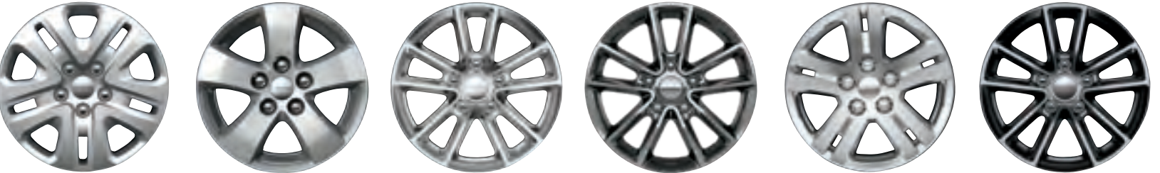
17-inch steel wheels with covers — Standard on CVP and SXT 17-inch aluminum — Available on CVP with SE Plus Group 17-inch Tech Silver aluminum — Available on SXT with SXT Plus Group 17-inch polished aluminum with Granite Crystal pockets — Standard on SXT Premium Plus 17-inch painted aluminum — Standard on Crew and Crew Plus 17-inch polished aluminum with Gloss Black pockets — Standard on GT; Available on SXT with Blacktop Appearance Package

Based on 2018 EnerGuide fuel consumption ratings. Government of Canada test methods used. Your actual fuel consumption will vary based on driving habits and other factors. For EnerGuide information, please ask your retailer or visit the Government of Canada Web site: www.vehicles.nrcan.gc.ca