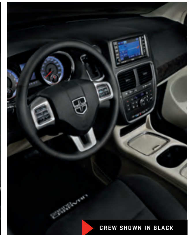
CREW SHOWN IN BLACK