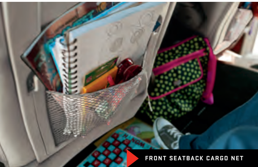
FRONT SEATBACK CARGO NET