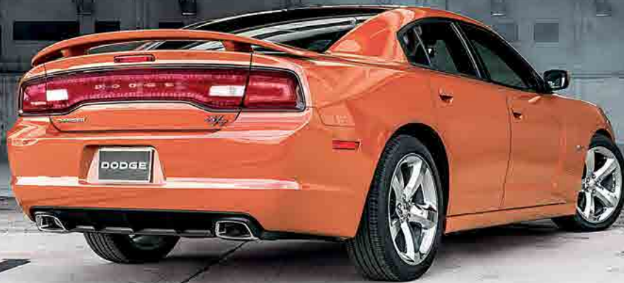
Charger R/T Road & Track shown in Header Orange.

It's been forged with the aptitude to simultaneously look back while powering forward. The dual scalloped hood, the tapered bodyside profile, tight wheel openings, dual trapezoidal chrome exhaust tips and a signature 164 LED racetrack taillamp pay homage to its muscle-car roots. And where nostalgia leaves off, dynamic 21 st -century engineering begins. The sculpted silhouette sharpens its aerodynamic performance. The low and aggressive front end offers no apologies for the menacing grille it wears as a badge of pure American muscle. A laser-brazed roof eliminates roof ditch moldings for a purely premium appearance. Tap into the tuner vibe with an available Black painted roof and with polished and forged Black Chrome or Gloss Black 20-inch wheels. Standard automatic quad halogen reflector headlamps with Gloss Black bezels or available low-beam High Intensity Discharge (HID) headlamps project light and attitude with equal authority. And while horsepower will always remain king, its powerplant has been machined to efficiently sip fuel rather than gulp it.