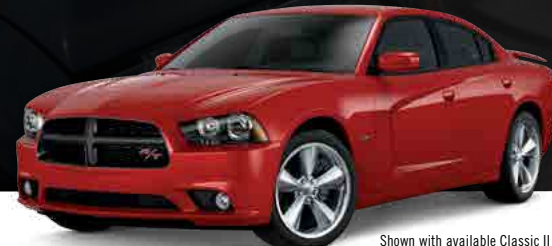
Shown with available Classic II Wheels