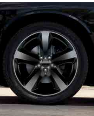
20-inch Gloss Black aluminum (included in Blacktop Package on SXT, SXT Plus, R/T and R/T Plus)