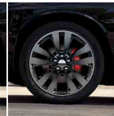
20-inch Black Vapor Chrome forged aluminum (optional on SRT)