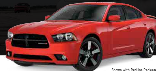
Shown with Redline Package