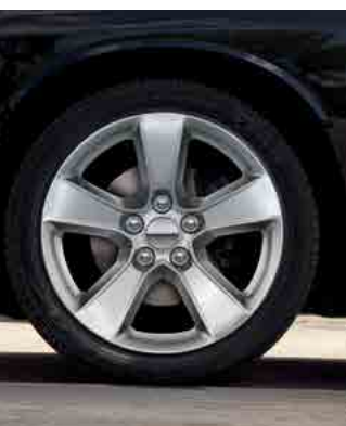
17-inch aluminum (standard on SE and SXT)