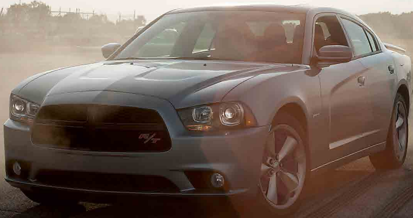
Charger R/T Road & Track shown in Granite Crystal Metallic with available Black roof and 20-inch polished forged aluminum Classic II wheels.