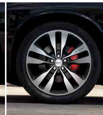
20-inch forged aluminum with polished face and Black pockets (standard on SRT)