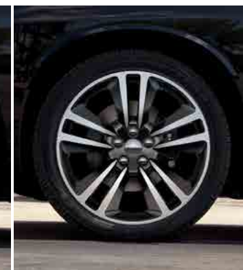
20-inch cast aluminum with Black pockets (standard on SRT® Super Bee)