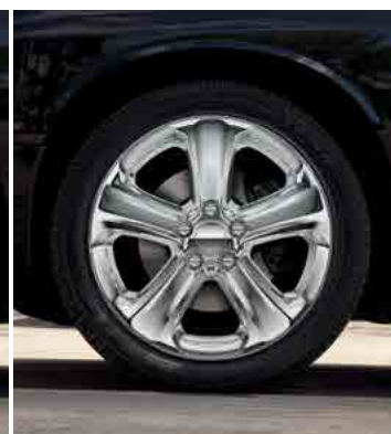
18-inch chrome-clad aluminum (standard on SXT Plus and R/T Plus, included in Sport Appearance Group on SE and SXT)