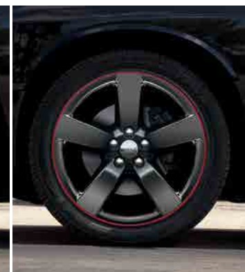
20-inch Black Chrome aluminum with Red lip/backbone (included in Redline Package on SXT and SXT Plus)