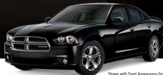
Shown with Sport Appearance Group