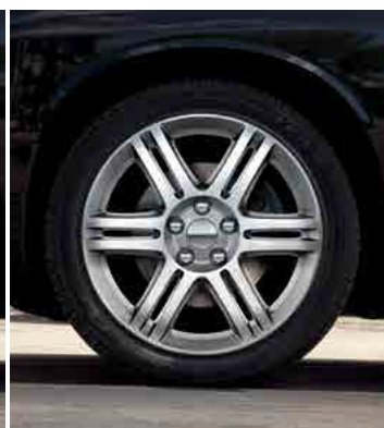
18-inch polished aluminum (standard on R/T, optional on SXT)