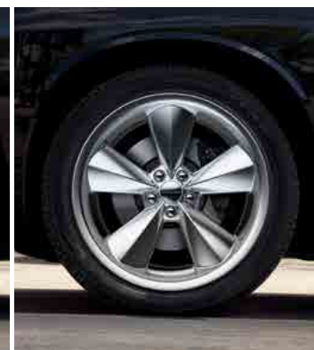
20-inch Classic II polished forged aluminum (optional on R/T Road & Track and Rallye Appearance Group on SXT and SXT Plus)