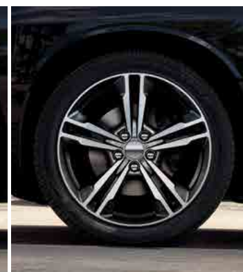
19-inch polished aluminum with Gloss Black Pockets (included in AWD Sport Appearance Package on SXT, SXT Plus, R/T and R/T Plus)