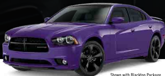
Shown with Blacktop Package