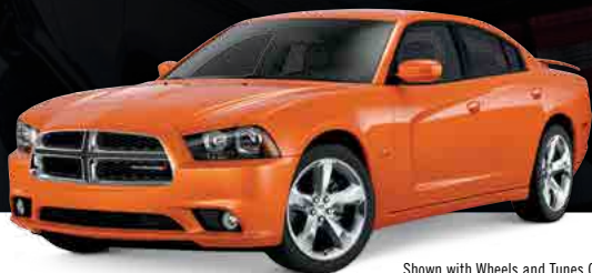
Shown with Wheels and Tunes Group