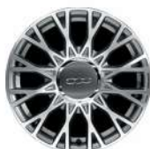
16R - ALLOY WHEEL GLOSSY SILVER