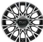
70N - ALLOY WHEELS BLACK PAINTED WITH DIAMOND FINISH