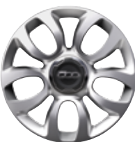
17-INCH ECOREFLEX GLOSS PAINTED ALUMINUM Standard on Lounge