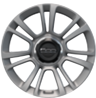
16-INCH ALUMINUM Standard on Pop

• = Standard. ○ = Optional. P = Available within Package. — = Not available.