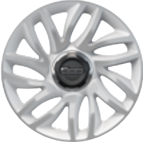
18-INCH MACHINED ALUMINUM WITH WHITE PAINTED POCKETS Available on Lounge in Bianco or with Bianco roof