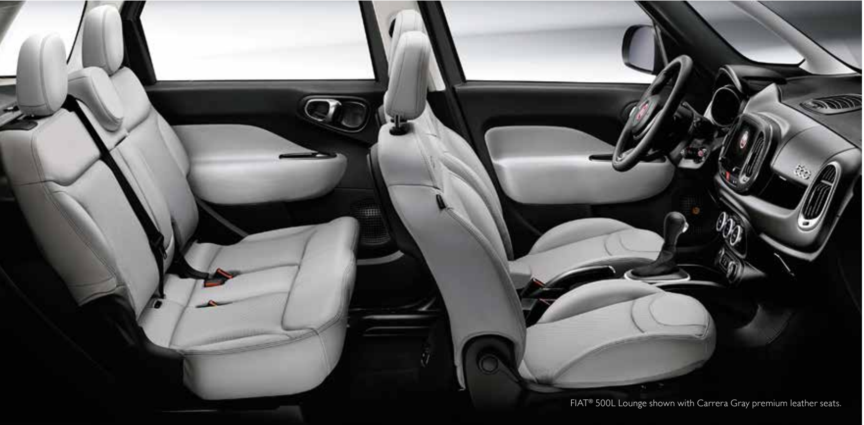
FIAT® 500L Lounge shown with Carrera Gray premium leather seats.