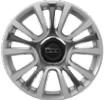
17-INCH ALUMINUM Standard on Trekking