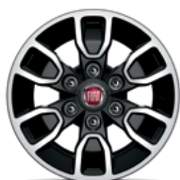
16" alloy rims