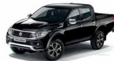
555 Black (Mica)