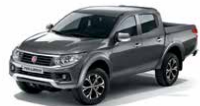
480 Titanium Grey