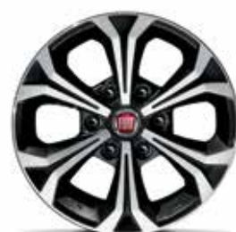
17" alloy rims