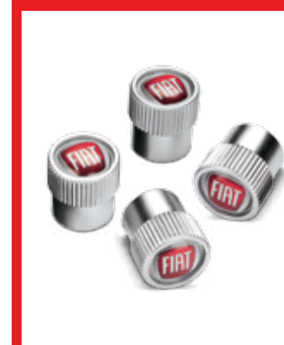
Chrome branded valve caps