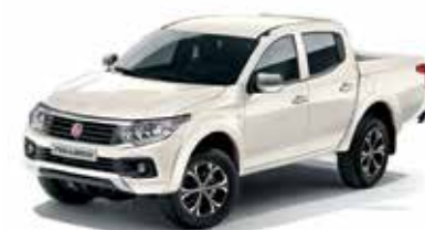
557 White (Pearl)