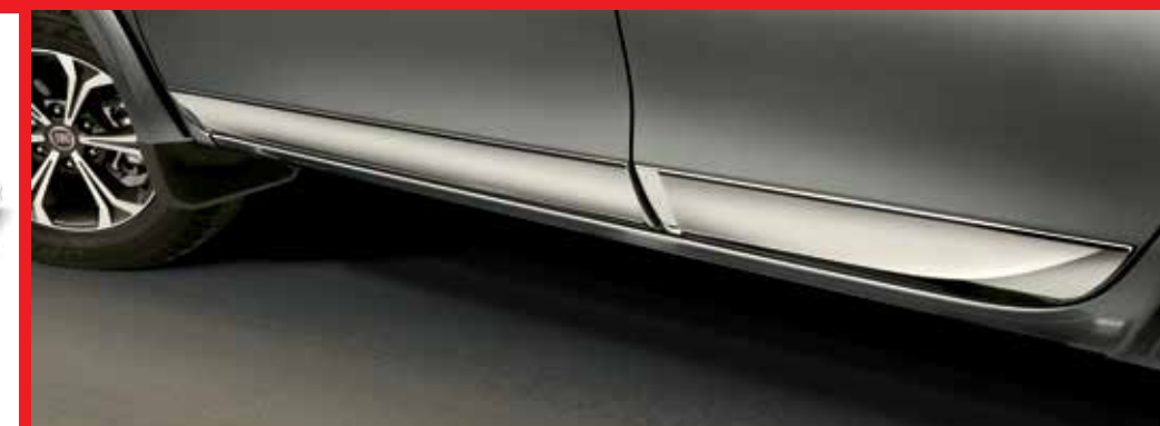
Side door garnish