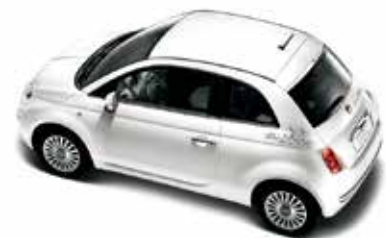
●○ New York Saloon/Cabrio version