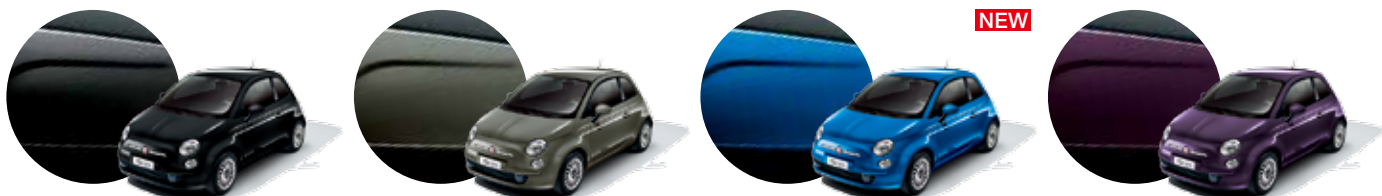
876 Crossover Black 372 Groove Metal Grey 425 Electronica Blue 528 Chillout Purple