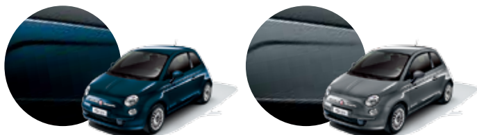
687 Epic Blue 695 Electroclash Grey