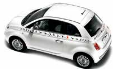
●○● Umanoide Saloon/Cabrio version