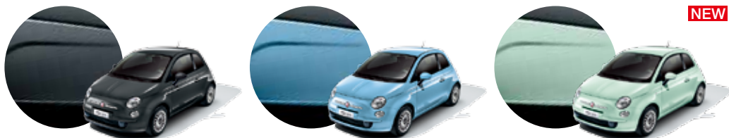
735 Tech House Grey 952 Sky Blue 166 Smooth Mint