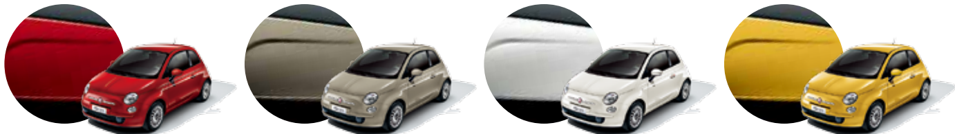
111 Pasodoble Red 231 Cappuccino Beige 268 Bossa Nova White 712 Countrypolitan Yellow