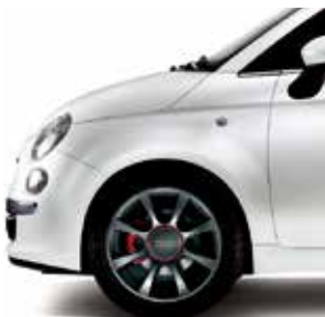
Lineaccessori 56J (16")