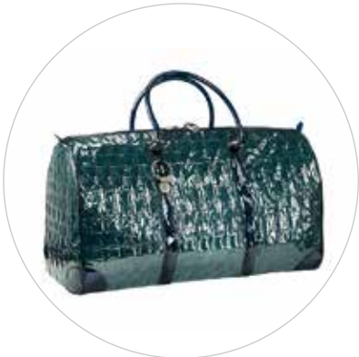
Bubble wrap holdalls.