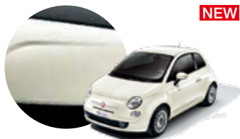
227 Urban White