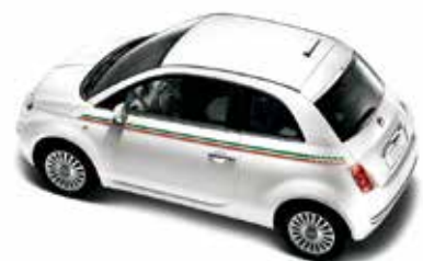
500 Italia side strip Saloon/Cabrio version