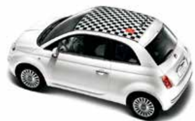
●○ Chequered roof