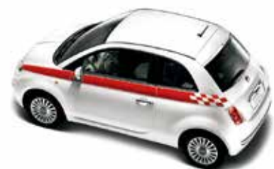
●○● Side/Sport band Saloon/Cabrio version