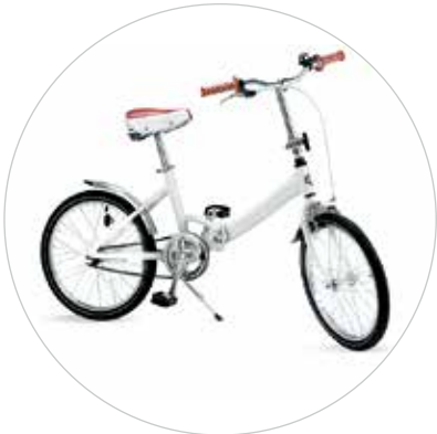
Folding bike with aluminium frame.