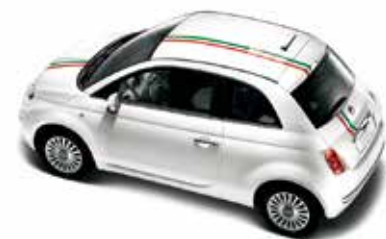
500 Italia strip