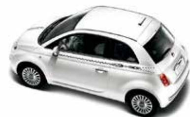
●○ Zipper Saloon/Cabrio version