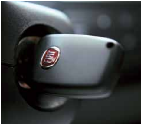
Anti-theft Engine Immobiliser with Rolling Code