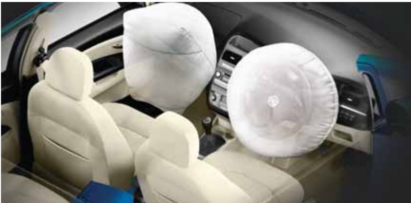
Dual Stage Front Airbags with Early Crash Sensors