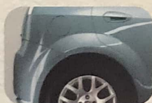
Fox Trot Azure