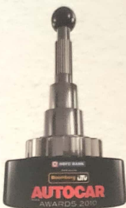
Best Design & Styling, 2010 Bloomberg UTV Autocar