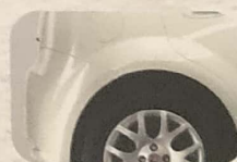
Bossa Nova White