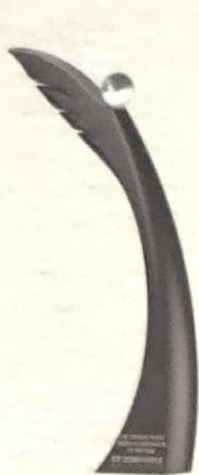
Premium Hatchback of the Year, 2010 Economic Times – Zigwheels