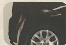
Hip Hop Black