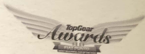
Most Beautiful Car of the Year, 2009 Top Gear