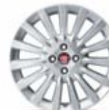
17" ALLOY WHEELS 205/45 R17 Silver colour standard (opt. 435) Standard on Sporting