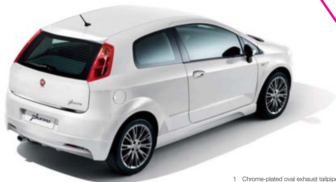
IMMAGINE COME ITALIA

“Would you like an even more aggressive Grande Punto? Then choose the new sporting kit which includes front and rear airdam, sideskirts and rear spoiler”.