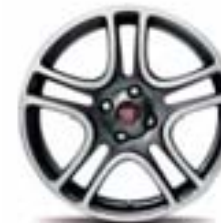
17" ALLOY WHEELS 205/45 R17 Chrome Shadow colour Optional on Sporting