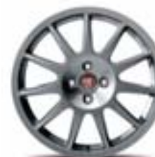
17" ALLOY WHEELS 205/45 R17 Opaque Anthracite grey colour Accessory