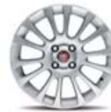
16" ALLOY WHEELS 195/55 R16 Aluminium colour Optional on Dynamic