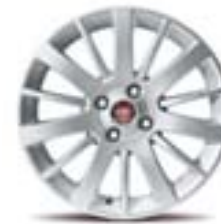
16" ALLOY WHEELS 195/55 R16 Aluminium colour Standard on Eleganza