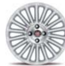
16" ALLOY WHEELS 195/55 R16 Aluminium colour Standard on GP