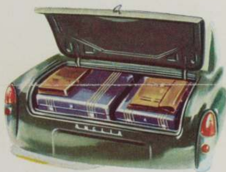
The roomy luggage boot