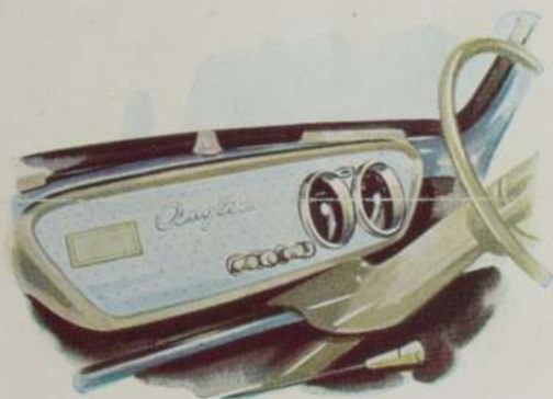
The new instrument panel

In front or back — whether driver or passenger — you can enjoy mile upon mile of comfortable relaxing travel that leaves you feeling fresh at the end of your journey. Fully opening quarter vents in the doors can ensure a constant supply of fresh air with no draughts. With perfect all round visibility and “between the axles” cushioned ride you will agree that the new Anglias and Prefects can give more room, more comfort and more pleasure than any other car in their price range. And there is plenty of room in the boot for your holiday luggage.