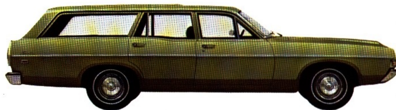
Fairlane Wagon with family-pleasing convenience and value

The lowest priced Fairlane of all is a handsome sedan. 4.1 Litre six-cylinder engine, fully synchronized transmission, a quiet, smooth ride, and handling ease that means you'll arrive refreshed even on long trips. In fact, all three models in the Fairlane series have just about everything you'd want in a car. Hardtop has ventless side glass. The items you may want to add are available at very reasonable