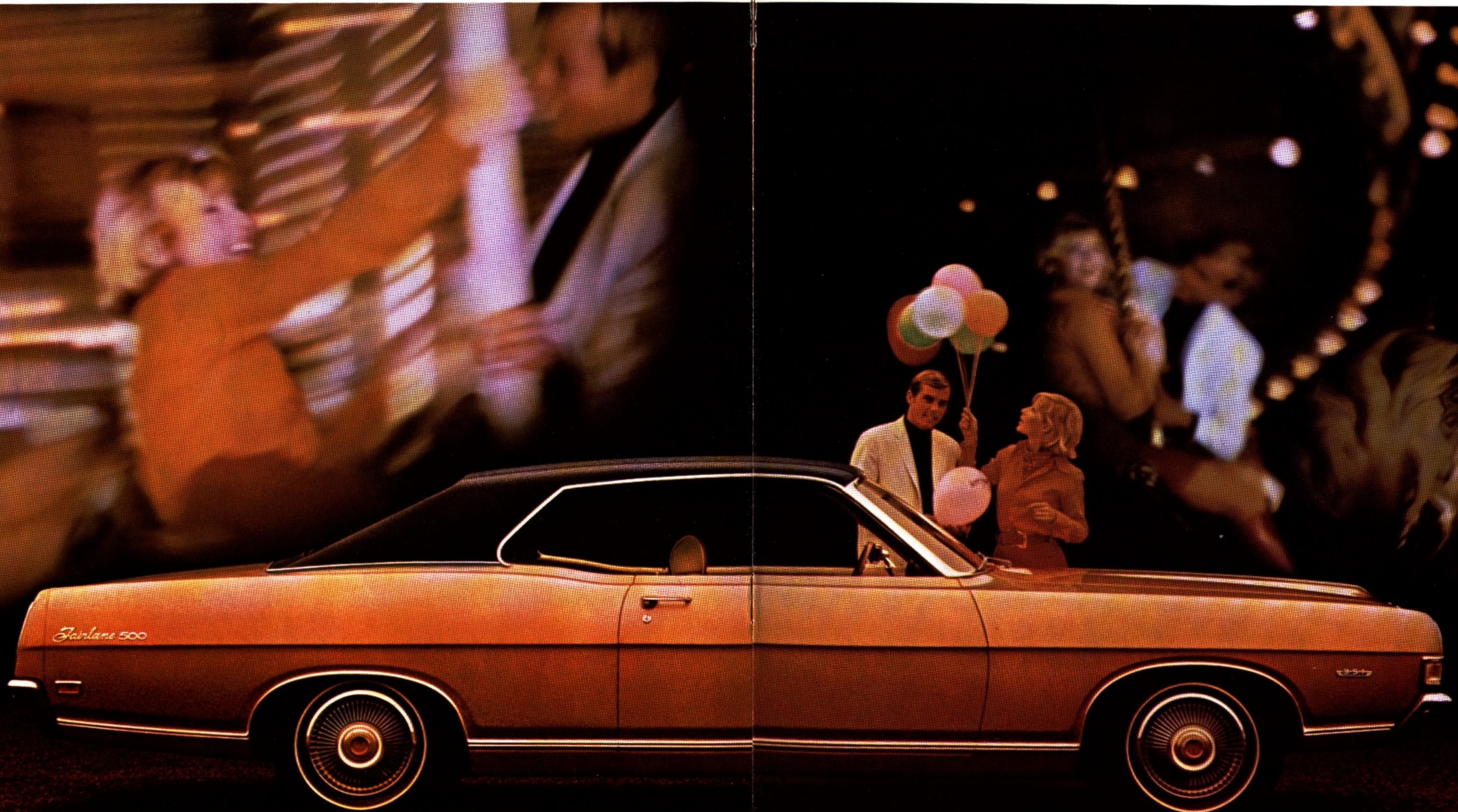
Fairlane 500 2-Door Hardtop with optional vinyl root cover and deluxe wheel covers

Fairlane 500—the way to get to where you're going in pleasing style, luxurious comfort and at a surprisingly modest price.