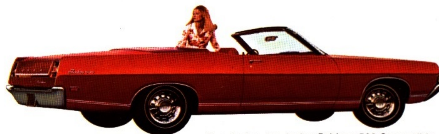
Sun-loving, fun-loving Fairlane 500 Convertible

It's a sedan, with all the advantages you get in a sedan, but its styling is definitely for the young-at-heart. Fashion-right bright accents highlight the exterior. You can get the optional deluxe wheel covers like those on the sedan above, or styled steel wheels like those on the convertible at left, depending on your taste. And inside, strictly first cabin. New instrument cluster with brushed aluminum dials, very attractive teak-toned