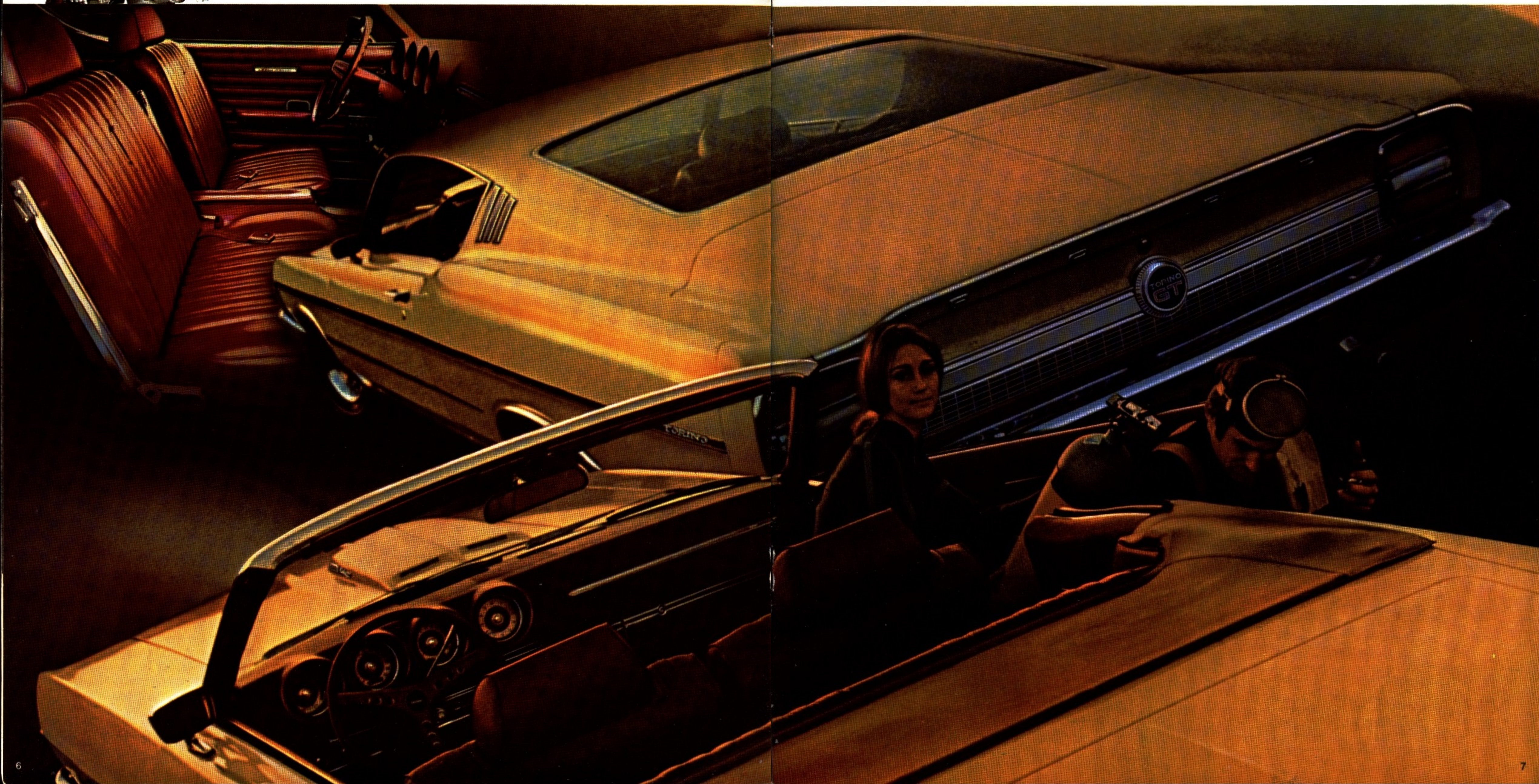
Ford Torino GT Convertible, pacesetter with the young-at-heart