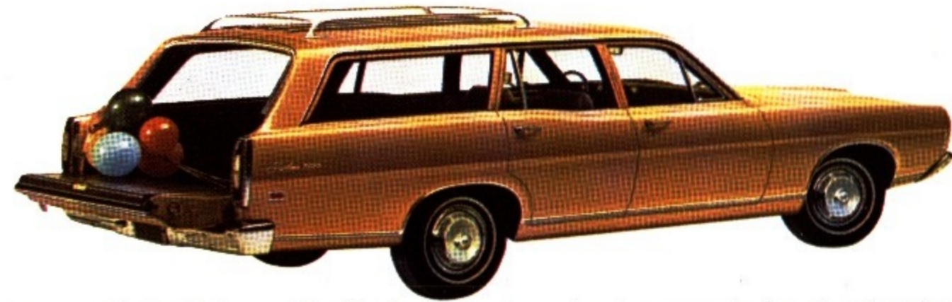
Fairlane 500 Wagon with Ford's better idea Magic Doorgate, and extra-convenient roof rack option

Fairlane 500. For people who take their fun seriously.