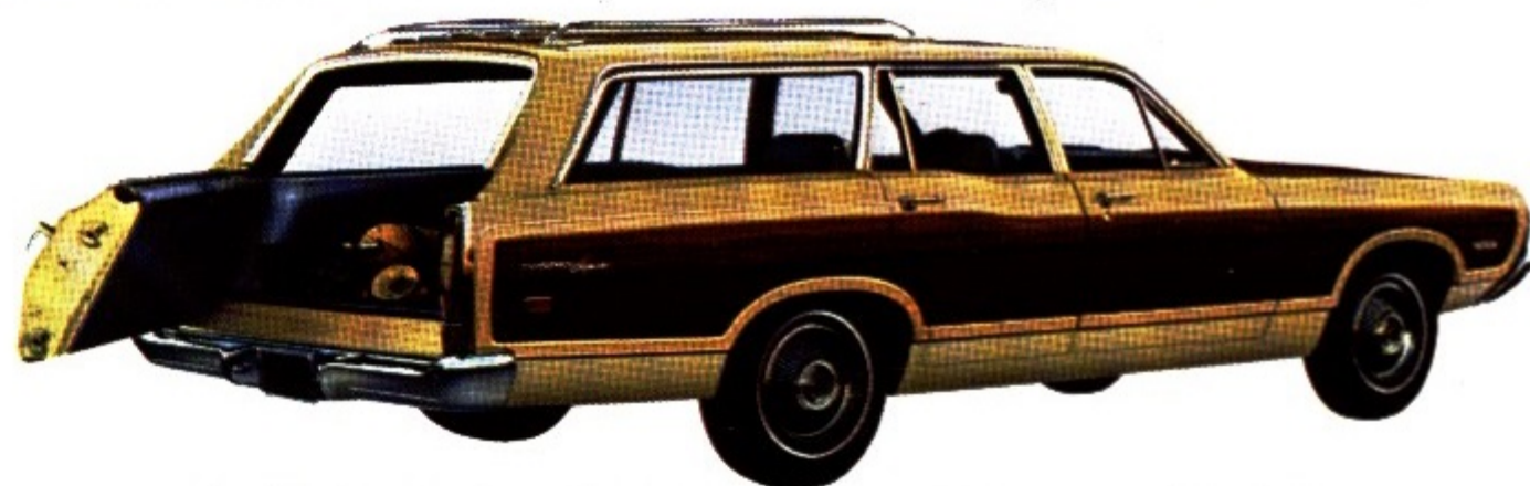
Ford Torino Squire, with Better Idea convenient two-way Magic Doorgate

1969 Ford Torino. New performance car? Or new luxury car? Yes.