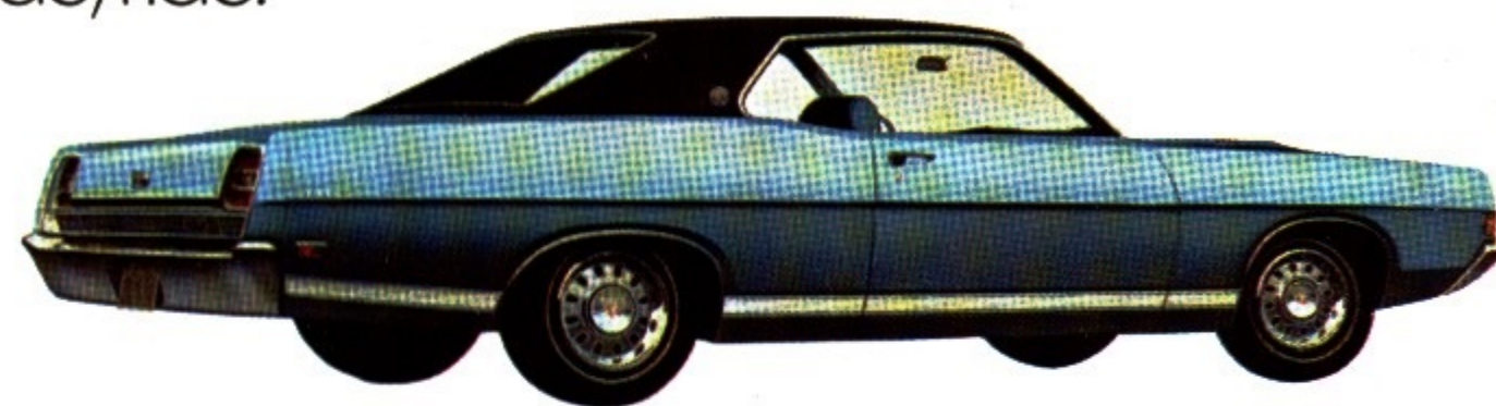
Ford Torino GT 2-Door Hardtop with luxurious leather-grain vinyl roof cover

Torino GT's—active new trio, born with a moving second-to-none approach. Two-door SportsRoof, 2-Door Hardtop, and Convertible. Take your choice.