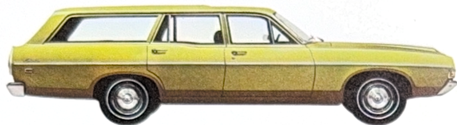
Fairlane Wagon with family-pleasing convenience and value

The lowest priced Fairlane of all is a handsome sedan. 4.1 Litre six-cylinder engine, fully synchronized transmission, a quiet, smooth ride, and handling ease that means you'll arrive refreshed even on long trips. In fact, all three models in the Fairlane series have just about everything you'd want in a car. Hardtop has ventless side glass. The items you may want to add are available at very reasonable