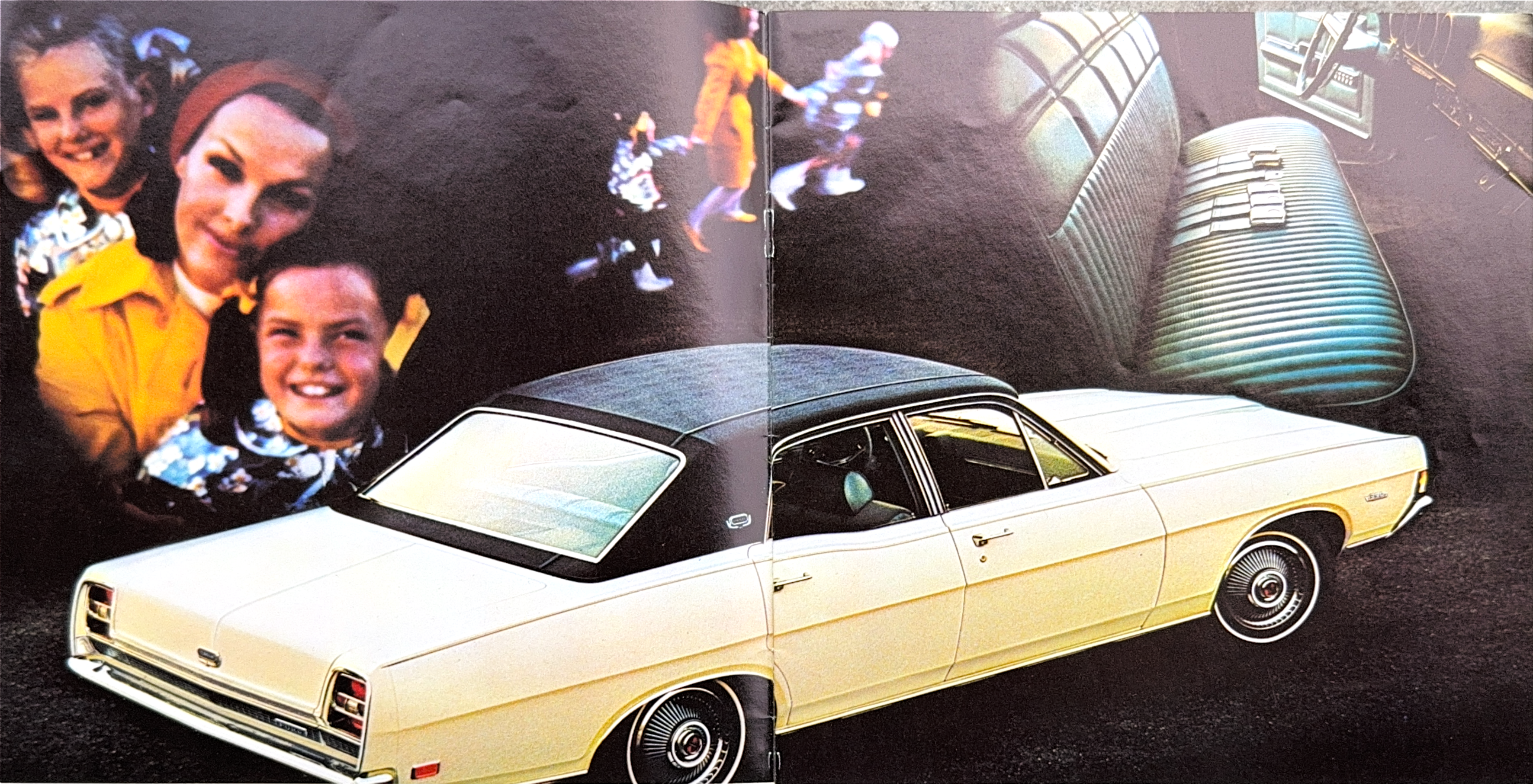
Ford Torino 4-Door Sedan—quick size, loaded with luxury, at a modest price

1969 Ford Torino. New performance car? Or new luxury car? Yes.