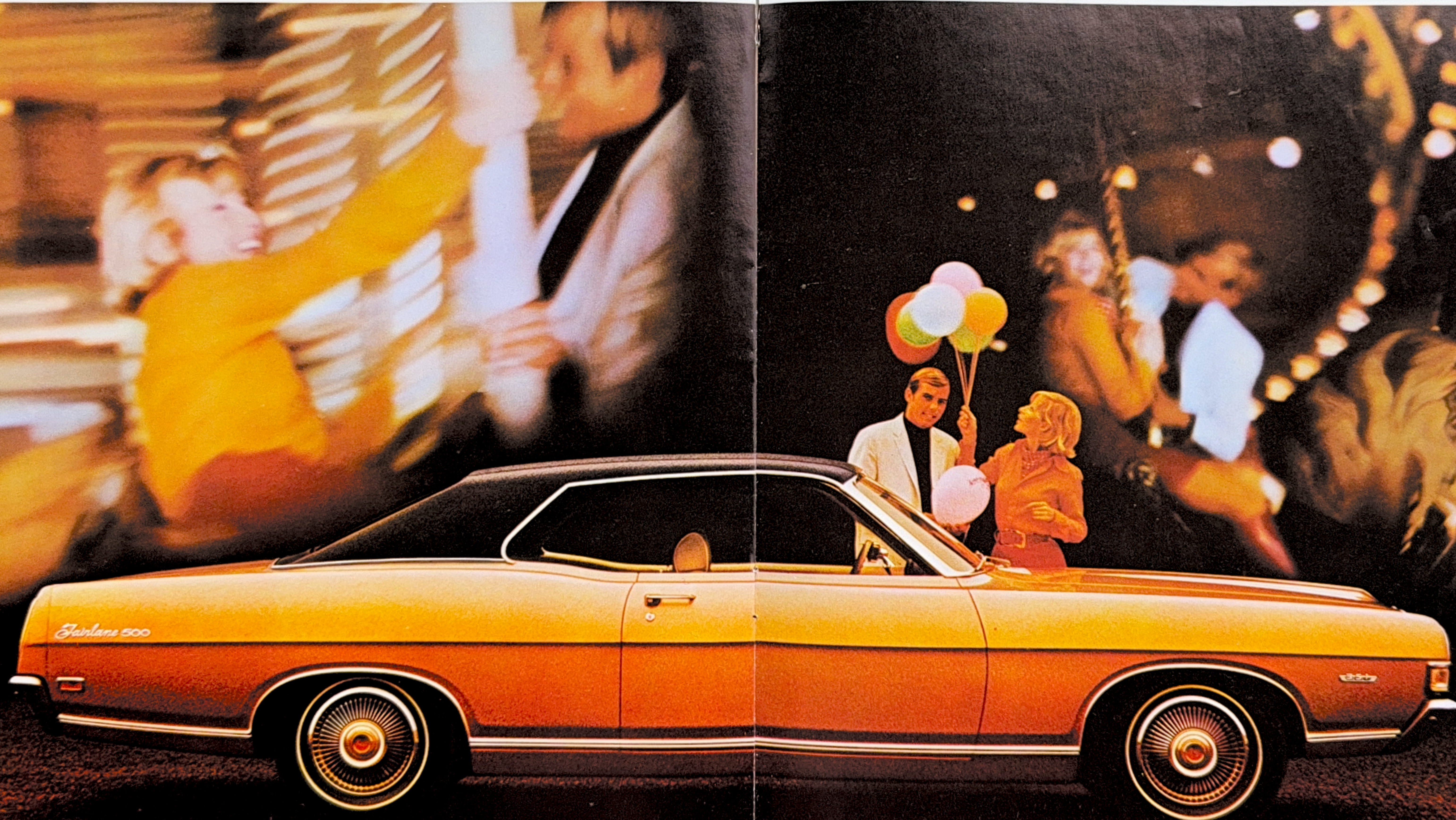
Fairlane 500 2-Door Hardtop with optional vinyl roof cover and deluxe wheel covers

Fairlane 500—the way to get to where you're going in pleasing style, luxurious comfort and at a surprisingly modest price.