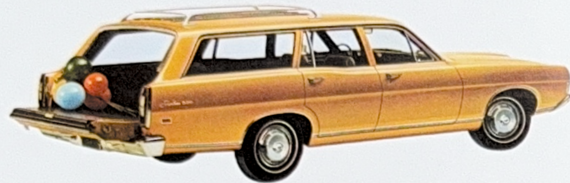
Fairlane 500 Wagon with Ford's better idea Magic Doorgate, and extra-convenient roof rack option

Fairlane 500. For people who take their fun seriously.