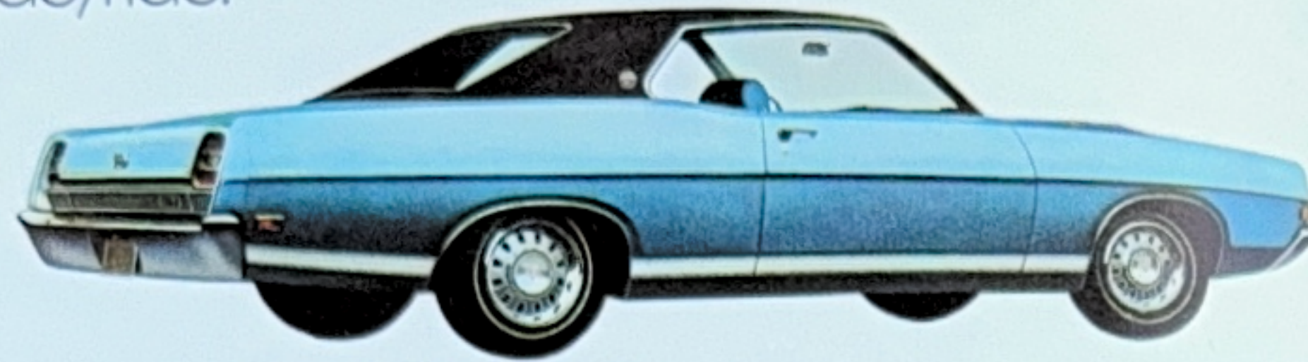
Ford Torino GT 2-Door Hardtop with luxurious leather-grain vinyl roof cover

Torino GT's—active new trio, born with a moving second-to-none approach. Two-door SportsRoof, 2-Door Hardtop, and Convertible. Take your choice.