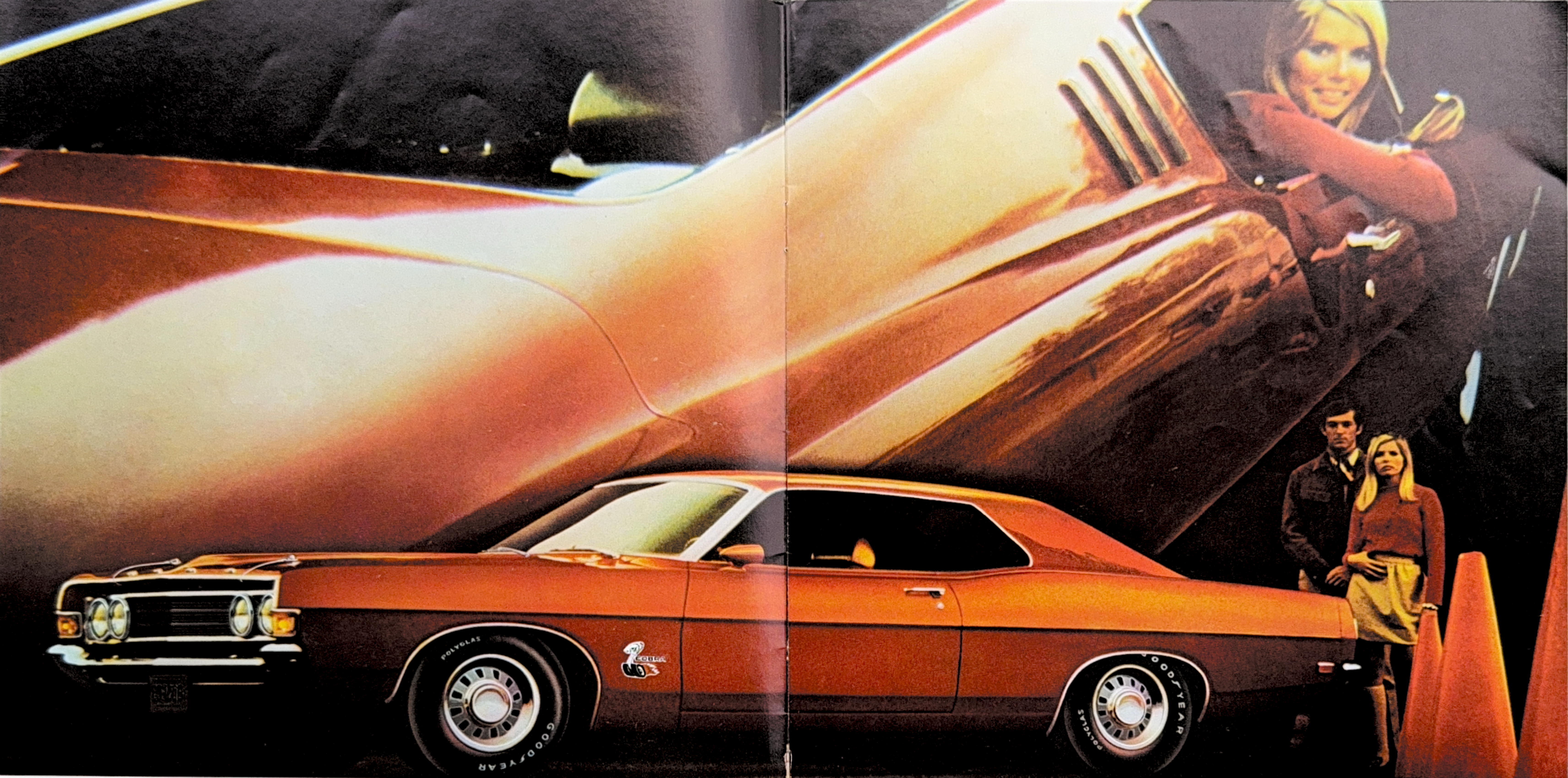
Cobra 2-Door Hardtop, born to move