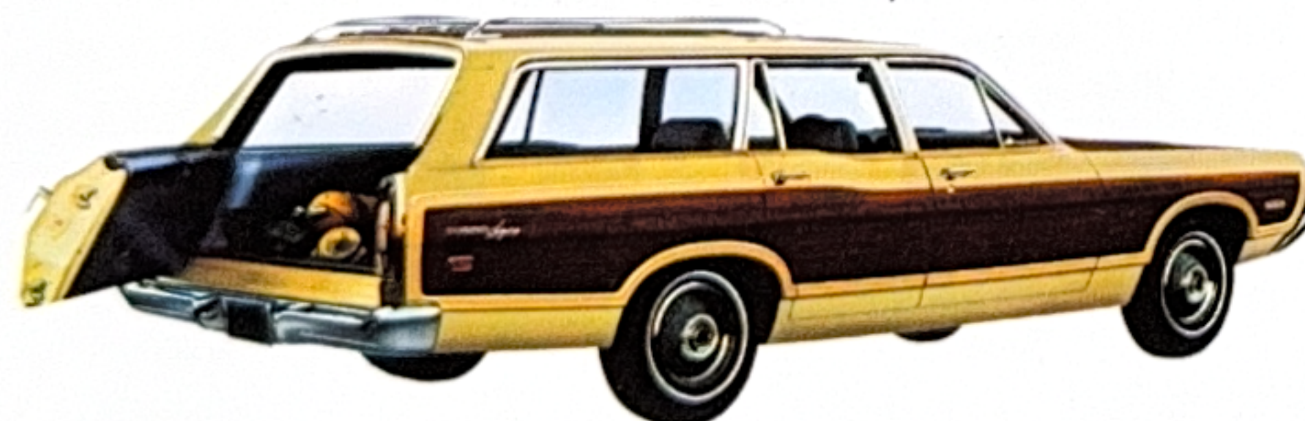
Ford Torino Squire, with Better Idea convenient two-way Magic Doorgate

1969 Ford Torino. New performance car? Or new luxury car? Yes.