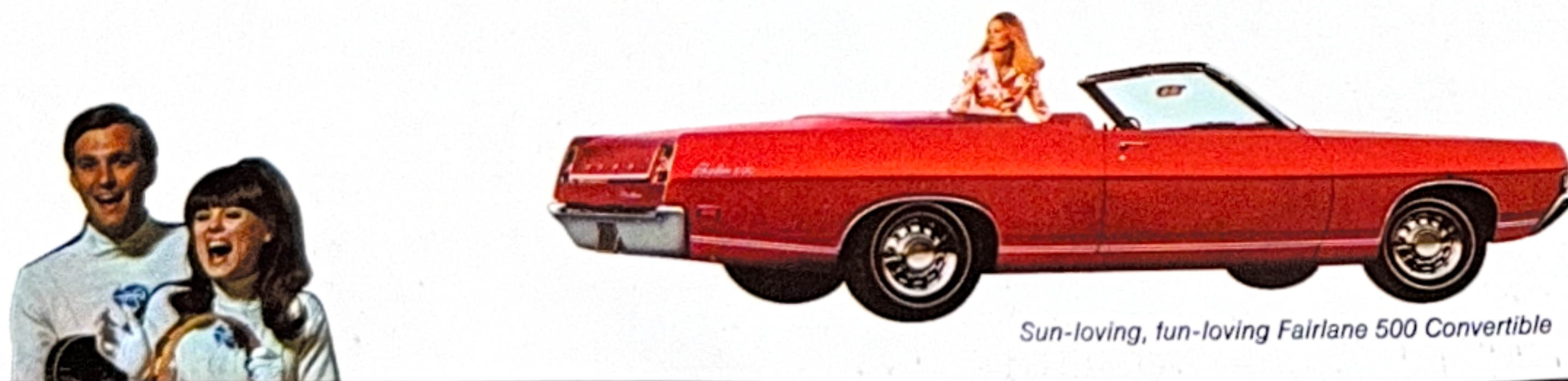
Sun-loving, fun-loving Fairlane 500 Convertible

Fairlane 500. Merry-go-round with captivating ways.