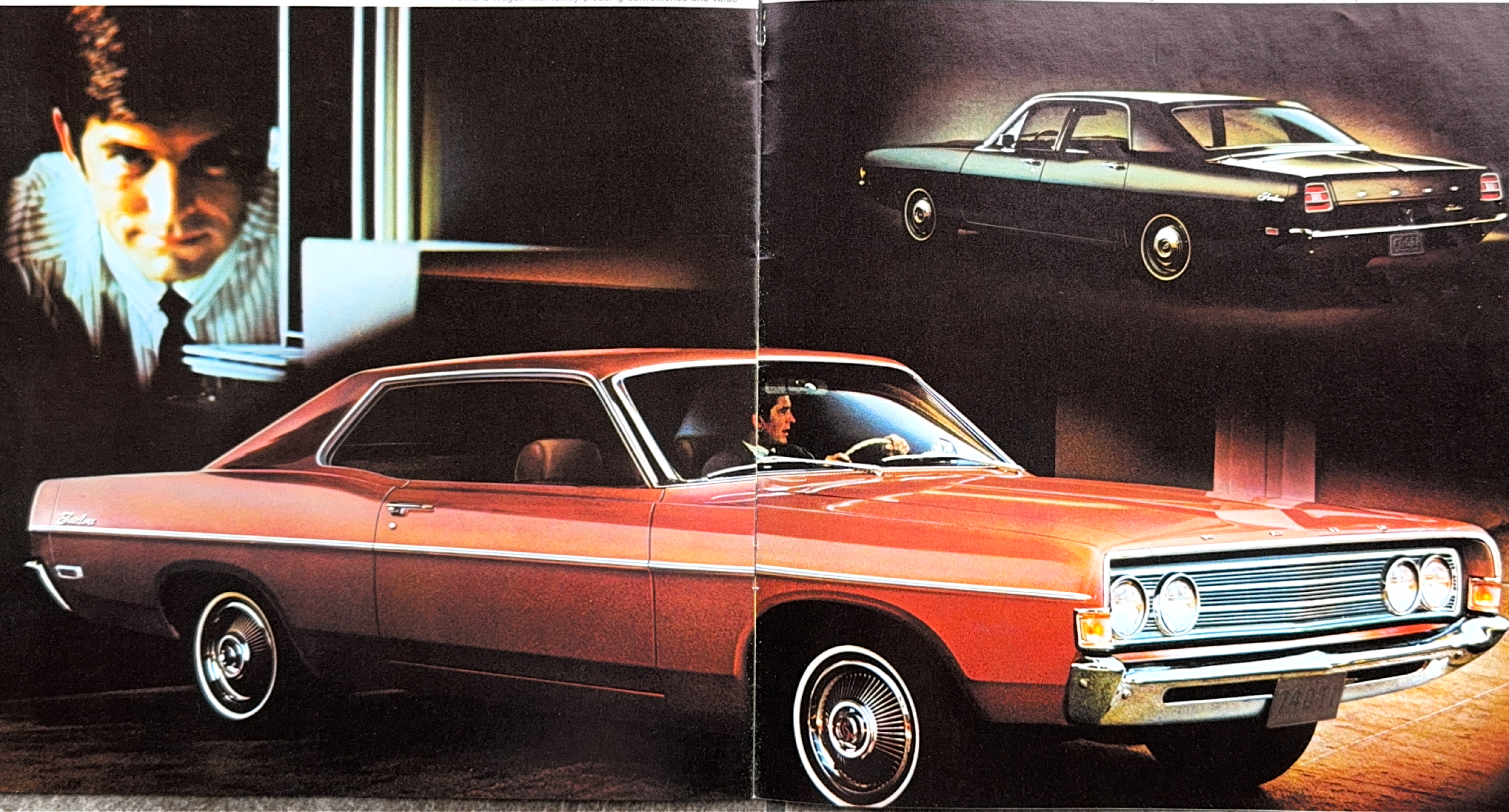
Fairlane 4-Door Sedan, roomy better idea for the value-conscious