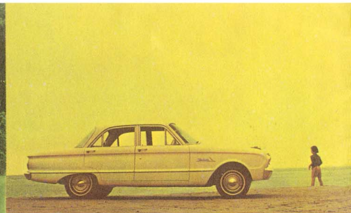
Falcon Fordor Sedan

sized and priced right between Galaxie & Falcon