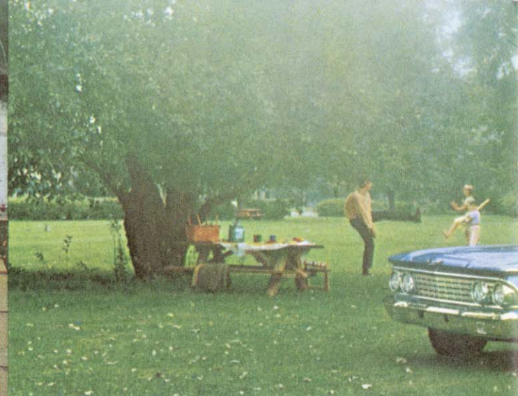
Fairlane Club Sedan

Whatever you're looking for in a new car... look to the long Ford line