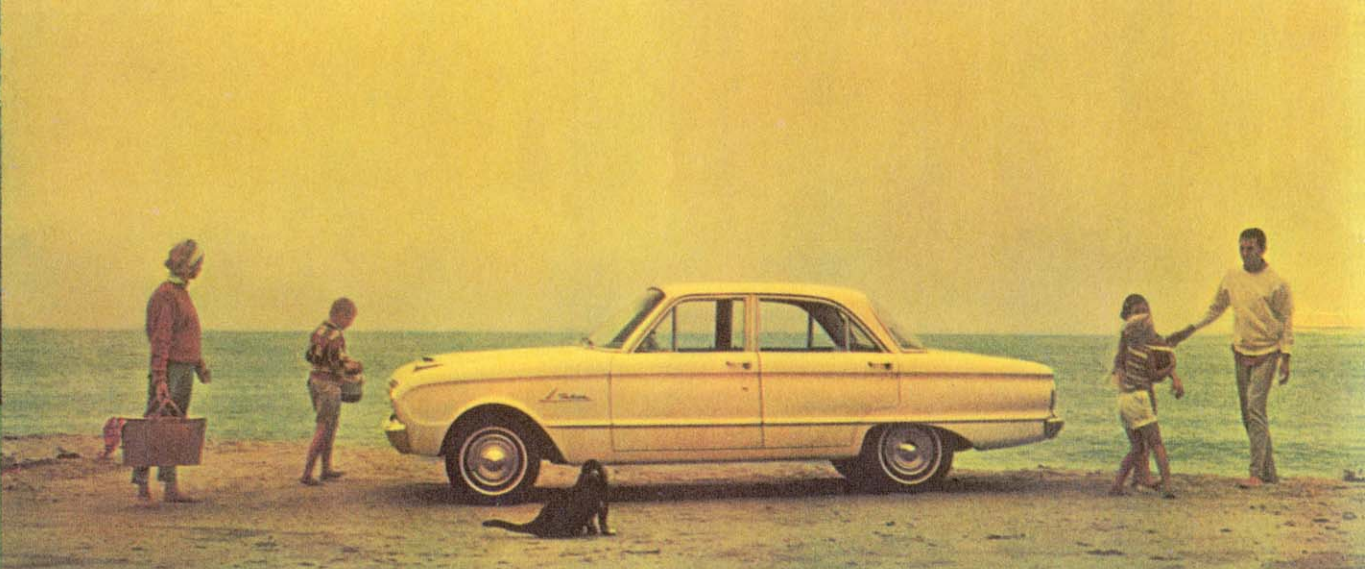
Falcon Fordor Sedan

Choose from a rainbow of colors . . . a treasure chest of new features . . . a rich variety of special models. Never before have you seen a line of Fords so long, so varied, so beautifully built to serve your needs. On this page are a few variations of the basic models . . . and there are many more which your dealer will be pleased to show you. Words