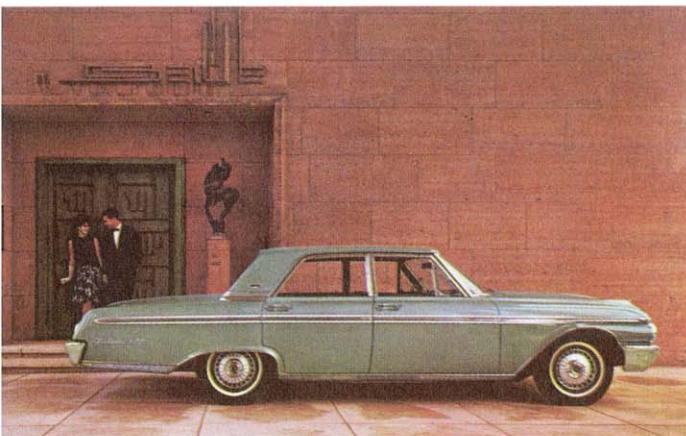
Galaxie/500 Town Sedan