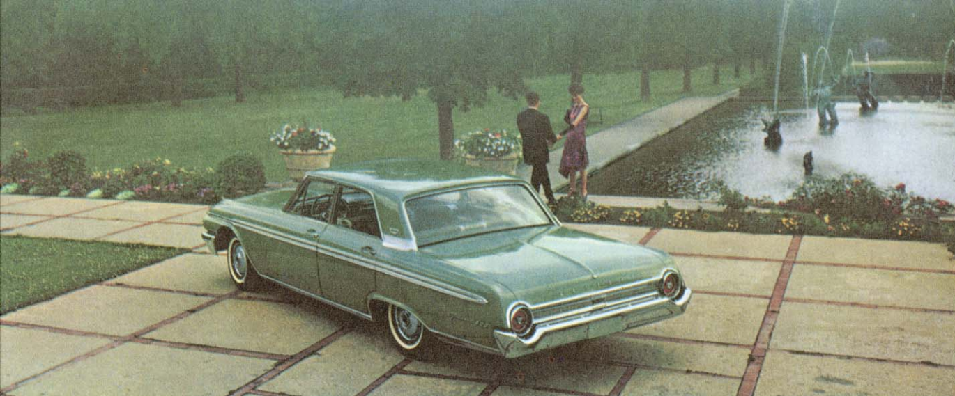
Galaxie/500 Town Sedan