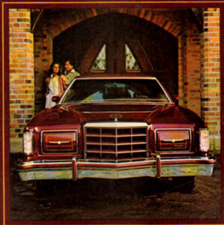
Thunderbird Heritage for 1979