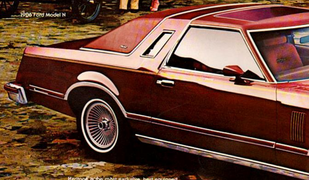
1906 Ford Model N

Heritage is the most exclusive, best equipped new Thunderbird we offer today. It has the classic styling and spirit which have made "Thunderbird" a legend. It also is built with the distinctive custom touches that you would expect in an automobile of its class. So, it is only logical that your finely tuned instinct should tell you that Heritage is your kind of automobile.