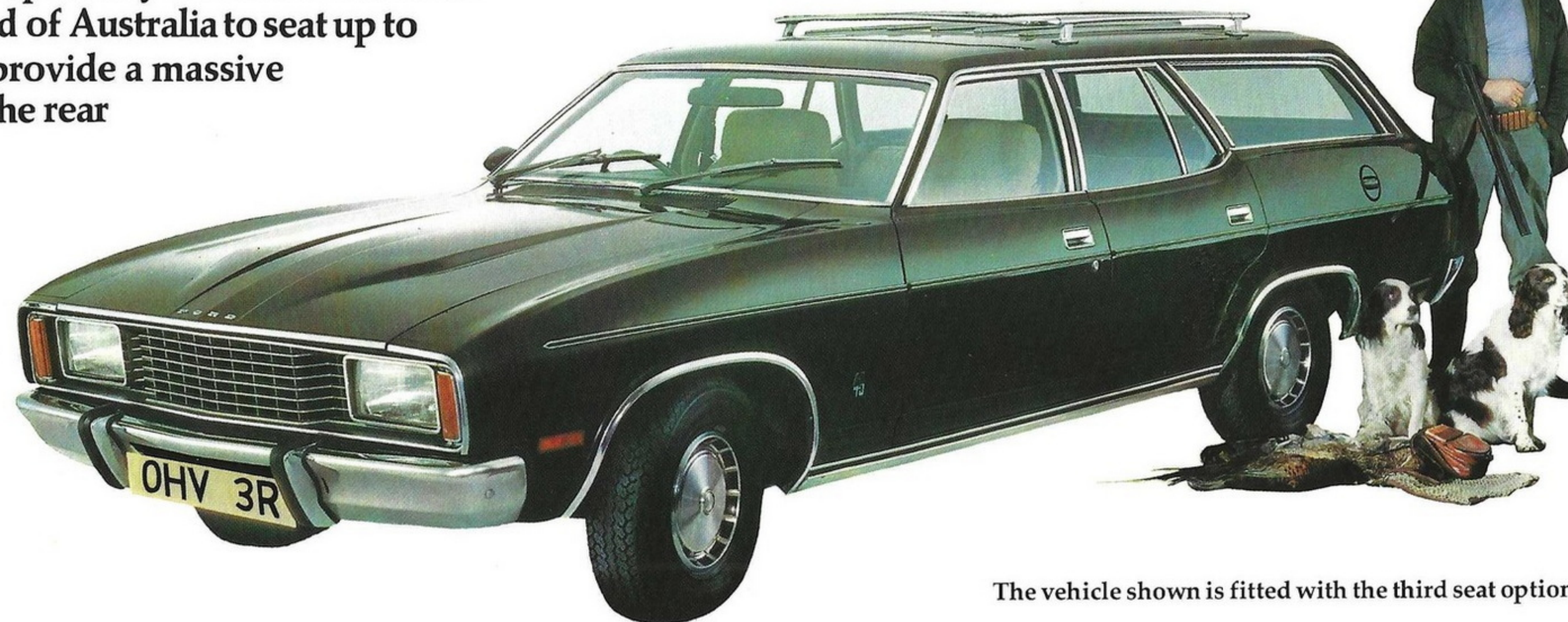
The vehicle shown is fitted with the third seat option.

The Fairmont Estate offers more space, combined with more power than any European car. Its tireless low-revving 4.9 litre V8 engine has power to spare, even under full load conditions. Its handling characteristics are superb, and with its progressive-feel power steering it requires only 2.6 turns of the steering wheel from lock to lock.