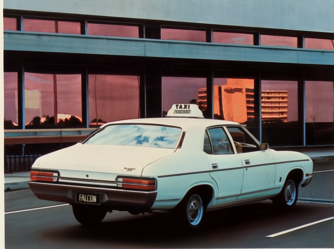
Illustrated above: Falcon 500 Taxi.

Track — Front: 1539 mm (60.6"). Rear: 1526 mm (60.1").