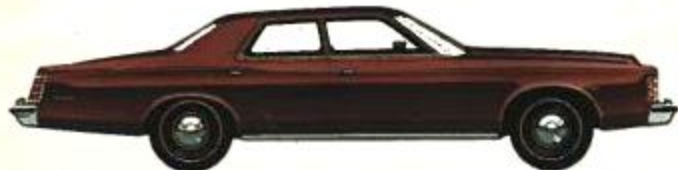
Custom 500 4-Door Pillared Hardtop, Ginger Glow (Code 5J) Custom 500 2-Door Pillared Hardtop