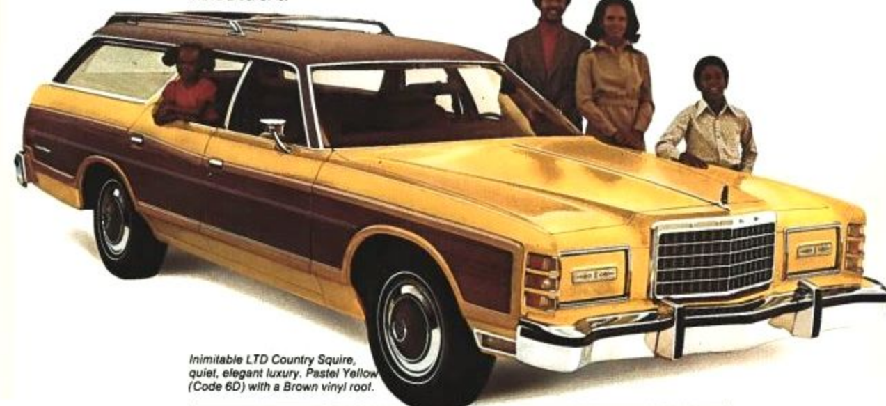
Inimitable LTD Country Squire, quiet, elegant luxury. Pastel Yellow (Code 6D) with a Brown vinyl roof.

A wide array of options is listed on page 11. Complete Wagon details are in the 1975 Wagon catalog, available at your Ford Dealer's.