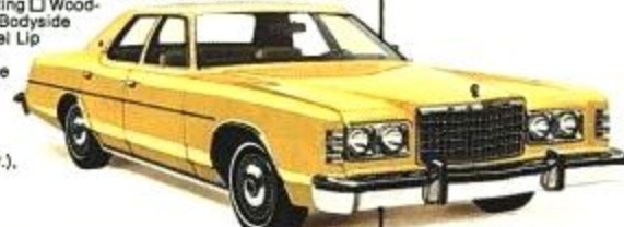
LTD 4-Door Pillared Hardtop in Light Green (Code 47).

Wheelbase 121.0" □ Length 223.9" □ Height 53.7" (2-Dr.), 54.3" (4-Dr.) □ Width 79.5" □ Fuel Capacity (gal.) 20 □ Curb Weight (lb.) 2-Dr. Pillared Hardtop 4528, 4-Dr. Pillared Hardtop 4580 □ Passenger Capacity—6.