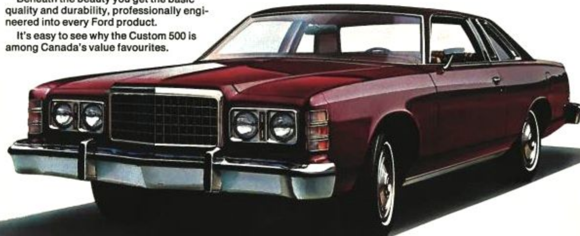
Ford Custom 500 2-Door Pillared Hardtop in Maroon Metallic (Code 2Q) with Red vinyl roof.

It's easy to see why the Custom 500 is among Canada's value favourites.