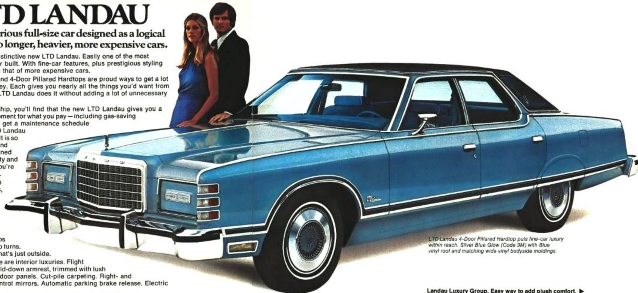
LTD Landau 4-Door Pillared Hardtop puts fine-car luxury within reach. Silver Blue Glow (Code 3M) with Blue vinyl roof and matching wide vinyl bodyside moldings.

Wheelbase 121.0" □ Length 223.9" □ Height 53.7" (2-Dr.), 54.8" (4-Dr.) □ Width 79.5" □ Fuel Capacity (gal.) 20 □ Curb Weight (lb.) 2-Dr. Pillared Hardtop 4625, 4-Dr. Pillared Hardtop 4657 □ Passenger Capacity—6.