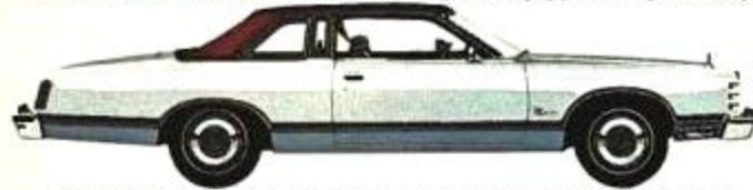
LTD LANDAU 2-Door Pillared Hardtop, Silver Metallic (Code 1G)