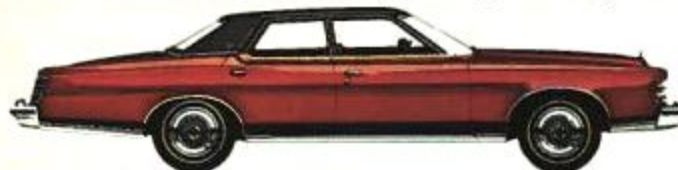
LTD BROUGHAM 4-Door Pillared Hardtop, Candyapple Red (Code 2E)