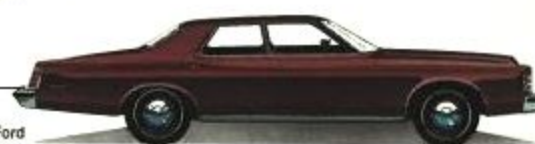
Ford Custom 500 4-Door Pillared Hardtop in Ginger Glow (Code 5J).