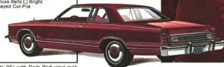
LTD Landau 2-Door Hardtop in Candyapple Red (Code 2E) with Dark Red vinyl roof.

Impressive standard Landau interior features a soft, yet durable, luxurious Niles Knit Cloth shown in Dark Red (Code HD). Black, Blue, Green, Saddle or Tan are other color choices. All-vinyl trim, in the same colors, except Black, is optional. White all-vinyl can be ordered on 2-Door models. Flight bench seat, with a single plush center armrest, is deep-cushioned for comfort. Note padded door panels with woodtone accents. Convenience Group refinements like right- and left-hand remote control mirrors, automatic parking brake release, electric trunk lid release, and more.