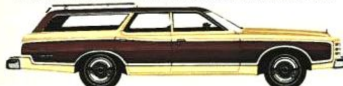
Wagonmaster Wagons: LTD Country Squire, 4-Door, Pastel Yellow (Code 6D), LTD Wagon, Custom 500 Wagon

The closer you look, the better we look.