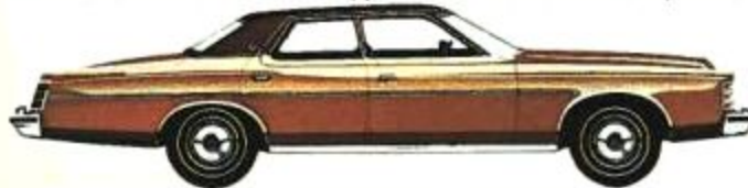
FORD LTD 4-Door Pillared Hardtop, Tan Glow (Code 5U)