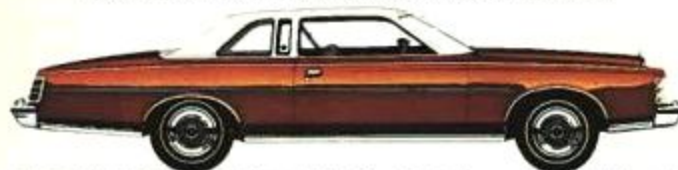
LTD BROUGHAM 2-Door Pillared Hardtop, Dark Copper Metallic (Code 5Y)