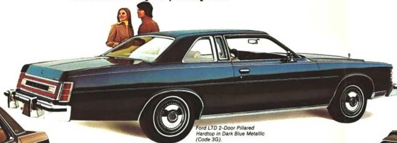
Ford LTD 2-Door Pillared Hardtop in Dark Blue Metallic (Code 3G).

Roomy, six-passenger comfort. In 2-Door or 4-Door Pillared Hardtop. With the luxury and convenience features that have long been associated with LTD. Plus even greater news.