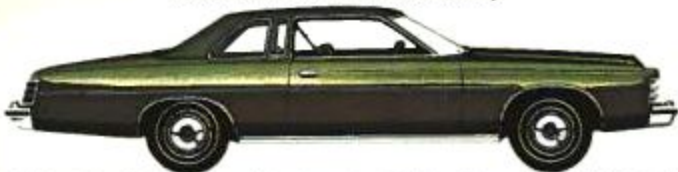
FORD LTD 2-Door Pillared Hardtop, Dark Yellow Green Metallic (Code 4V)