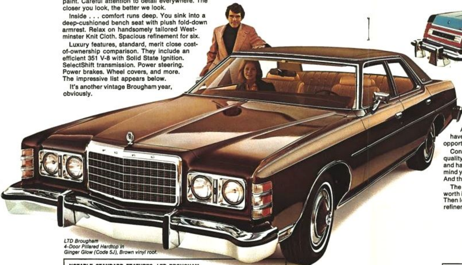
LTD Brougham 4-Door Pillared Hardtop in Ginger Glow (Code 5J), Brown vinyl roof.

It's another vintage Brougham year, obviously.