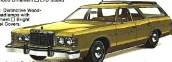
Popular LTD Wagon in Green Glow (Code 4T) is big on quality, comfort and ride.

*Plus 9.1 cu. ft. of lockable below-deck storage, and 5.4 cu. ft. with Dual Facing Rear Seats.