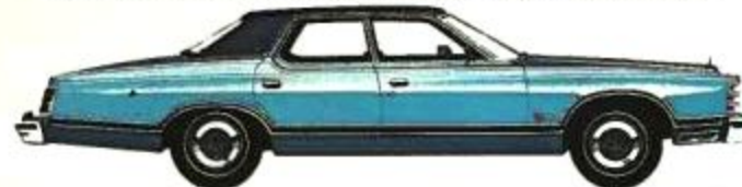
LTD LANDAU 4-Door Pillared Hardtop, Silver Blue Glow (Code 3M)