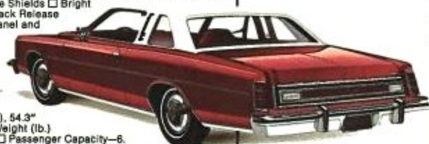
LTD Brougham 2-Door Pillared Hardtop in Candyapple Red (Code 2E), White vinyl roof.

Wheelbase 121.0" □ Length 223.9" □ Height 53.7" (2-Dr.), 54.3" (4-Dr.) □ Width 79.5" □ Fuel Capacity (gal.) 20 □ Curb Weight (lb.) 2-Dr. Pillared Hardtop 4585, 4-Dr. Pillared Hardtop 4598 □ Passenger Capacity—6.