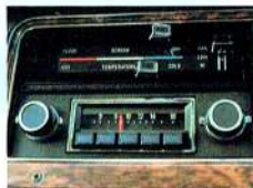
Push-button radio ('L' model option)

(c) Body protection group includes full length side protection strips, and front and rear bumper over-riders.