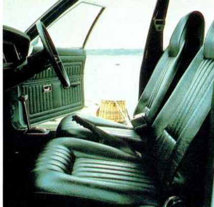
Cortina L interior with optional T-bar automatic transmission.