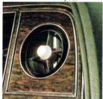
New ball-vent controls.