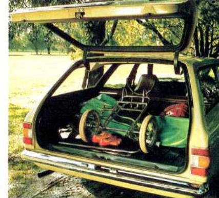
One-piece counter-balanced rear door — 1.81m 3 load space