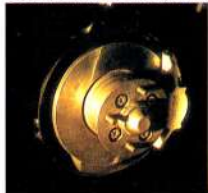
Power front disc brakes.