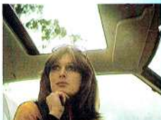
Sliding Steel Sunroof.