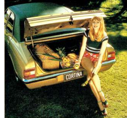
12 cubic feet luggage capacity.