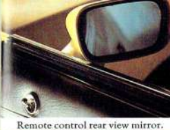
Remote control rear view mirror.