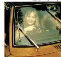
Articulated windscreen wipers.