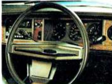
Sports steering wheel and GS dash.

WARRANTY: Ford* warrants with respect to each new passenger or light commercial vehicle sold by Ford that for a period of 12 months or 20,000 kilometres (whichever first occurs) from the date of original retail sale Ford will repair or replace free of charge any part of such vehicle (except tyres) found to be defective in factory materials or workmanship under normal use and operation within Australia PROVIDED THAT: