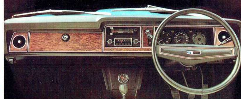
Cortina XLE dash.