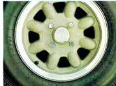
Sports road wheels with std. locking nut.