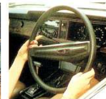
Dual column-control stalks.