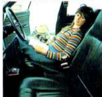
Seats recline to any position.