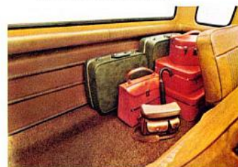
3. Big 44-cu. ft. cargo space is easy to reach from either side behind split-back front seat.