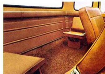
2. Jump seats (optional) have foam-padded cushion and back, fold out of way quickly when not in use to clear floor.