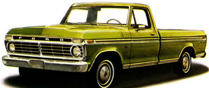
F-100 Ranger XLT with regular cab. Shown with optional whitewall tires, wheel covers and rear bumper.

SuperCab's large 15x15-inch rear side windows are standard. Flip-open feature optional... plain or tinted glass.