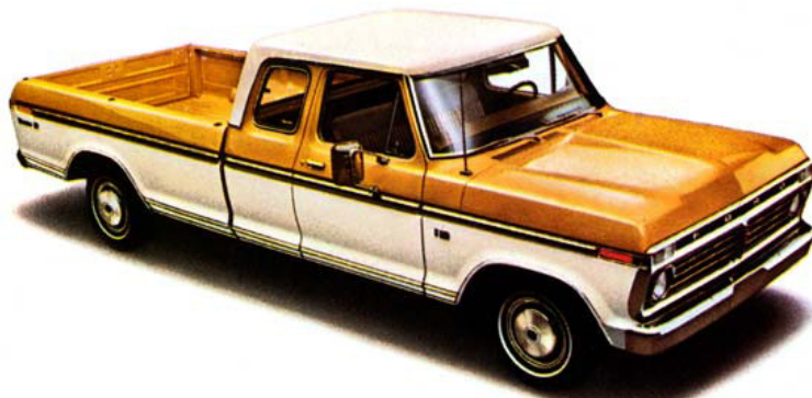
F-250 Ranger XLT SuperCab shown (here and on front cover) with optional rear seat, two-tone paint, whitewall tires, wheel covers, rear bumper, flip-open side windows, radio and low-mount Swing-Lok mirrors.