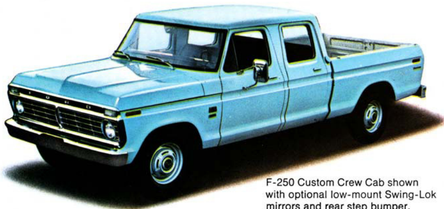
F-250 Custom Crew Cab shown with optional low-mount Swing-Lok mirrors and rear step bumper.