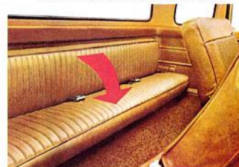
1. Foam-padded rear seat (optional) folds flat with steel-ribbed back to make load floor.