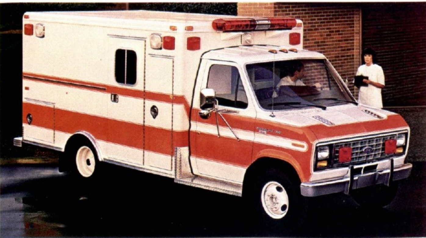
E-350 Ambulance Prep Package, with ambulance body.