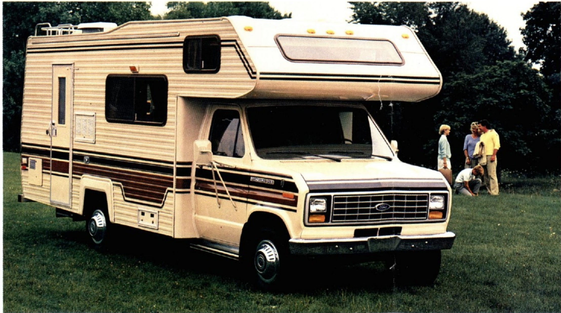
Econoline RV Cutaway features dual rear wheels and a payload capacity up to 6,270 pounds (11,000-lb. GVWR).

The three gasoline engines offered within the Econoline Series — the 4.9L, 5.8L and 7.5L — all feature multiple-port electronically controlled fuel injection. The benefit: precise fuel metering for good fuel economy, enhanced overall response plus easy start up in extreme temperatures.