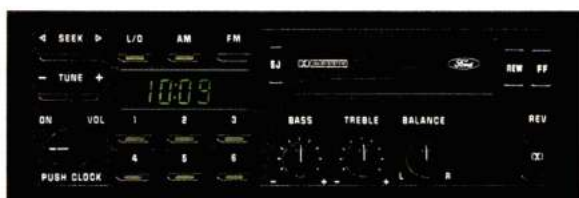
Electronic AM/FM stereo radio with cassette tape