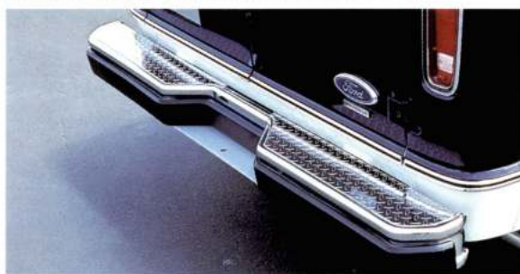
Chrome rear step bumper