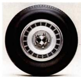
Sport wheel covers (E-150 only)