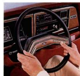
Speed control and tilt steering wheel