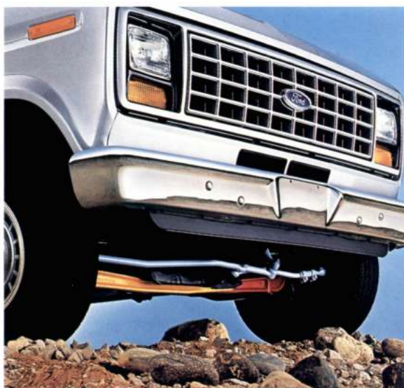
Twin-I-Beam independent front suspension

This Ford-engineered independent front suspension system is yet another feature found only in an Econoline cargo van. Each wheel has its own forged I-beam axle and separate big coil spring to handle rough road conditions independently. And the front coil springs are computer-selected to match automatically the gross vehicle weight rating (GVWR) and the weight of optional equipment.