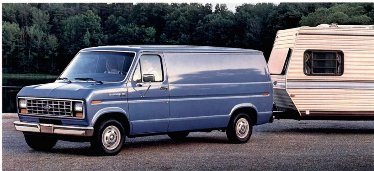
Econoline Van, properly equipped, is engineered to tow a heavy boat or trailer.