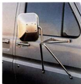
Bright swing-out recreational mirrors

Among the features of this electronic stereo system are Dolby® noise reduction, seek tuning that selects the next listenable station either up or down scale, manual tuning, and fast forward/rewind buttons for the cassette tape. Also, separate bass/treble controls and left/right balance. New features for 1987 include a power amplifier and an electronic digital clock.