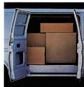
Hinged side cargo doors (no extra cost)