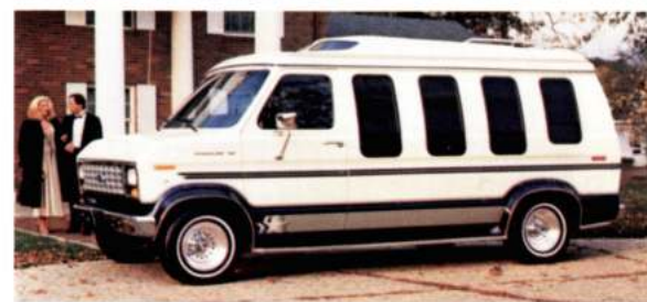
Econolines with aftermarket custom van conversions.