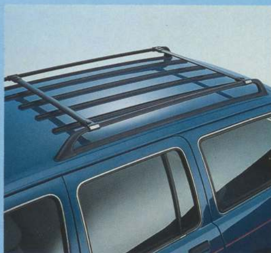
Estate loadability is combined with a stylish and practical built-in roof rack, two high-quality suit cases and an overnight bag.