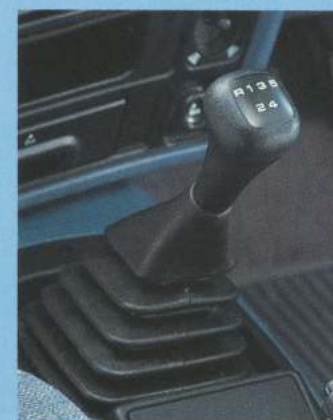
Interior fittings include 'Fife' fabric trim, adjustable head restraints on the front seats, driver's seat height adjustment, remote control door mirrors, Self-Seek AM Cassette and a trinket tray/centre console.

But that's not all. The 1.8 L Estate Special's value-for-money attractions also include a stylish and very practical built-in roof rack whose efficient design is shared with the prestigious and technically advanced four-wheel-drive Sierra Ghia Estate. Ideal for the sort of loads that can pose big problems — surfboards, maybe, or the bulky equipment for a de luxe camping holiday — the rack is designed for loads weighing up to 75 kg or 165 lb. That's the equivalent of a fairly hefty male passenger.