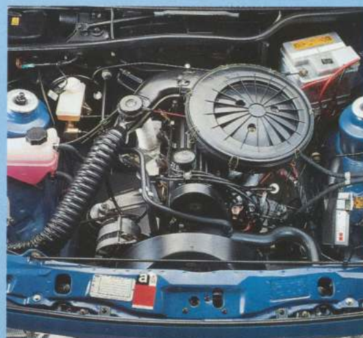
The Sierra L Estate Special's 1.8 OHC 'lean burn' engine is paired with a five-speed gearbox to provide mile eating performance.